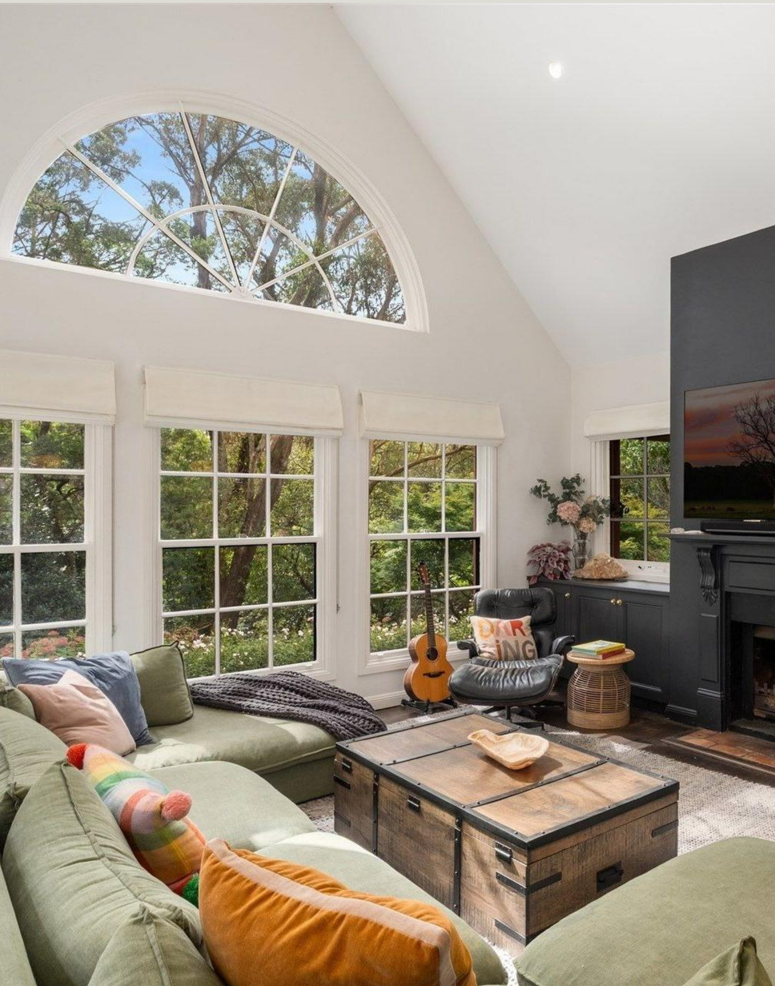
7 Harnett Lane, Mittagong, NSW