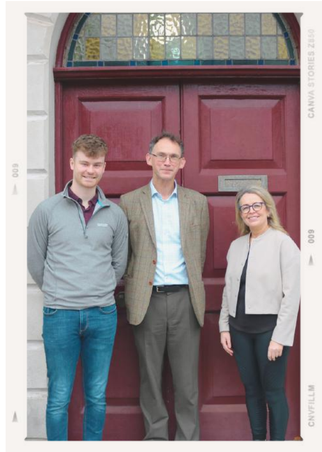
1-1 Weekly Meetings with Industry Mentors