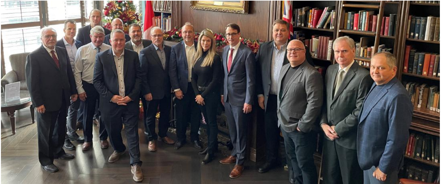
Board members with the Honorable Monte McNaughton, Minister of Labour, Immigration, Training and Skills Development