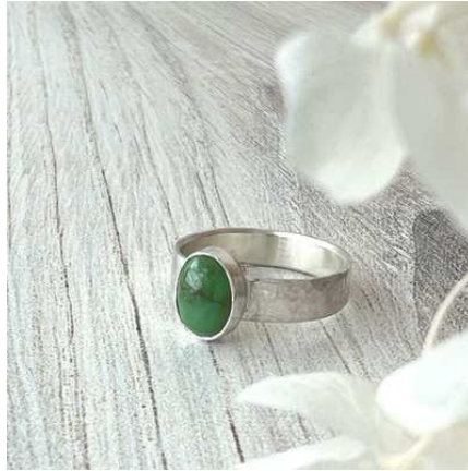
Sonoran Turquoise Ring