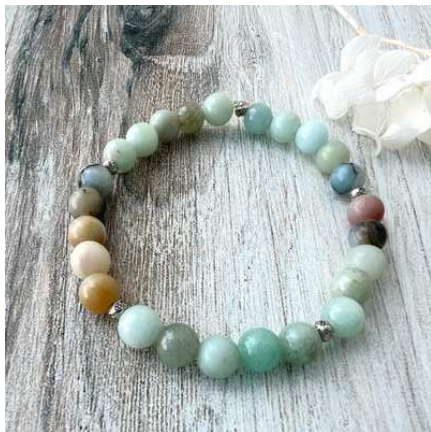
Peaceful Energy Bracelet