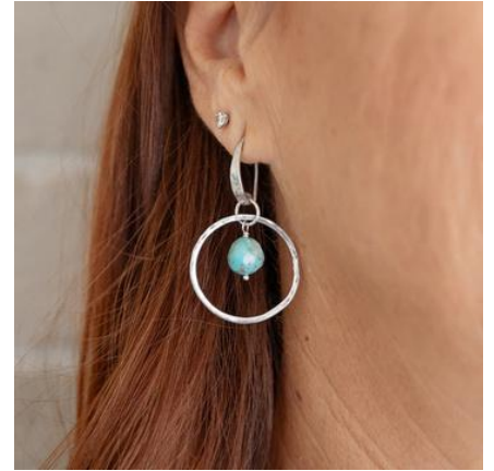
Turquoise Nugget Earrings