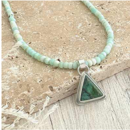
Peru Opal Necklace

Ocean green pendant with sky- blue beads