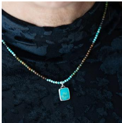
Turquoise Bead Necklace