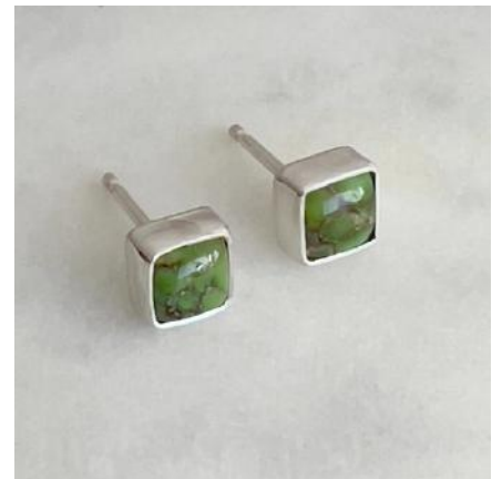
Sonoran Turquoise Studs