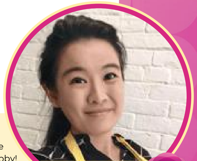
Ploy Khunisorn Online cooking classes

Email communityeducationae@district279.org .