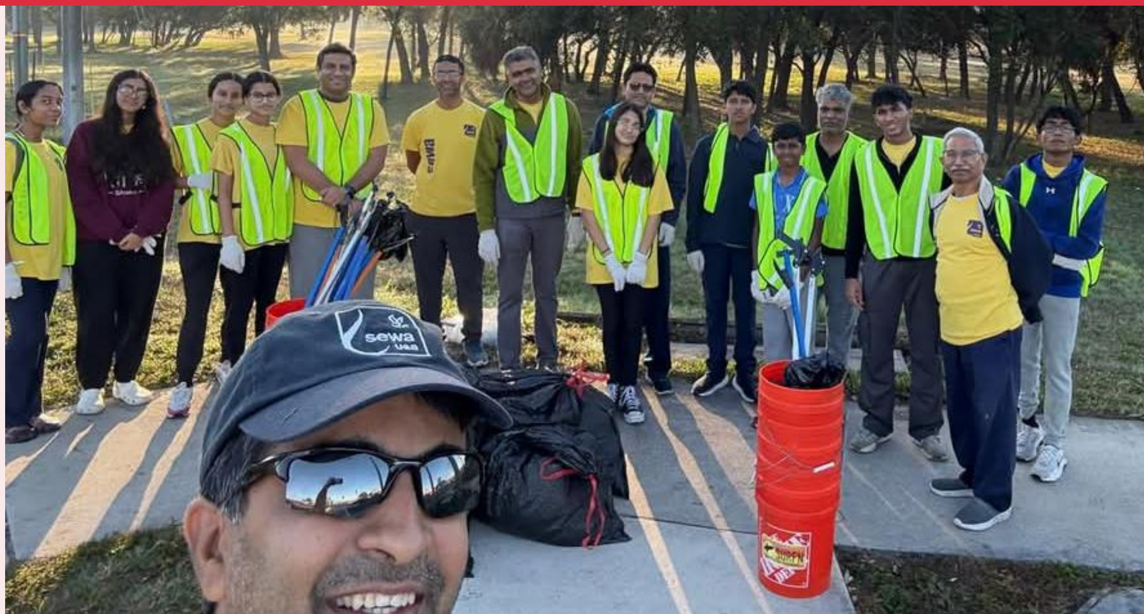
The Sewa Tampa volunteers participated in "Adopt-A-Road Cleanup Event" in Tampa Bay, FL

The Sewa Tampa Chapter and "Keep Tampa Bay Beautiful" organized an Adopt-A-Road Cleanup Event on February 10. Over twenty volunteers participated.