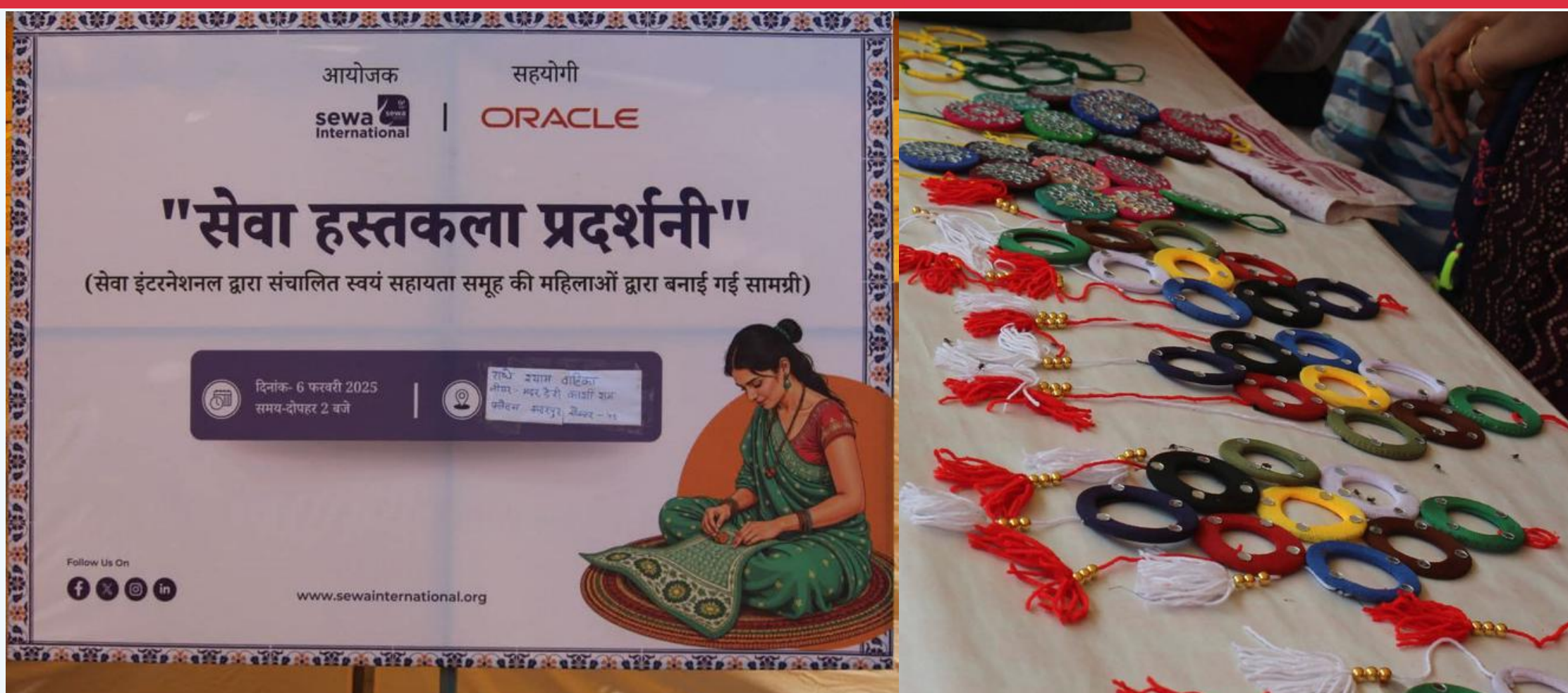
Sewa Hastkala Pradarshani in Noida, Uttar Pradesh, empowered skilled women artisans to achieve financial independence and self-reliance

In Uttar Pradesh, India, Sewa International organized an exposure visit for over 40 women from the Sewa Mahila Jyoti Kendra to the Sewa Hastkala Pradarshani, supported by Oracle, on February 6. The event provided a platform for local artisans and skilled women from stitching centers to showcase their handcrafted products while equipping them with essential marketing, sales, and business skills to enhance their earnings and long-term success.