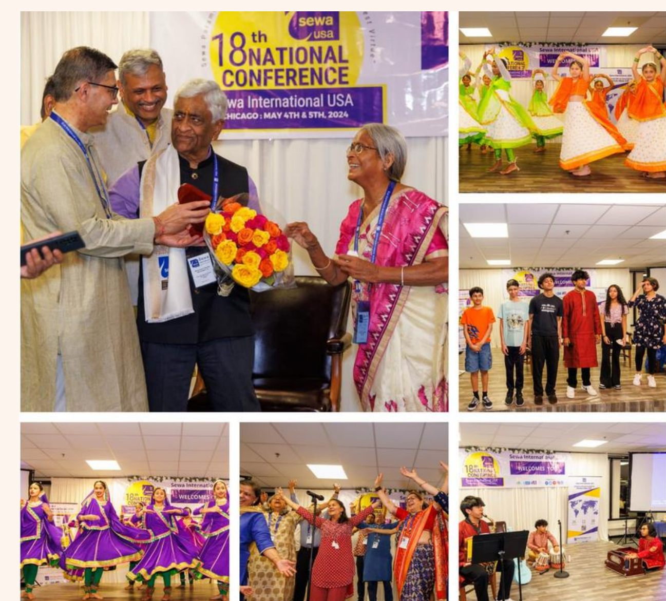
Action-packed moments from Sewa International's 18th National Conference held in Schaumburg, IL, in 2024