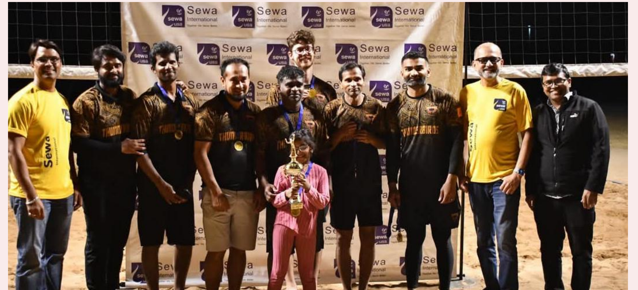
Exciting moments from Sewa's 3rd annual Volleyball Tournament in Chandler, Arizona