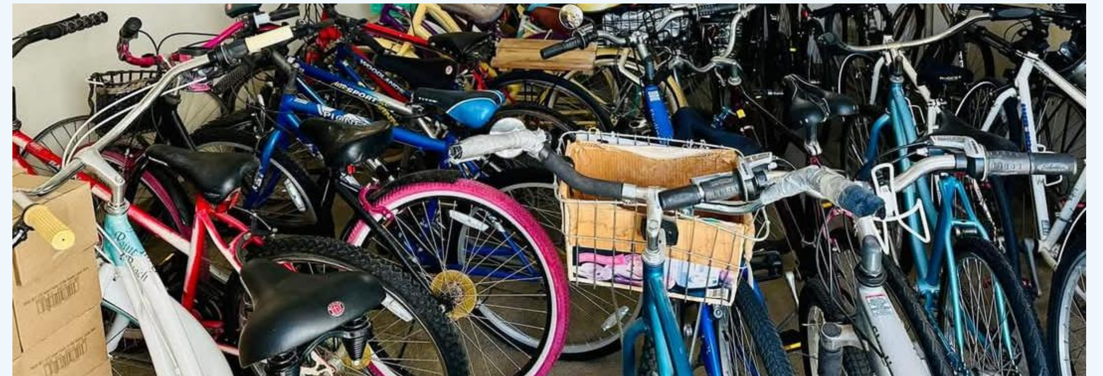
The charity's collection of bikes, with help from the community and city support in Arizona

Link: https://www.facebook.com/share/p/1BcW5hkuUr/