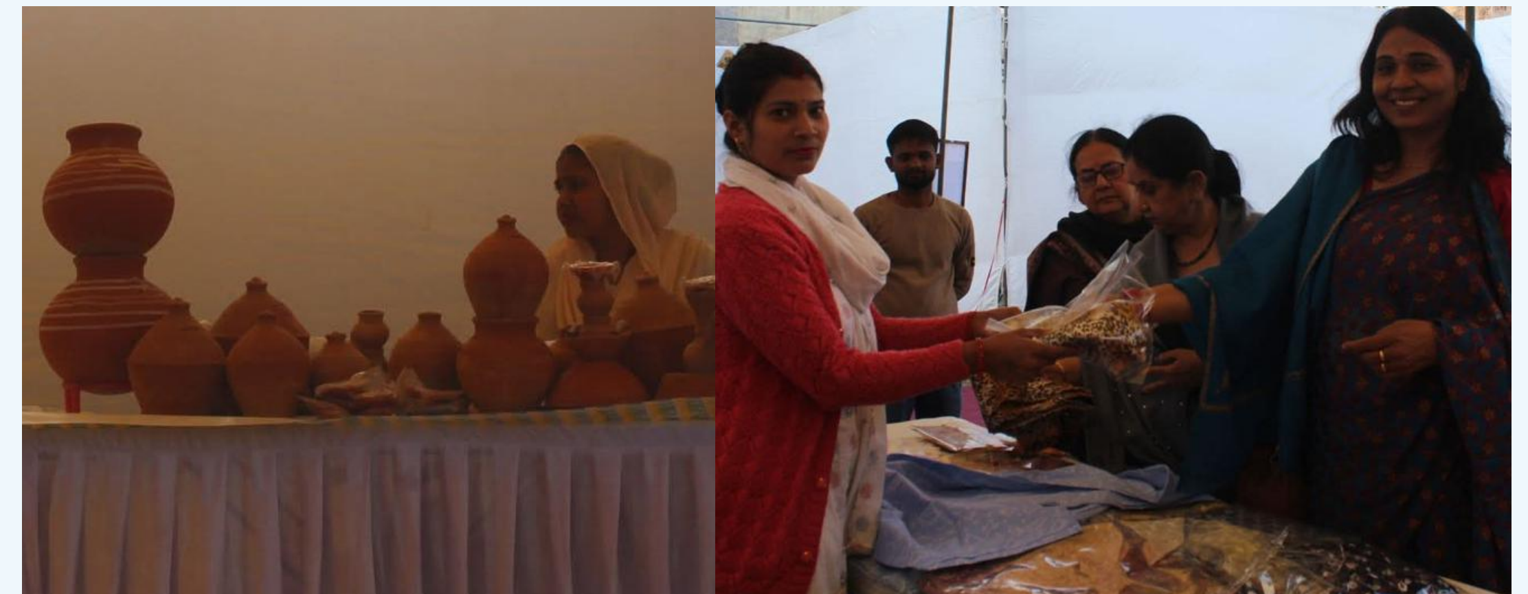
Skilled women artisans and local craftsmen showcase their handcrafted treasures at Sewa Hastkala Pradarshani in Noida, Uttar Pradesh, India

Held at the Sai Kripa Vocational Center, the visit introduced participants to stitching-related skills and facilitated interactions with entrepreneurial women. For many artisans, it was their first visit to a city and maiden experience selling their crafts. This initiative fostered the participants' confidence, financial independence, and community growth. Each handcrafted item on display carried a story, a dream, and a step toward self-reliance.