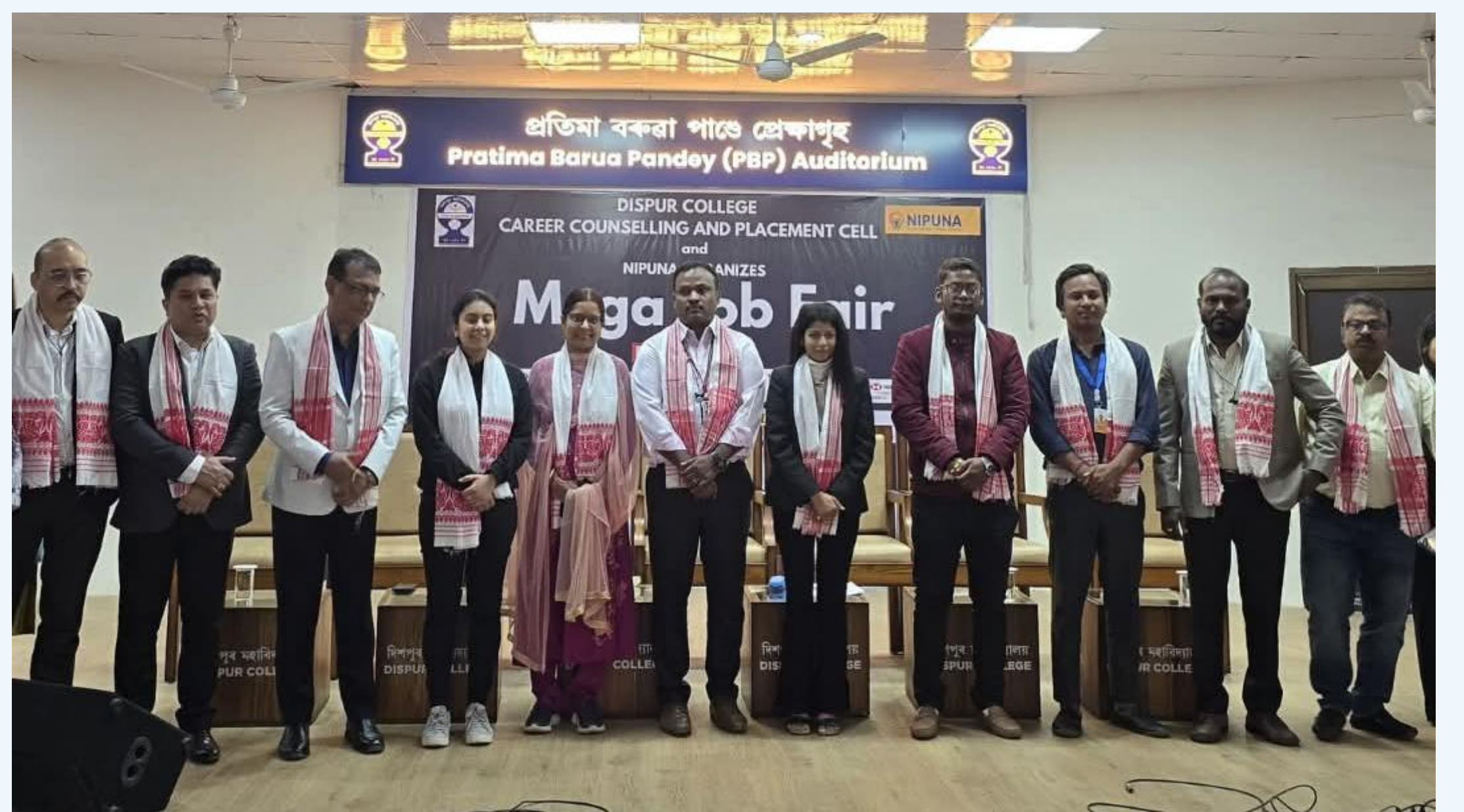
The college staff gathered for a group photo during the mega job mela in Dispur, Guwahati, Assam