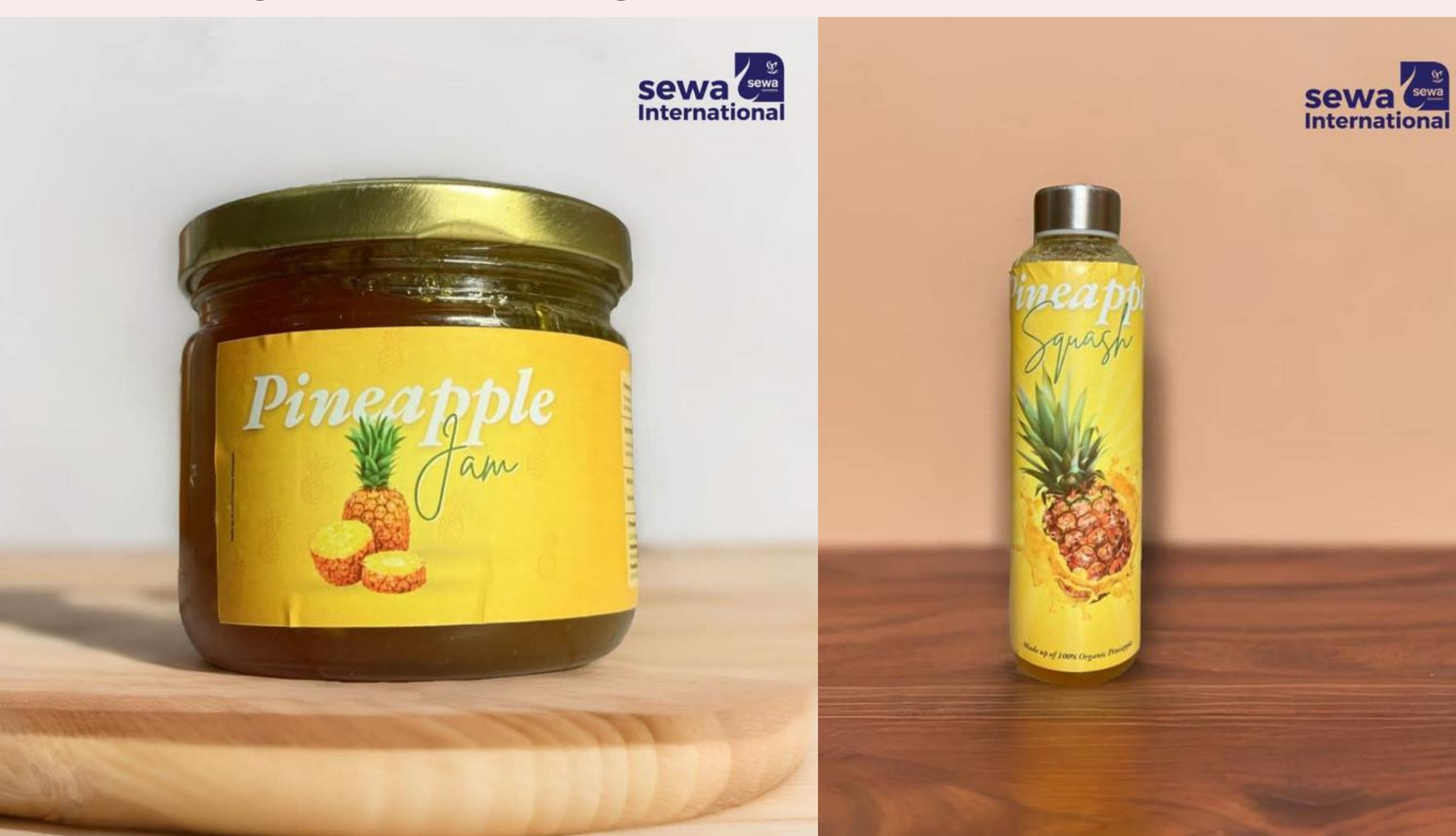
Pineapple jam and squash produced at a Sewa-established unit in Agartala, Tripura

In a significant initiative to promote sustainable livelihoods, Sewa International distributed 230,000 pineapple saplings to local farmers in Agartala, Tripura, on February 3. This effort, supported by LICHFL (Life Insurance Corporation of India Housing Finance Limited) as part of their CSR (Corporate Social Responsibility) initiative, aims to empower farmers and foster economic growth in the region.