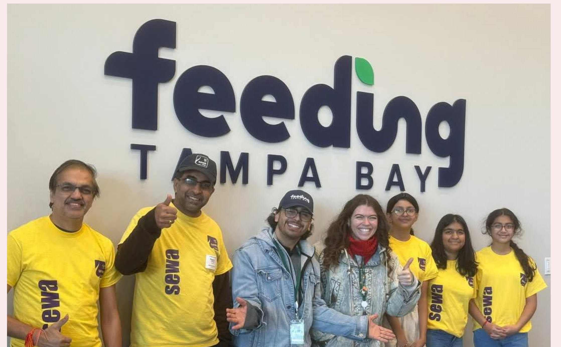
Volunteers sorted donations at the Feeding Tampa Bay warehouse in Tampa Bay, FL

In another event, over 20 volunteers recently gathered at the "Feeding Tampa Bay warehouse" to sort through donated items. The effort resulted in 8,699 pounds of items being sorted, which will help provide 7,250 meals.