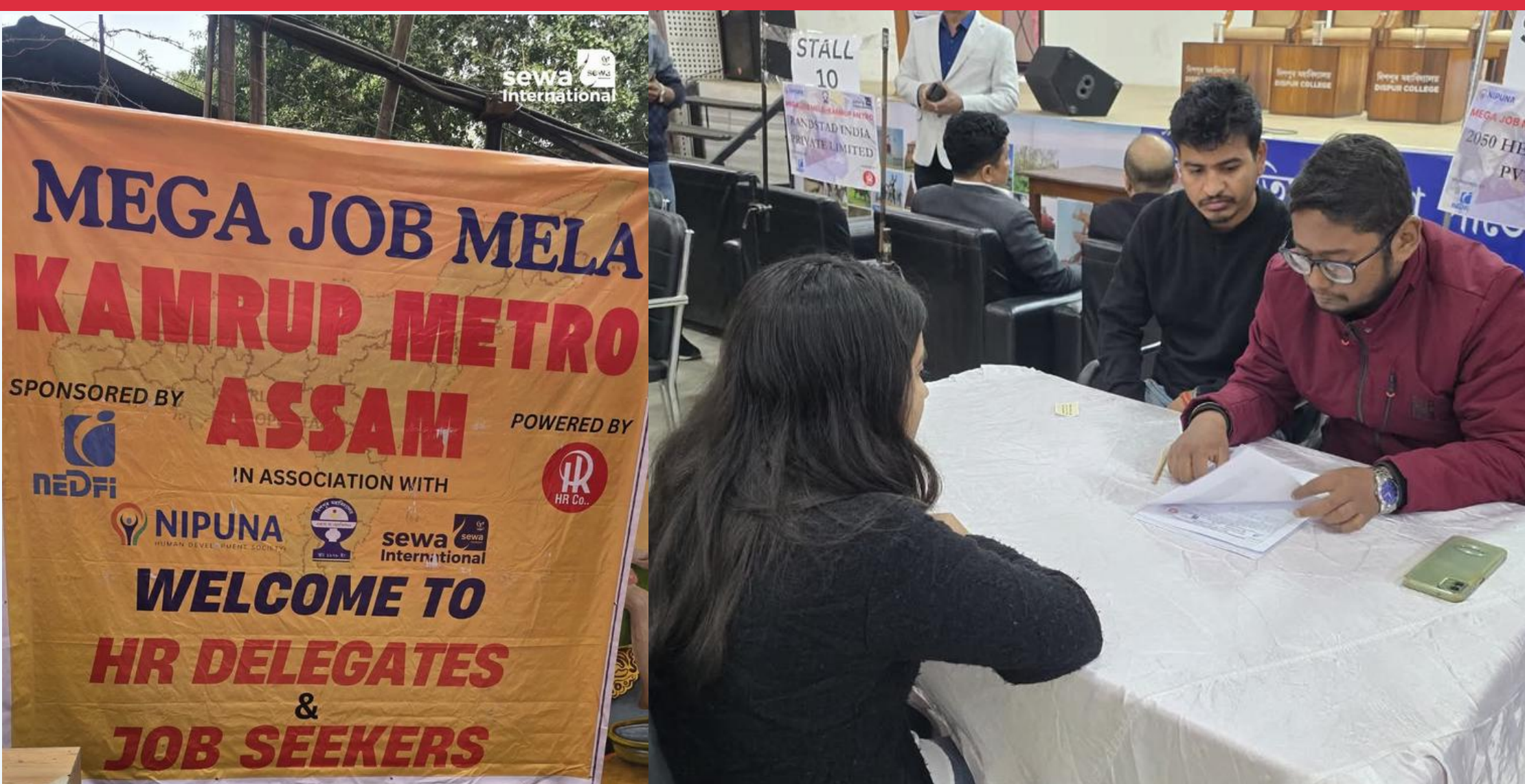
Students participated in the Job Fair organized by Sewa International at Dispur College, Guwahati, Assam

Sewa International, in collaboration with NEDFI (North Eastern Development Finance Corporation Ltd.) and by HR Co., organized a job fair at Dispur College, Guwahati, Assam, on February 6. Over 470 students attended the job fair, with 104 receiving job offers on the spot. Additionally, 100 students were shortlisted for further rounds of interviews.