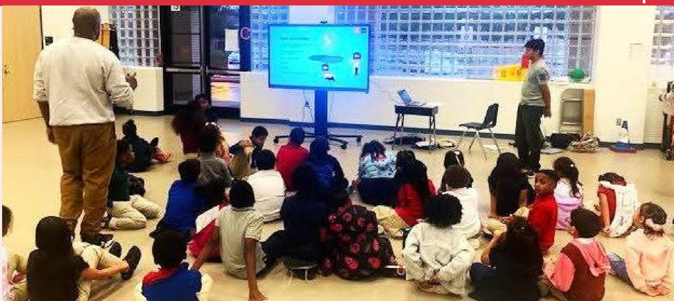
Children participated in a disaster preparedness workshop in Greater Houston, TX

Sewa Houston's AmeriCorps program has helped over 500 people in the greater Houston area, through disaster preparedness workshops.