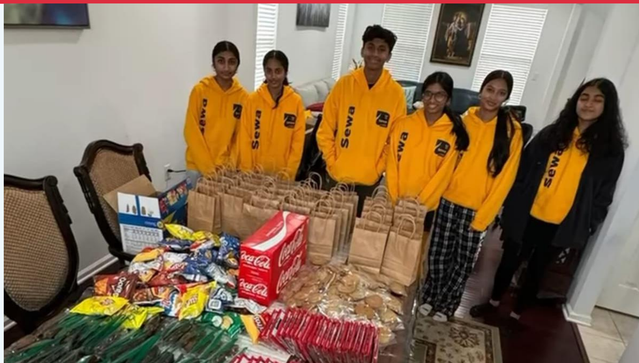
Sewa LEAD youth volunteers showcased their baked goods and handmade crafts during the fundraiser for the SHE Project

A group of Sewa LEAD (Leadership, Education, and Development) youth volunteers organized a fundraiser in Central Jersey on February 13, to support the Sewa SHE (Sanitation, Hygiene, and Empowerment) Project, which empowers the girl child.