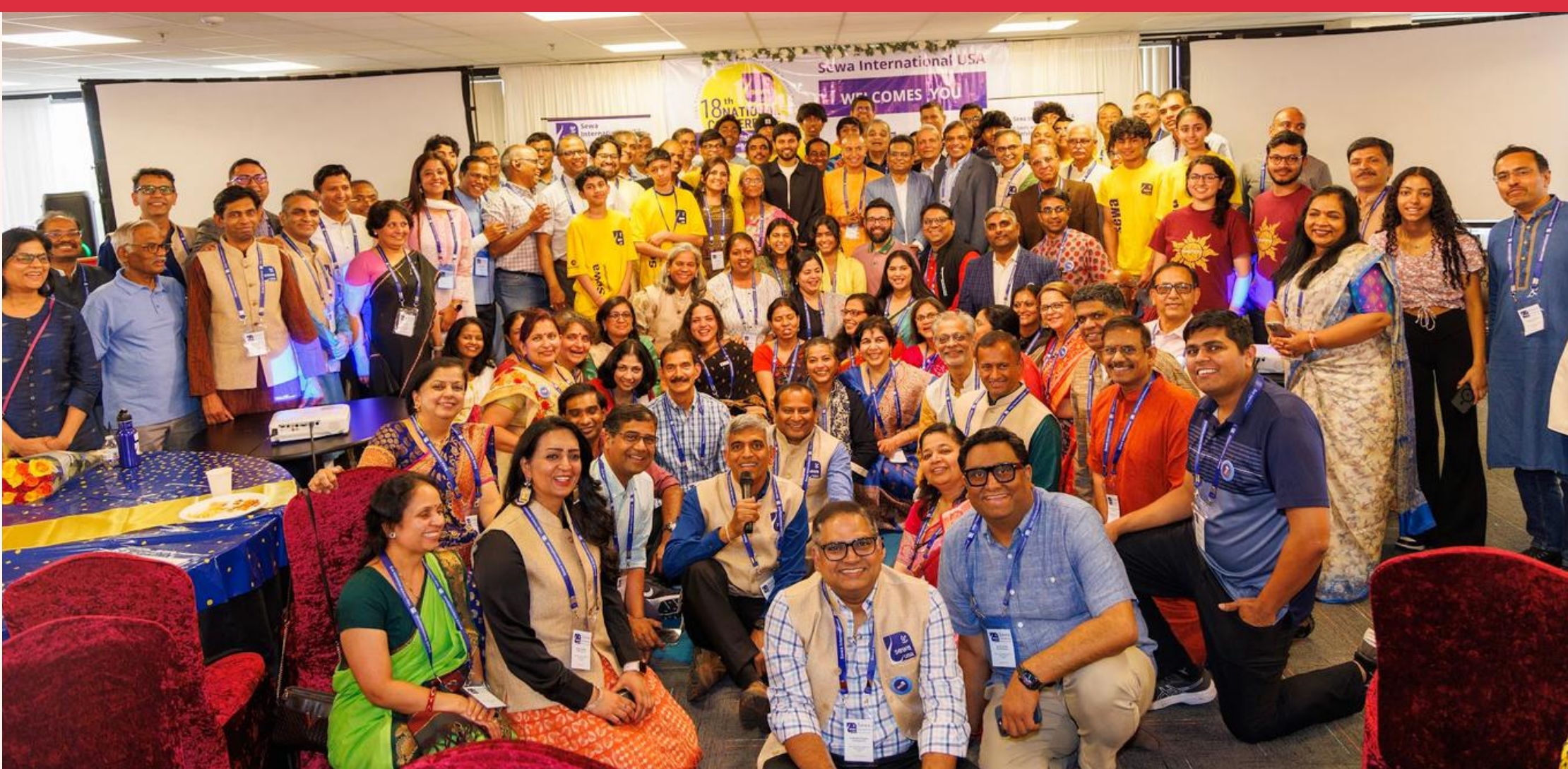
Volunteers posed for a group photo at Sewa International's 18th National Conference in Schaumburg, IL, in 2024

Sewa's San Francisco Bay Area Chapter will host the 19th National Conference on May 3 and 4, 2025. The National Board of Directors, members of the National Advisory Board, and the National Executive Team will attend the conference.