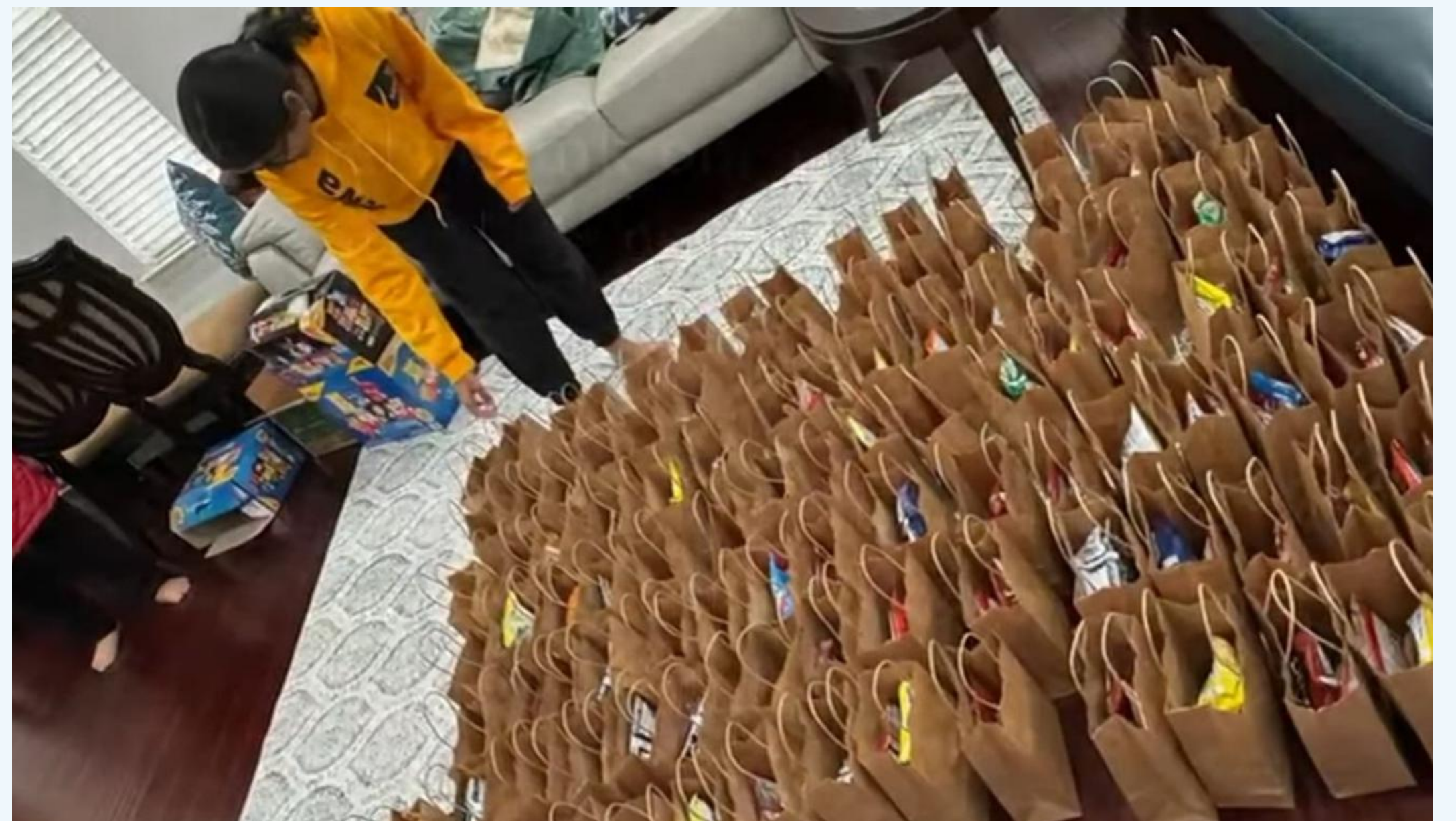
A LEAD volunteer arranging the goodie bags for display at a fundraiser in Central Jersey

The volunteers showcased their creativity and entrepreneurial spirit by baking cookies and brownies, packing goodie bags, and gathering donations. They raised a significant amount for the project. The Sewa SHE Project focuses on building toilets in government schools across India and educates girl children about health and hygiene.