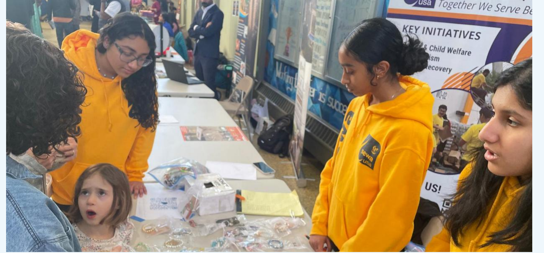
Sewa volunteers showcased handcrafted bracelets and introduced attendees to Sewa's programs at the Tamil Sangham event