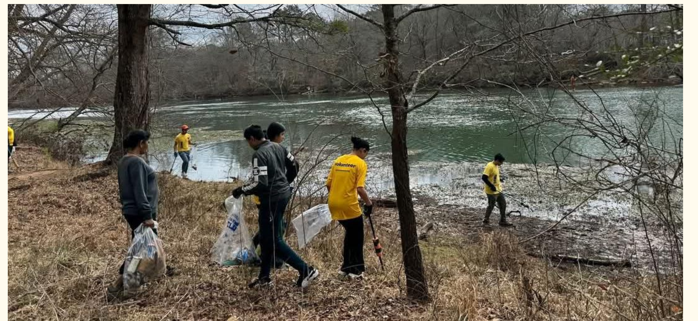
Sewa Green Team and park rangers work together to remove 300 pounds of trash for a cleaner environment

Over twenty volunteers from the Sewa Green Team joined forces with National Park Service rangers to clean up the Chattahoochee River's Jones Bridge Corridor in Atlanta, GA, on February 9. Their collective efforts resulted in the removal of over 300 pounds of trash from the riverbanks.