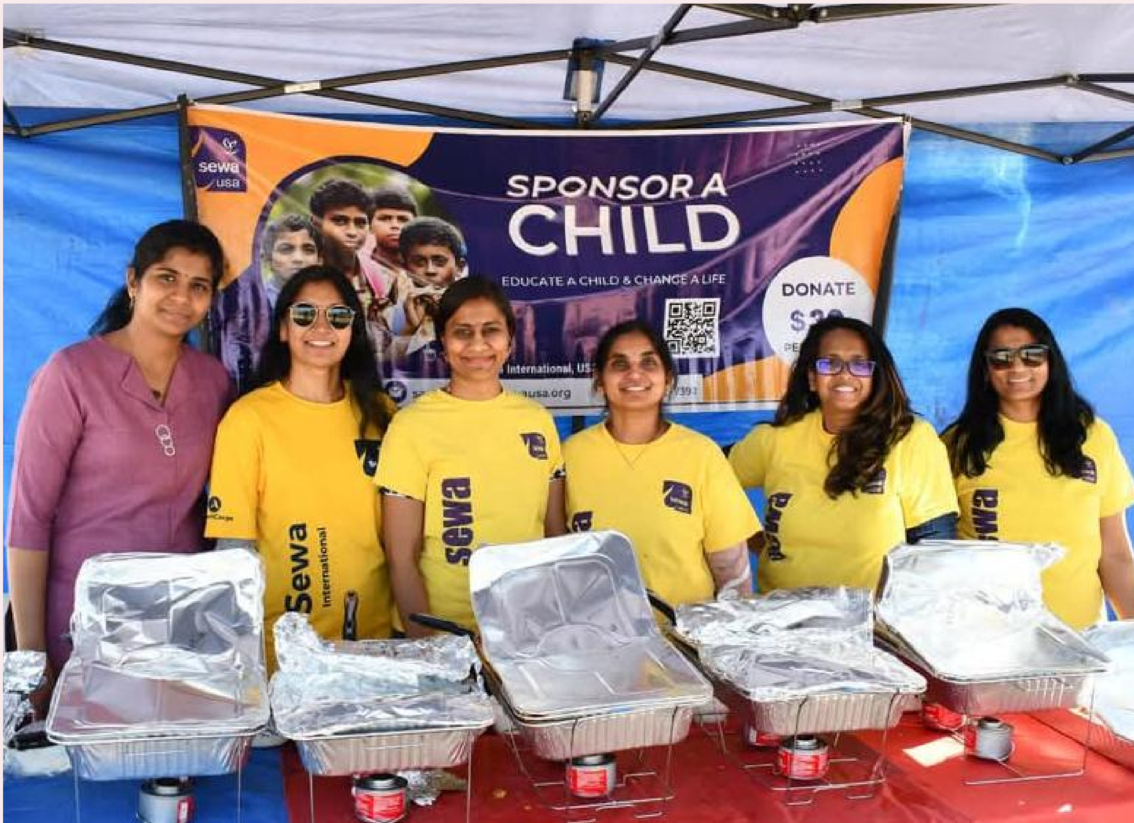
Volunteers served food at stalls in Sewa's 3rd annual Volleyball Tournament in Chandler, Arizona

Sewa International's Third Annual Volleyball Tournament, held on February 2 at Chuparosa Park in Chandler, Arizona, raised $8,000 to support the 'Sponsor a Child' and 'California Wildfire Relief' projects. The two-day event drew 23 teams—18 men's and 5 women's.