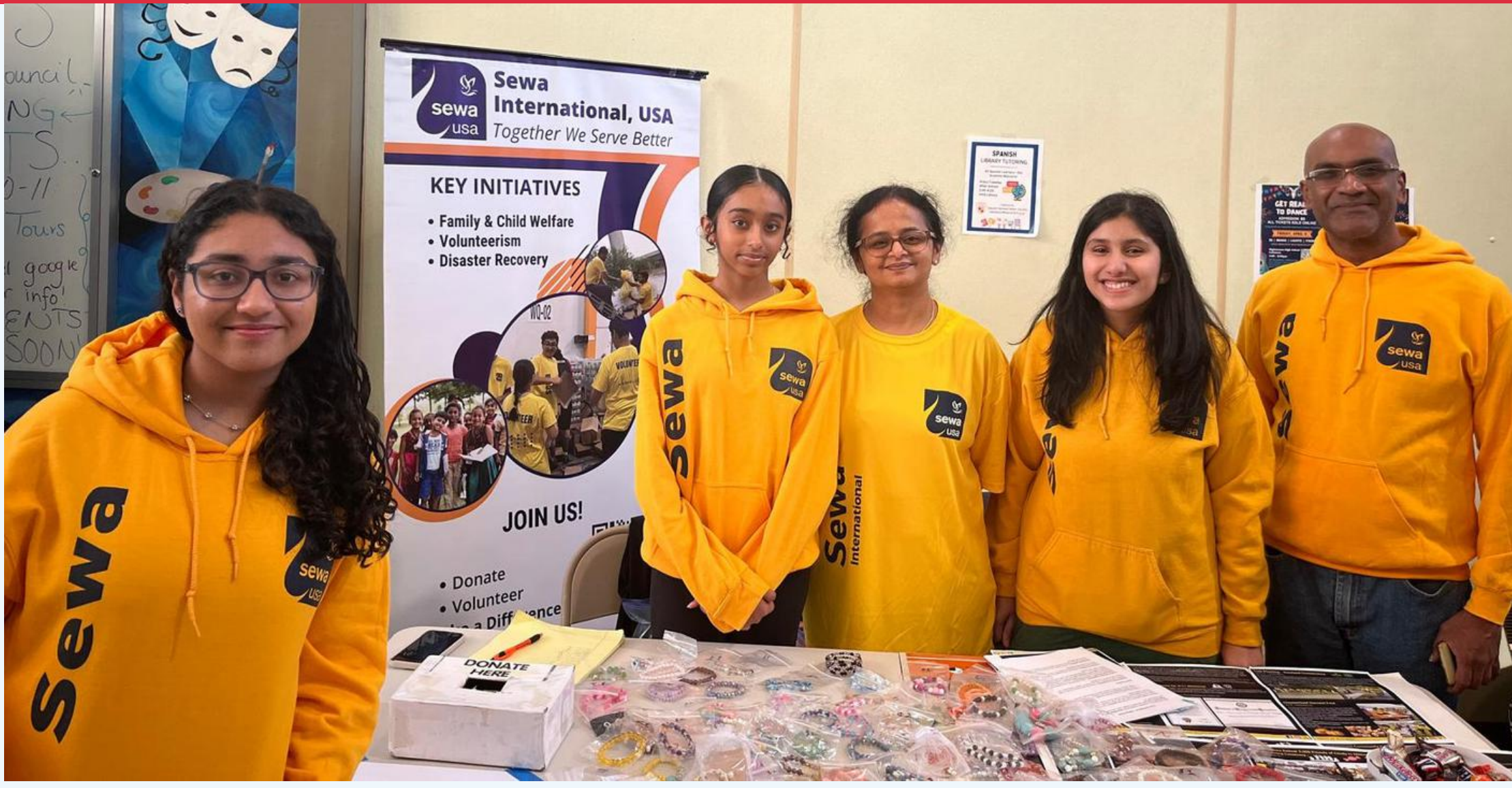
Volunteers receiving attendees at the Tamil Sangam event in Hightstown, NJ

Sewa's South Jersey chapter began the year with a fundraiser at the Tamil Sangam event held at Hightstown High School in Mercer County, NJ, on February 1, raising over $1,172. The amount included $172 raised by selling handcrafted bracelets made by Sewa LEADs, and a donation of $1,000 from Tamil Sangam to support Sewa's relief work.