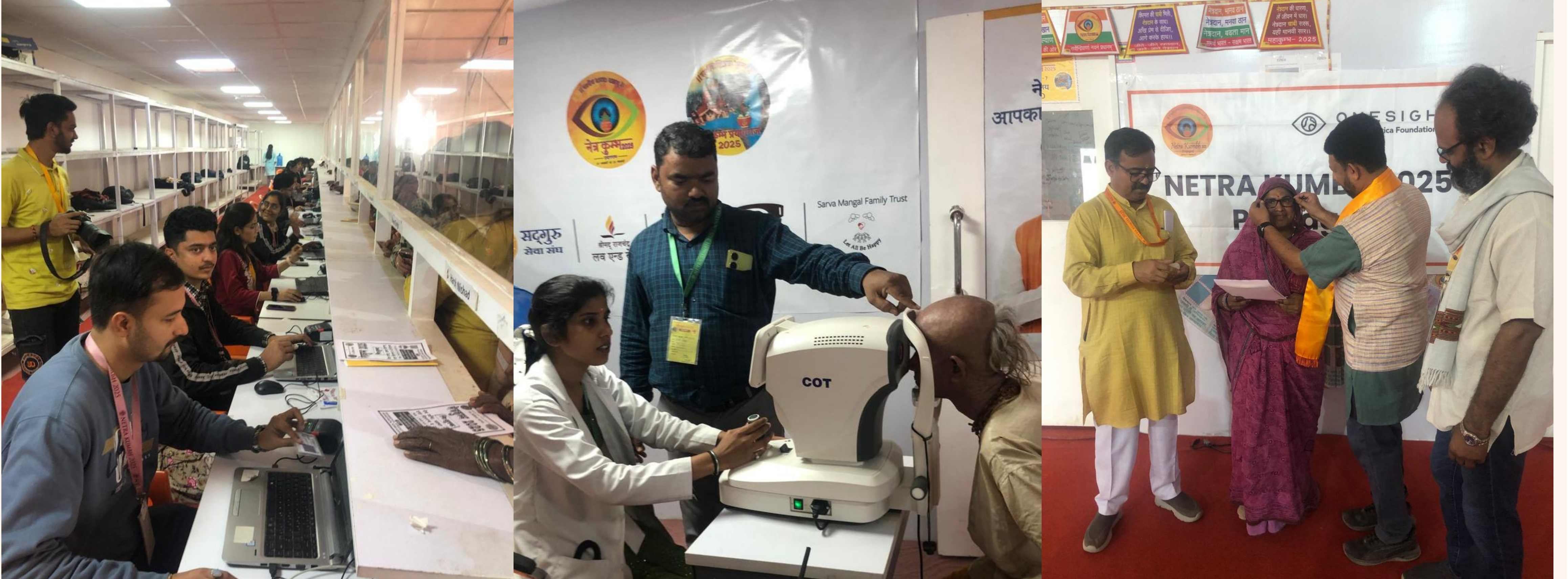
Netrakumbh 2025, an eye-care initiative, provided free eye screenings and spectacles at the Maha-Kumbha, in Prayagraj, Uttar Pradesh, India

Netrakumbh 2025, one of the largest eye-care initiatives at Mahakumbh in Prayagraj, India, provided free check-ups, medicines, and cataract surgeries to 237,964 people. Led by Saksham and supported by 52 organizations, the initiative also promoted eye donation awareness and introduced smart technology for the visually impaired.