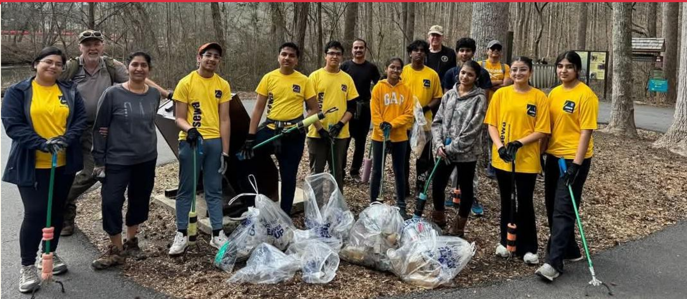
Sewa Green Team volunteers team up with National Park Service rangers to clean the Chattahoochee River

Over twenty volunteers from the Sewa Green Team joined forces with National Park Service rangers to clean up the Chattahoochee River's Jones Bridge Corridor in Atlanta, GA, on February 9. Their collective efforts resulted in the removal of over 300 pounds of trash from the riverbanks.