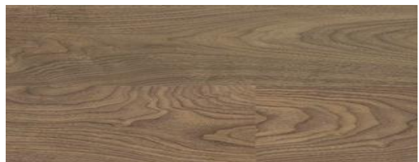
WALNUT PURE LINE