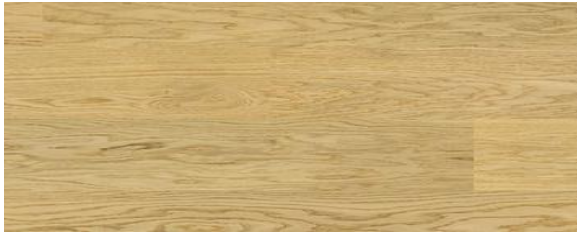
OAK PURE LINE