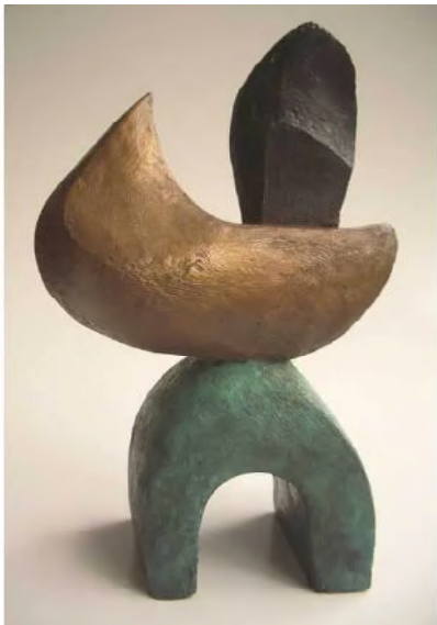
Journey of the Sage 2015 Bronze sculpture edition of 3 189 x 120 x 63 cm maquette created in 2000 edition of 3