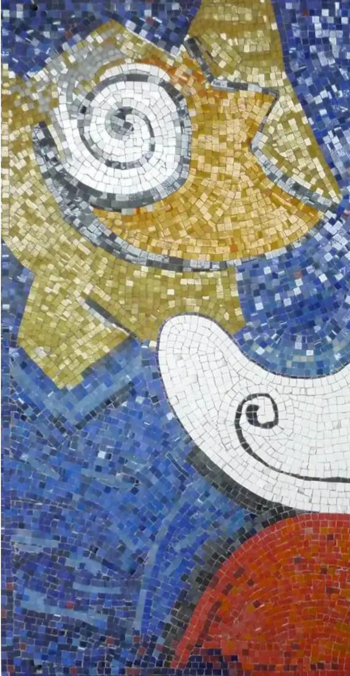
Lost in the Cosmos 2012

200 x 240 cm mosaic, glass tiles, (smalti) hand blown & cut created for the Yew Chung Foundation, Hong Kong