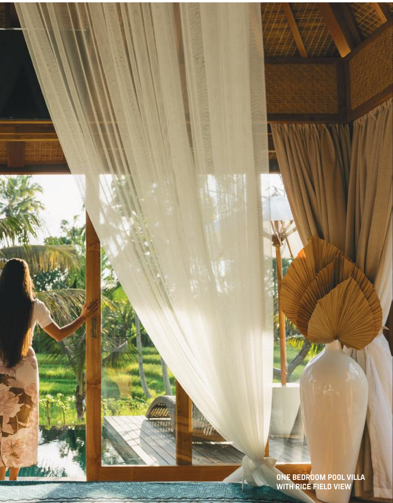
ONE BEDROOM POOL VILLA WITH RICE FIELD VIEW