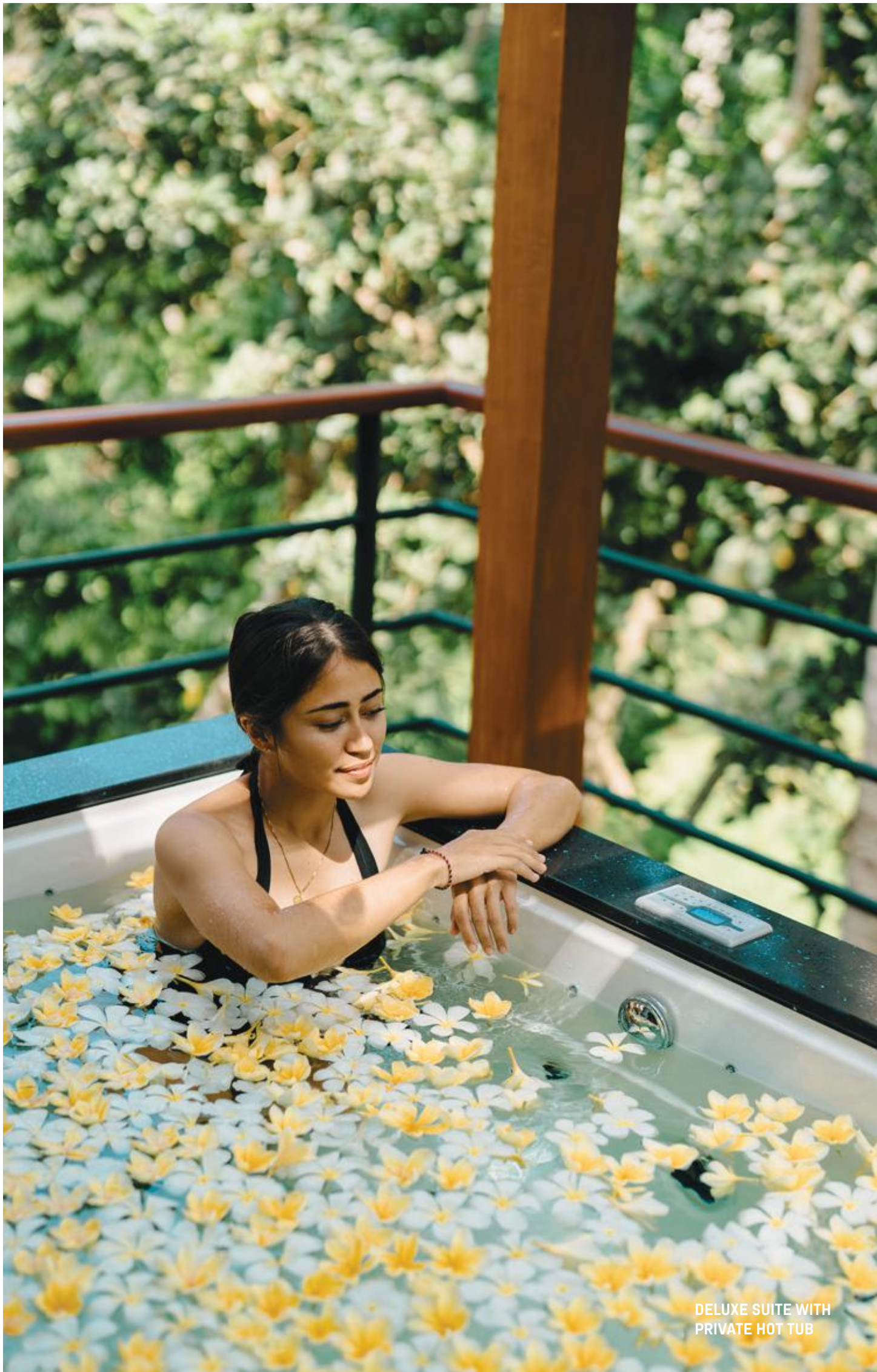
DELUXE SUITE WITH PRIVATE HOT TUB