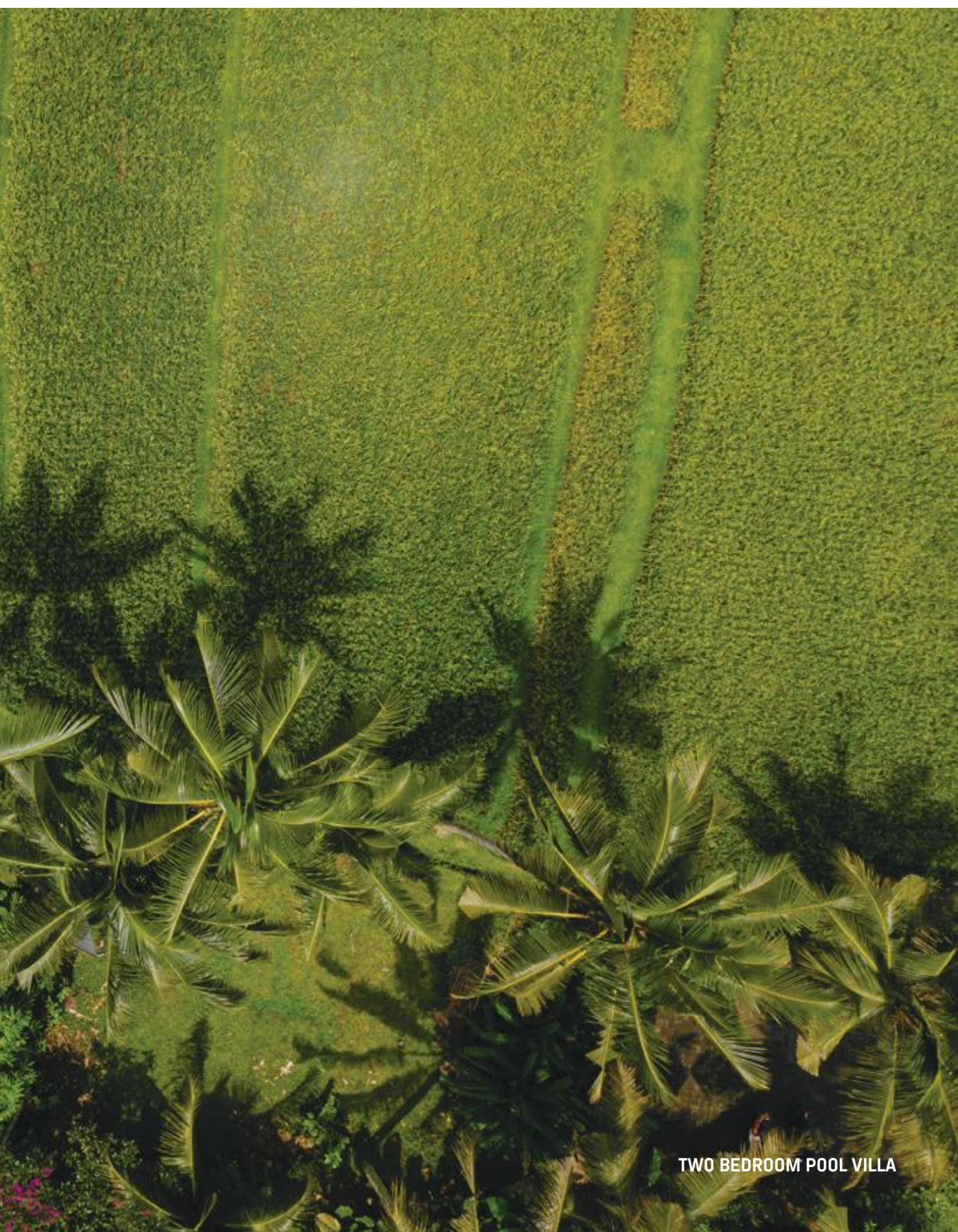
TWO BEDROOM POOL VILLA