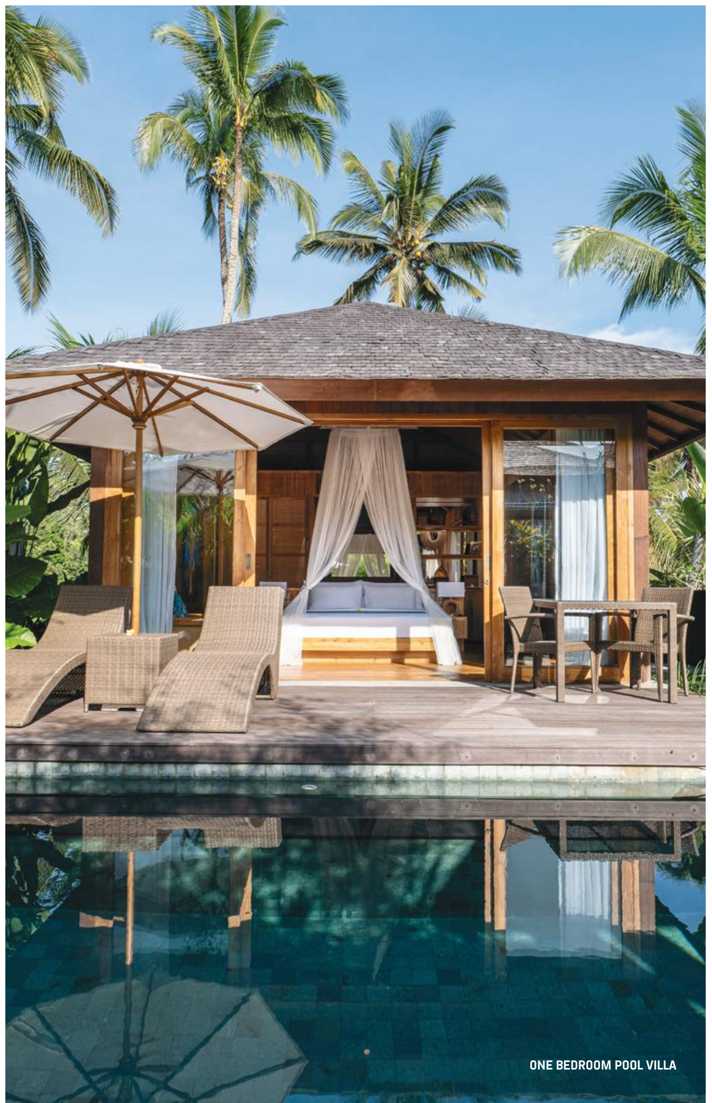
ONE BEDROOM POOL VILLA