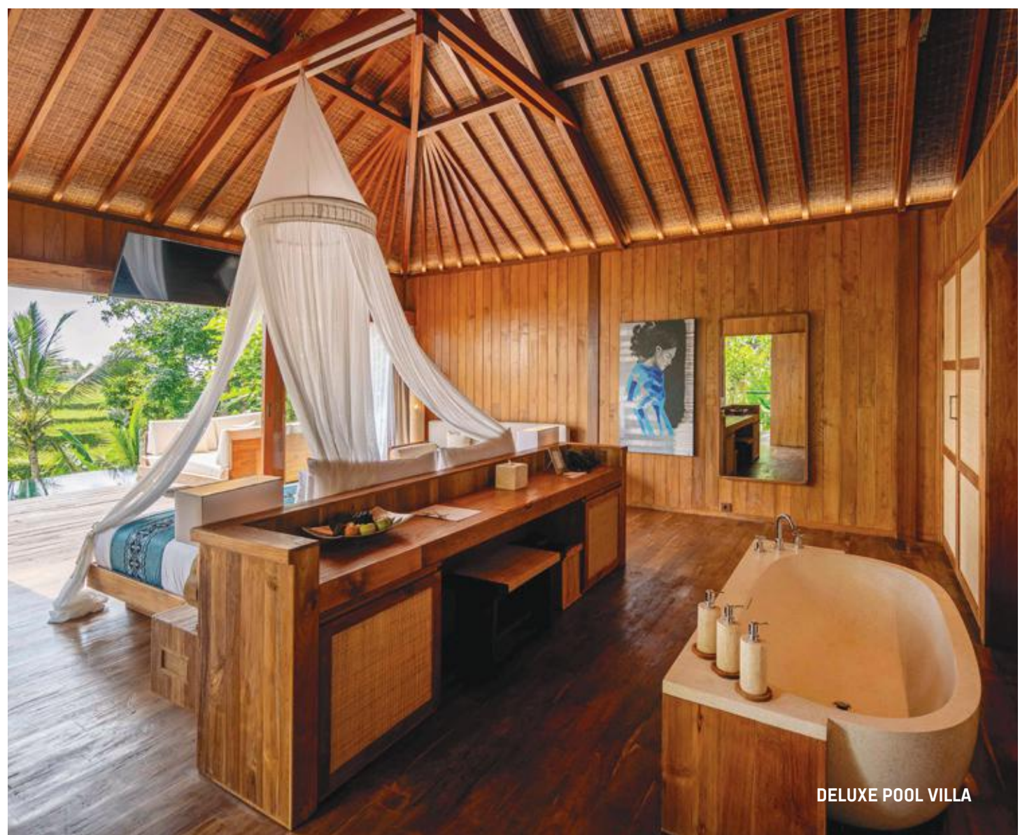
DELUXE POOL VILLA