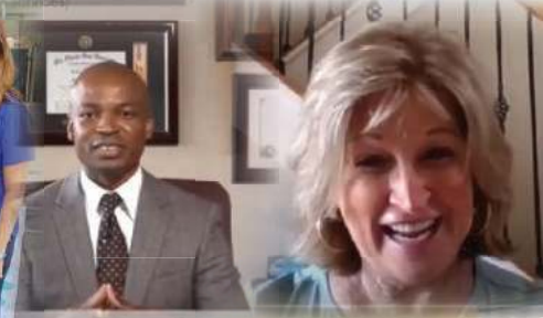
Mack Bernard Commissioner