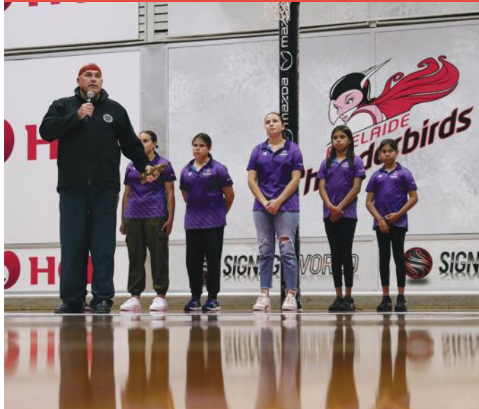
OAKDEN NETBALL CLUB