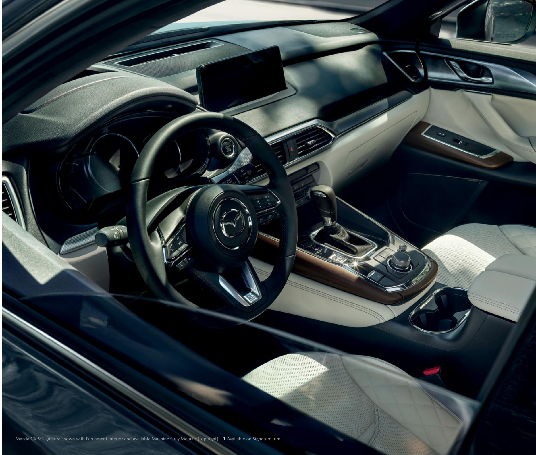
Mazda CX-9 Signature shown with Parchment Interior and available Machine Gray Metallic (top right) | 1 Available on Signature trim