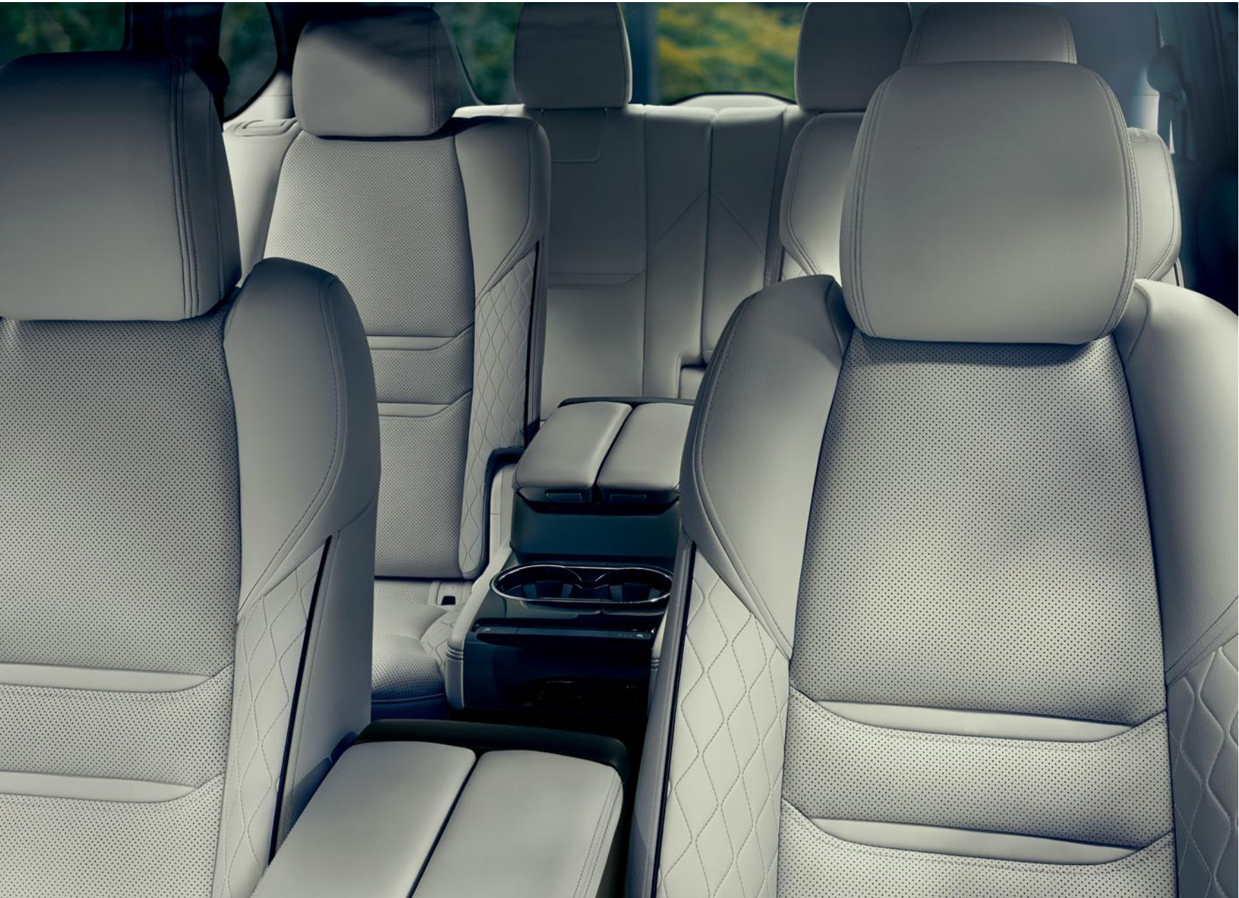
1 Captain's chairs with center walk-through available with select CX-9 Touring, Grand Touring and Carbon Edition trims; captain's chairs with center console standard on CX-9 Signature. 2 Second- and third-row USB charging ports are available features.