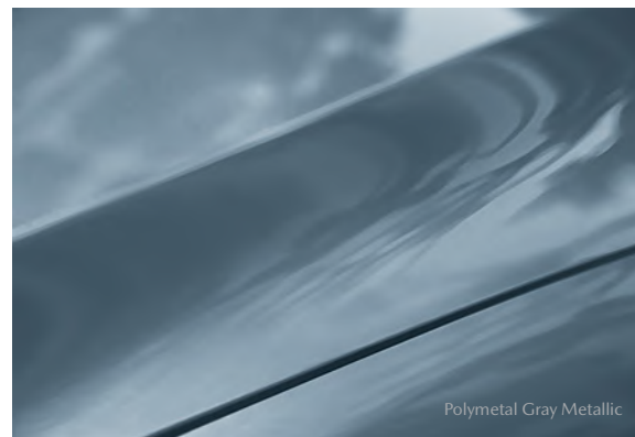
Polymetal Gray Metallic

Our daring array of lustrous finishes—including the new Polymetal Gray Metallic offered on Carbon Edition models—may be the final touch on the CX-9, but it is the first thing that will catch your eye. And it will continue to draw your gaze, time and time again.