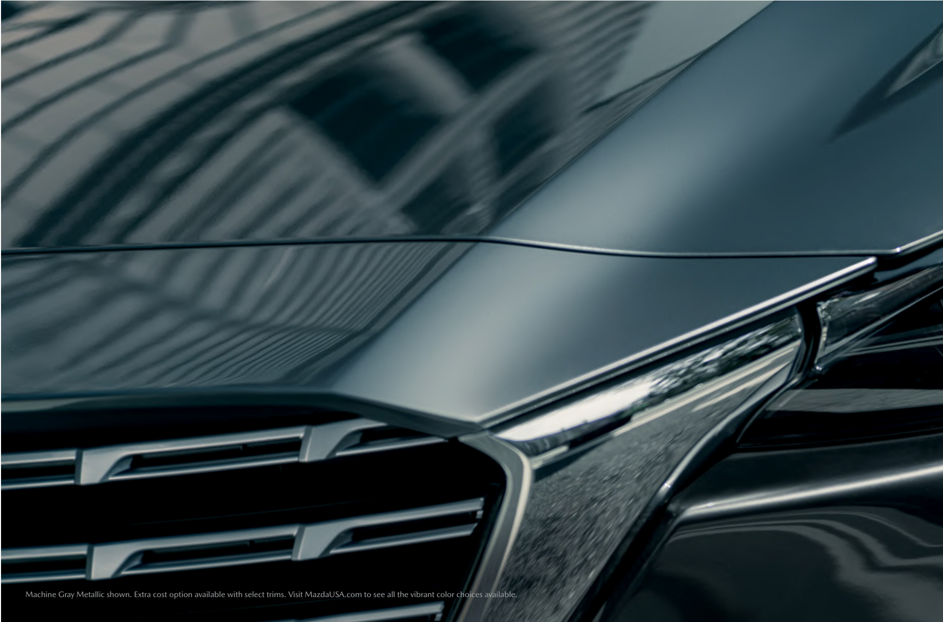
Machine Gray Metallic shown. Extra cost option available with select trims. Visit MazdaUSA.com to see all the vibrant color choices available.