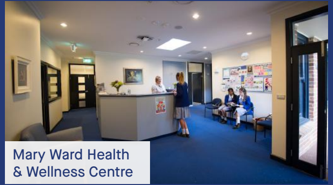
Mary Ward Health & Wellness Centre