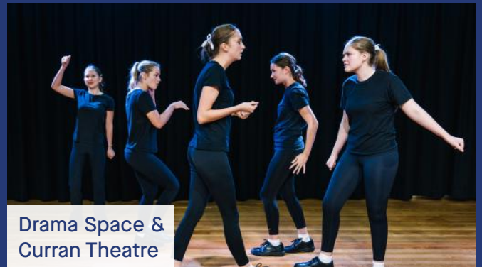
Drama Space & Curran Theatre