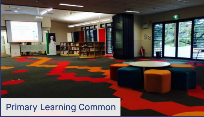
Primary Learning Common