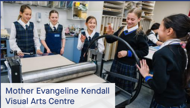
Mother Evangeline Kendall Visual Arts Centre