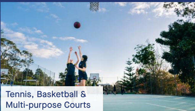
Tennis, Basketball & Multi-purpose Courts