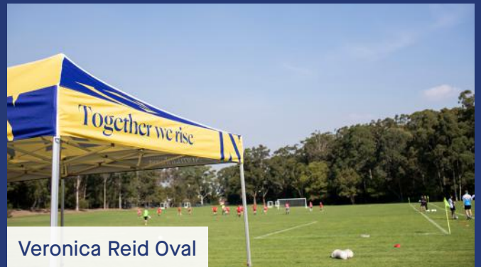
Veronica Reid Oval