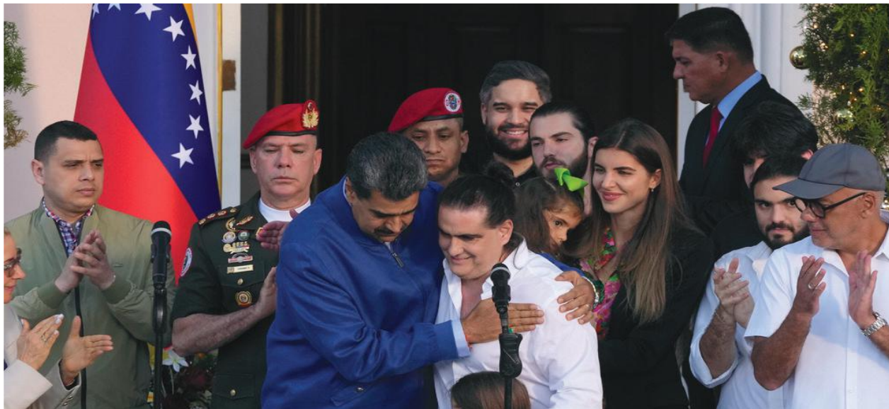
Venezuelan President Maduro, right, receives Alex Saab at Miraflores presidential palace in Caracas, Venezuela, Wednesday, December 20, 2023. The United States freed Saab, who was arrested on a US warrant for money laundering in 2020, in exchange for the release of 10 Americans imprisoned in Venezuela, US officials said Wednesday.

The United States freed a close ally of Venezuelan President Nicolás Maduro in exchange for the release of 10 Americans imprisoned in the South American country and the return of a fugitive defence contractor known as “Fat Leonard” who is at the centre of a massive Pentagon bribery scandal, the Biden administration announced Wednesday.