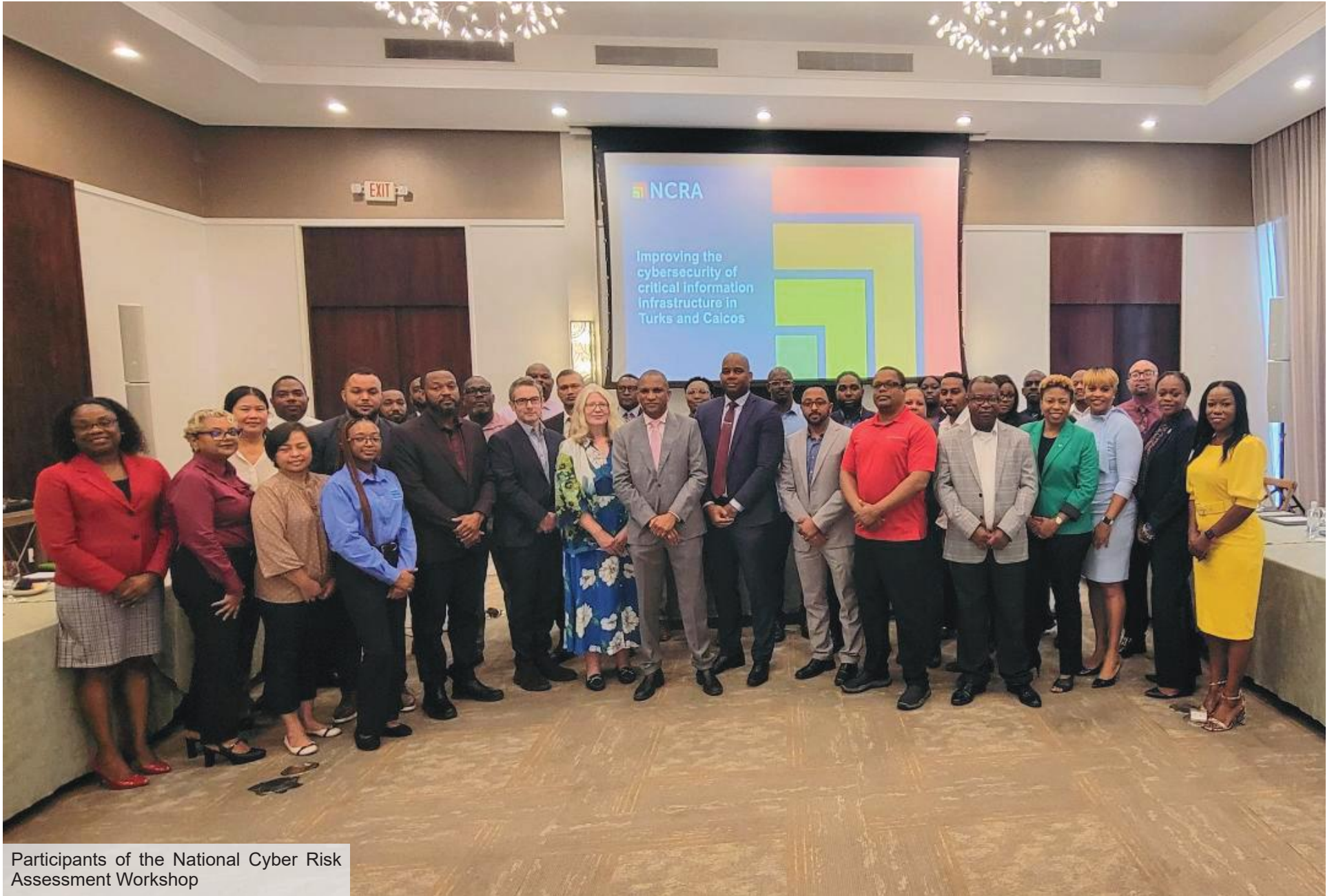
Participants of the National Cyber Risk Assessment Workshop