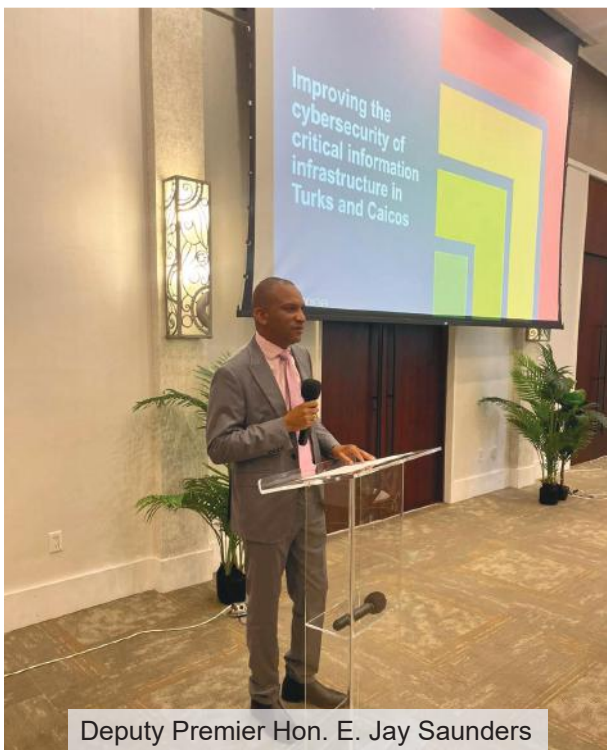
Deputy Premier Hon. E. Jay Saunders

In a proactive approach to cyber security on a national level, the TCI Government, in collaboration with the UK Government, hosted a National Cyber Risk Assessment (NCRA) Workshop on Wednesday, 6th December 2023, at the Shore Club in Providenciales. Acknowledging the ever-changing nature of the global cyber threat landscape, TCIG recognises the imperative of sector awareness to ensure that TCI keeps pace with advancements, ensuring the compatibility and protection of vital systems. The objective of this workshop was to establish a foundation for understanding the current cyber risk environment in TCI and define the parameters for charting TCI's national cyber security repositioning in line with future national aspirations. The Honourable Deputy Premier and Minister of Finance, E.J Saunders, delivered the Keynote address, assuring that the TCIG