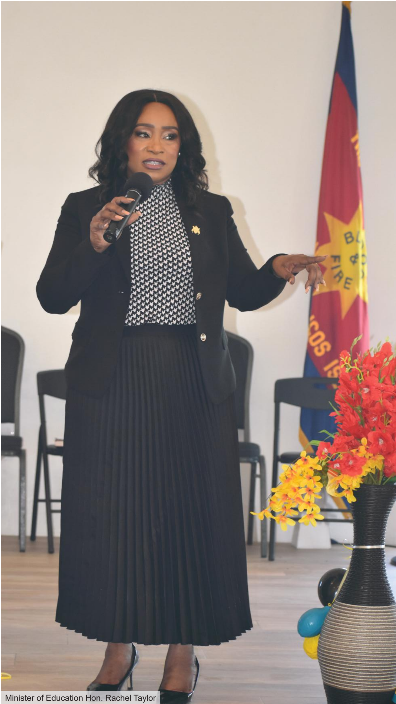
Minister of Education Hon. Rachel Taylor

The Turks and Caicos Islands Community College (TCICC) is reporting a significant and remarkable 29% increase in enrolments for the upcoming academic year 2023/2024.