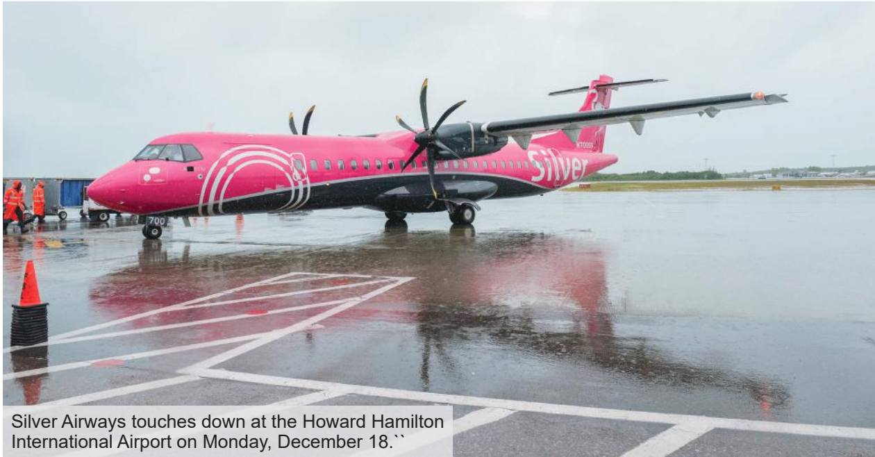
Silver Airways touches down at the Howard Hamilton International Airport on Monday, December 18.”