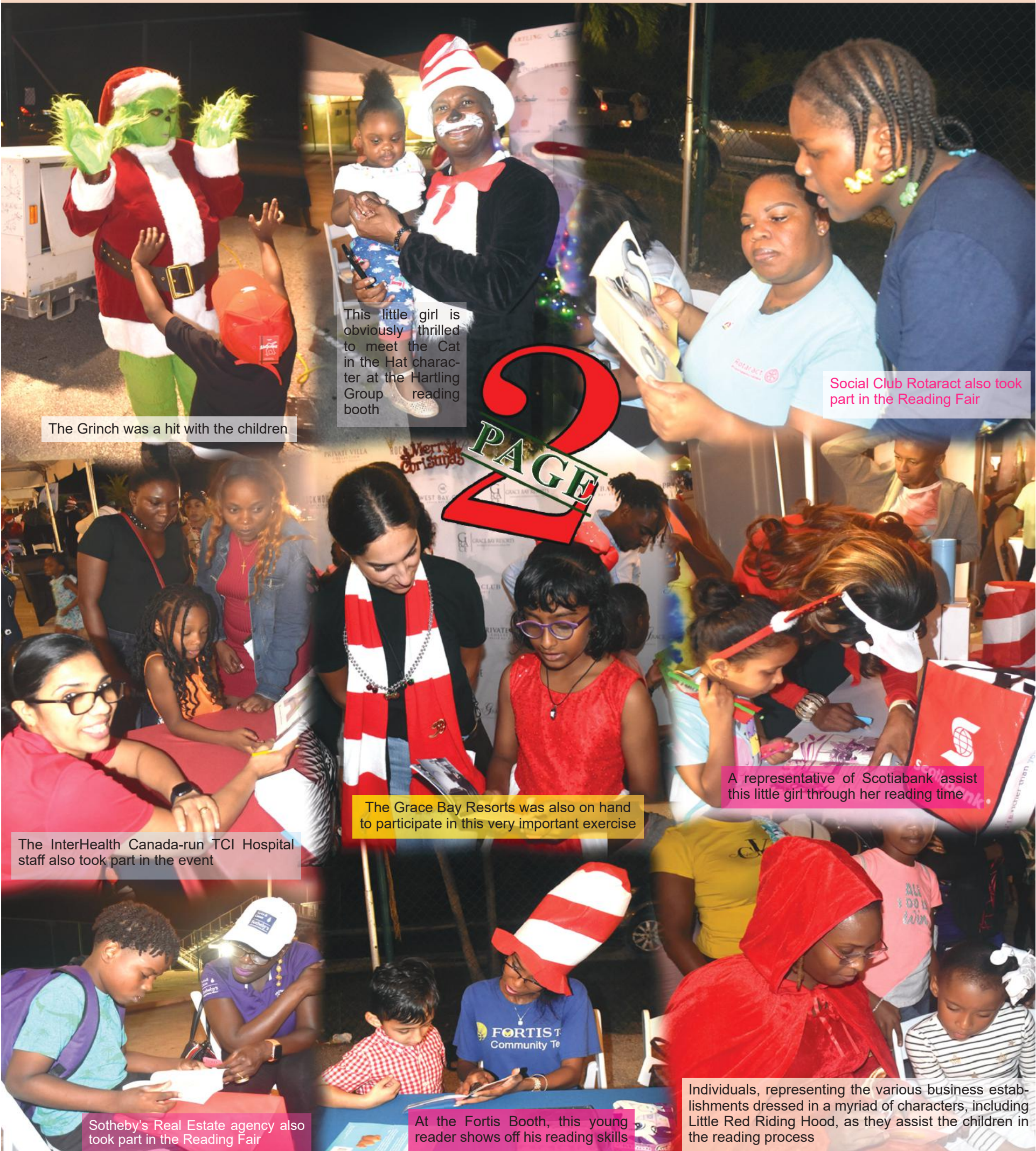
The Grinch was a hit with the children

United Way Turks and Caicos staged its Annual Reading Fair recently at the National Stadium, which saw more than 500 primary school children taking part. The Fair saw strong support from Corporate Turks and Caicos, whose representatives carried out the assessments of the young readers. NewslineTCI was at hand to cover this significant event.