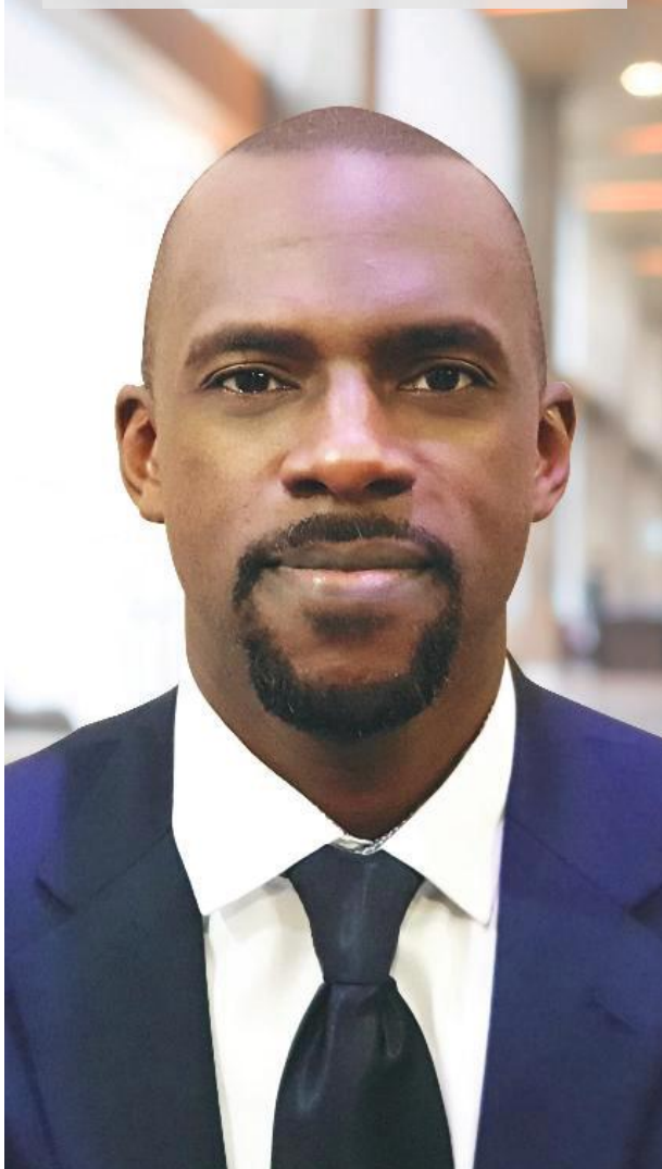
Delano Arthur, the new Energy and Utilities Commissioner

The Energy and Utilities Department (EUD) of the Turks and Caicos Islands, today reminds the public that the comprehensive Renewable Energy Legislation is currently before the House of Assembly and that the Legislation not only addresses the existing challenges posed by fuel price volatility but also lays the foundation for a sustainable and resilient energy future for the TCI.