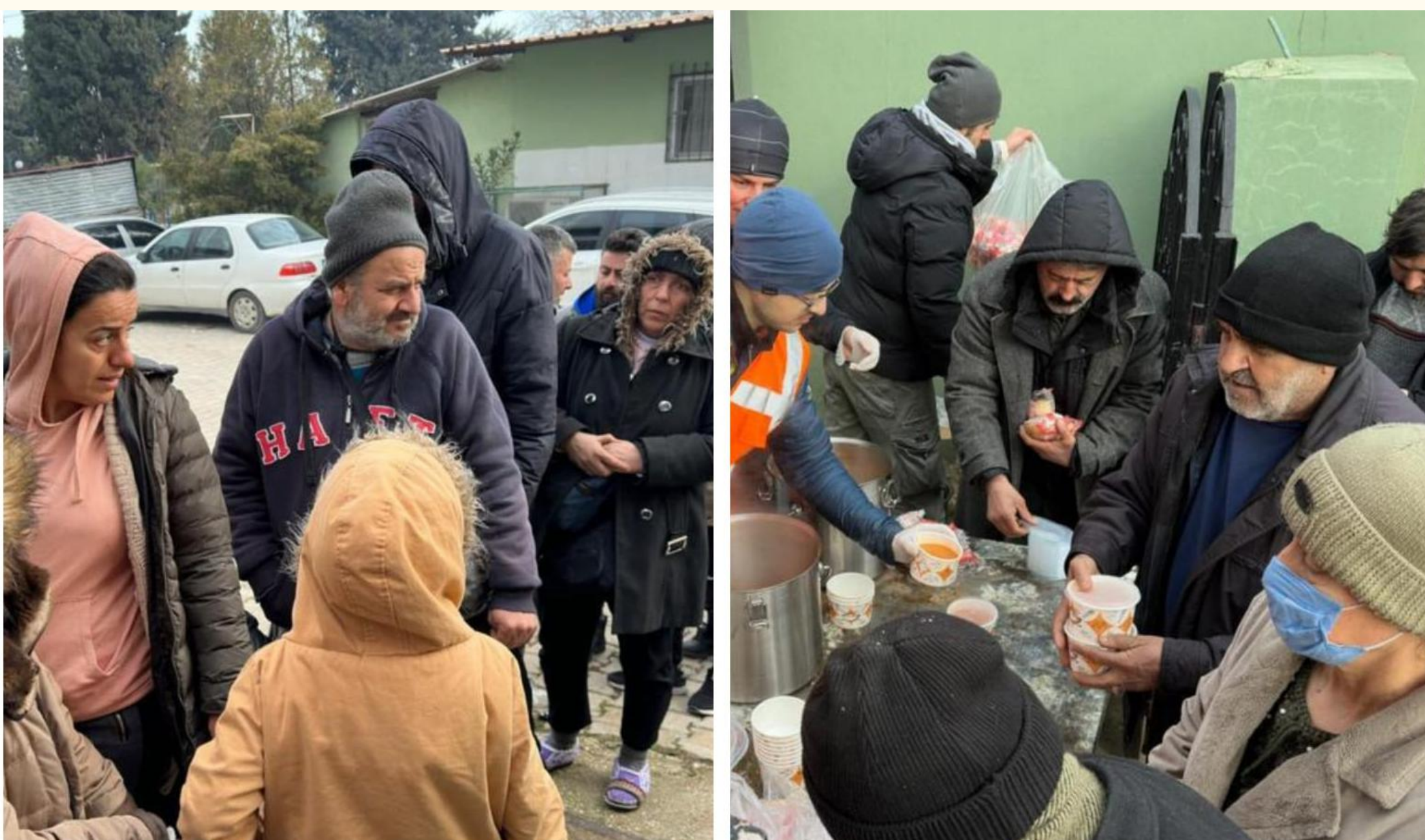
Sewa's partner organization ISKCON serving food daily in a village near Antakya

The Houston Sewa team collaborated with the National Association of Christian Churches (NACC) to deliver more than 200 boxes containing these items to Turkey and Syria through a Turkish Airlines flight.