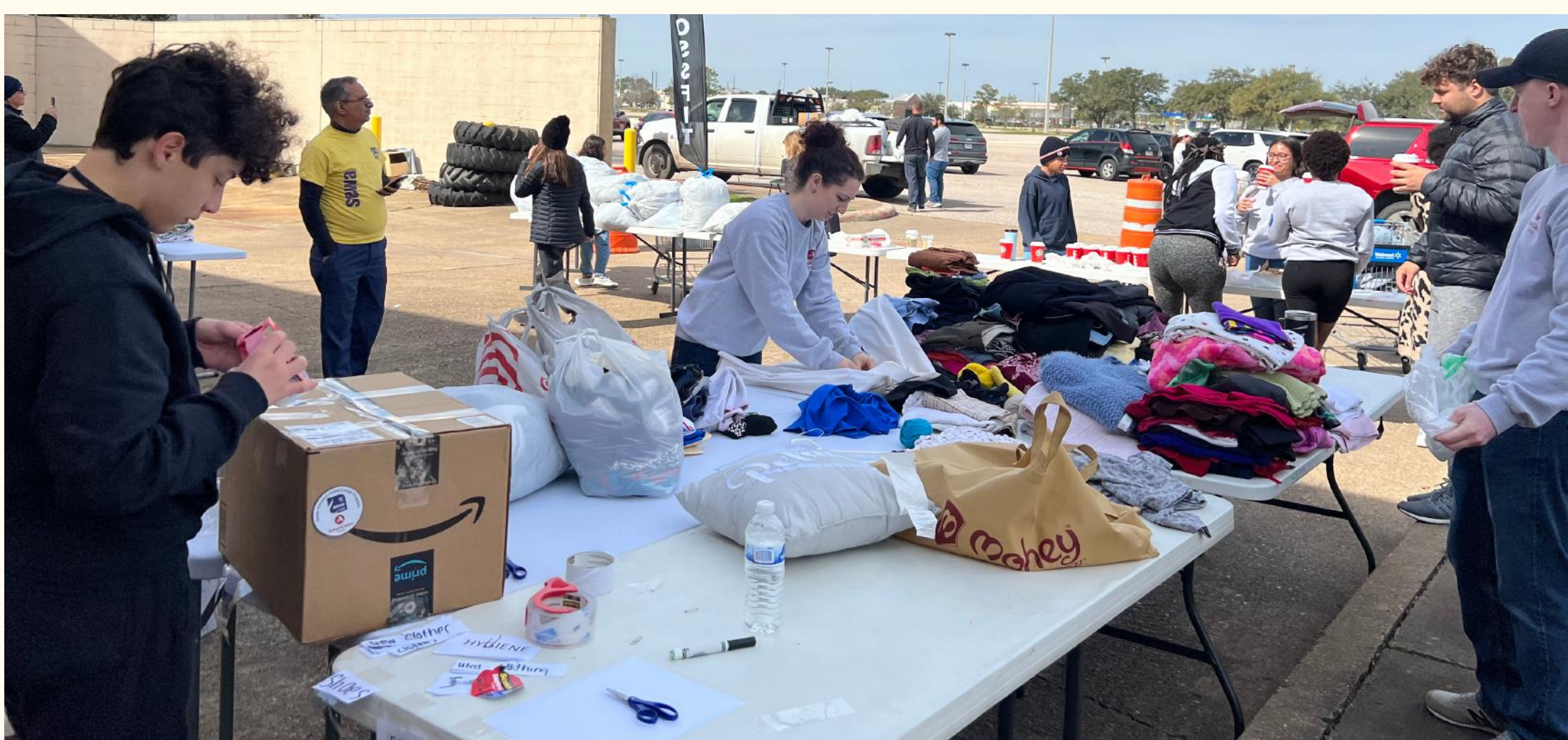
Sewa AmeriCorps team sorted and packed the donated items into the boxes to transport them to Turkey

Sewa International Houston's AmeriCorps team organized a donation drive on February 18 to support and offer relief to the survivors of the recent earthquakes in Syria and Turkey. People from Houston donated food, clothes, winter coats, hygiene items, outdoor supplies, tents, hand warmers, shoes, and baby items.