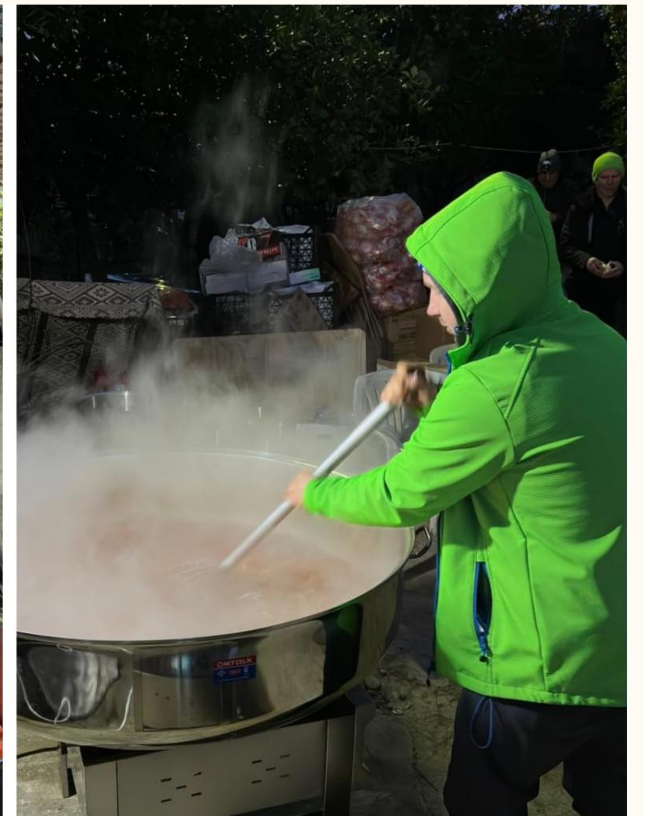
Sewa's partner organization ISKCON's Food For Life (FFL) volunteers preparing and serving food for earthquake survivors in Turkey

Sewa International has raised $64,000 to help victims of the earthquake in Turkey and Syria – with donors pitching in $49,000 on the Sewa website and $15,000 via its Facebook campaign.