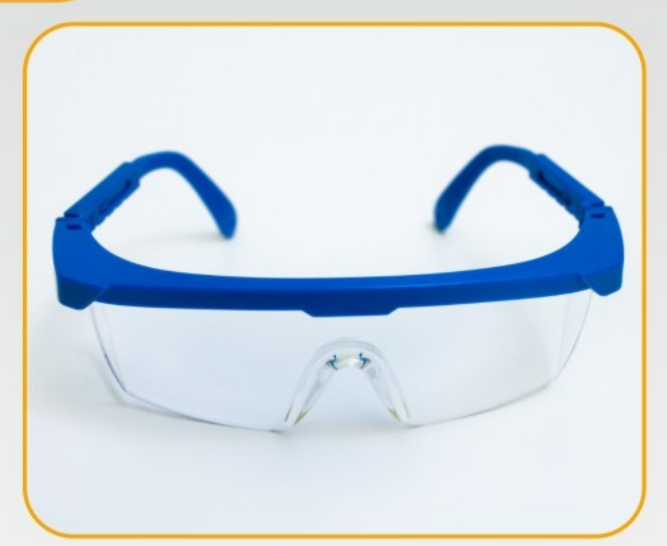
CE & EN166