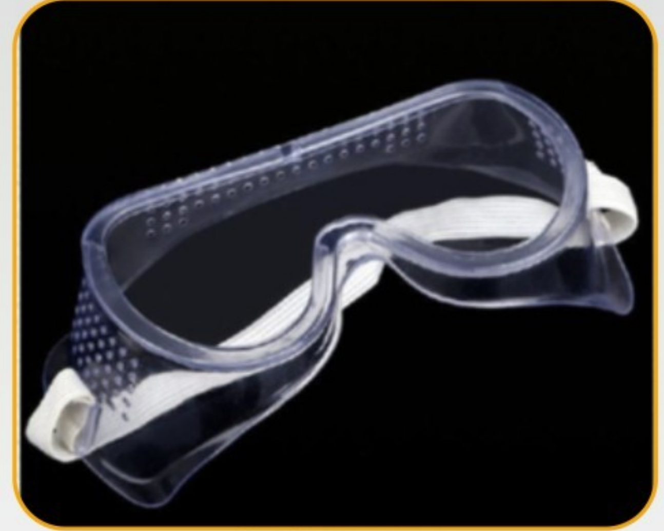
CE & EN166