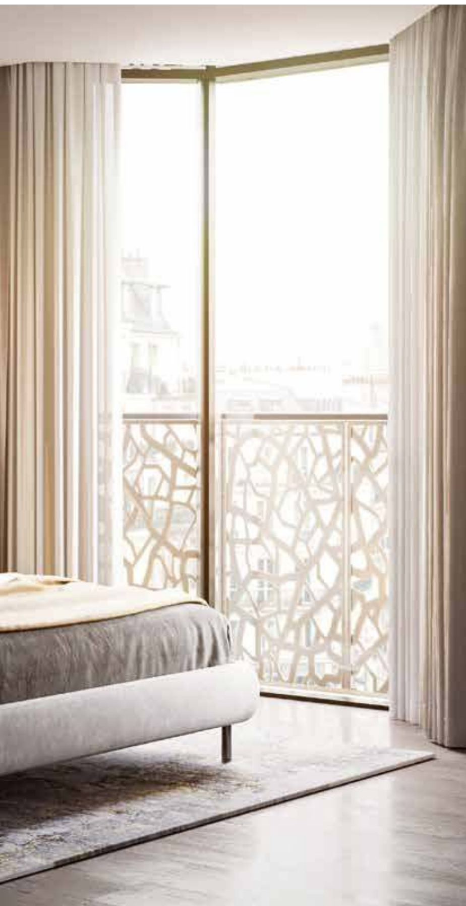
A DELIGHTFUL SANCTUARY The generous lantern bay windows ensure you start and end your day in a serene setting.