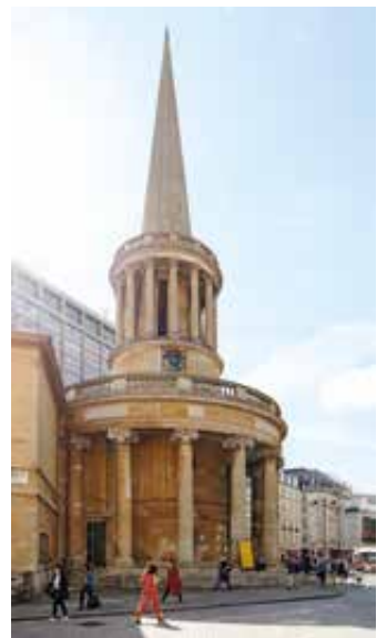
All Souls Church

GREEN STREETS The vibrant pockets of Fitzroy Square and Paddington Street Gardens provide some leafy relief.