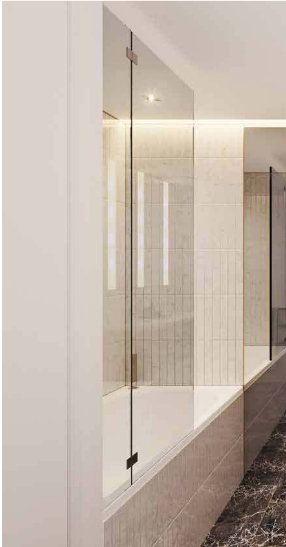
DOWN TO THE DETAILS With clean lines and quality finishes, the bathroom combines modern design with a classic touch.