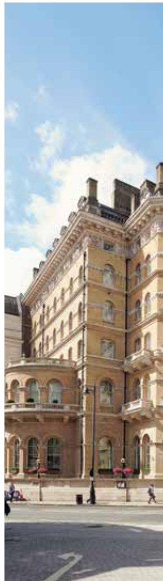
The Langham Hotel

The reputations of both Marylebone and Fitzrovia are well deserved. With its quaint storefronts and welcoming community, Marylebone is renowned for its village feel. Fitzrovia weaves historic sites and contemporary charm, creating a unique urban fabric. Today, their differences are smaller but the subtleties remain. The roads that branch off Great Portland Street are home to everything from pubs to parks, florists to famous institutions; even a number of embassies are proud to call Portland Place their home away from home. Impressively individual but perfectly complementary, both areas offer central city living at its finest.