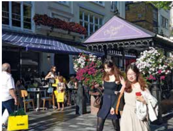
St Christopher's Place

RETAIL THERAPY Shop global brands, designer labels or independent retailers, all just a stroll away.