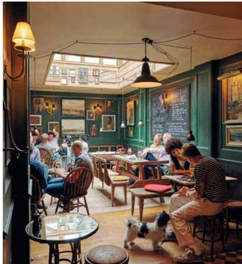
Lore of the Land