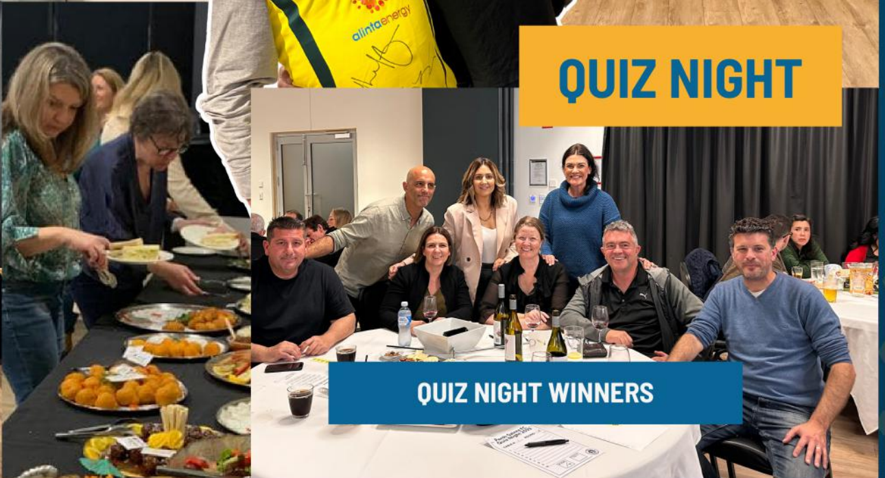
QUIZ NIGHT WINNERS