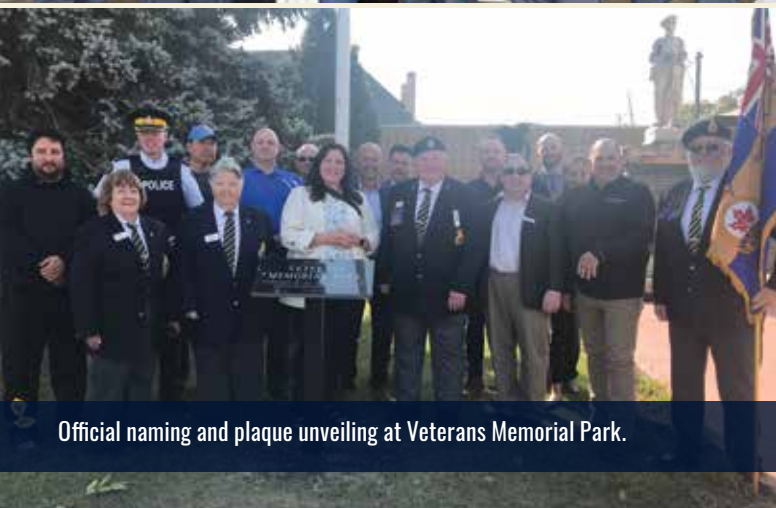
Official naming and plaque unveiling at Veterans Memorial Park.