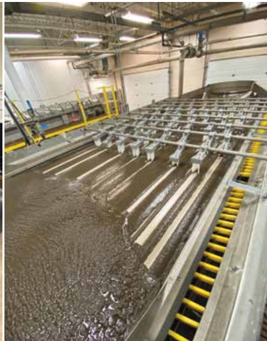
Solids processing at the Water Pollution Control Facility.