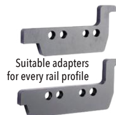
Suitable adapters for every rail profile