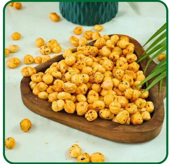
Flavored Fox Nuts