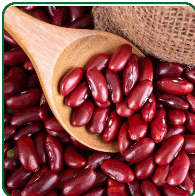
Rajma (Kidney Beans)