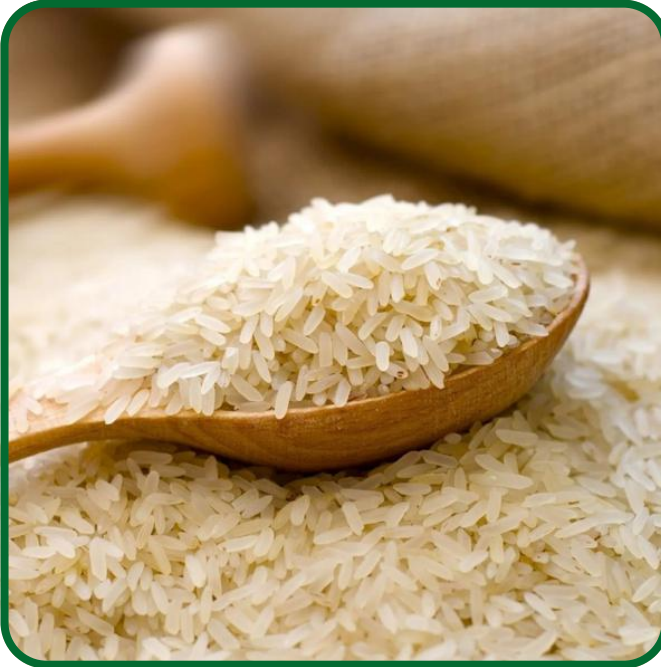
Sona Masoori Rice