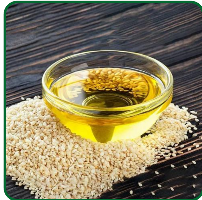
Sesame Oil (Til Oil)