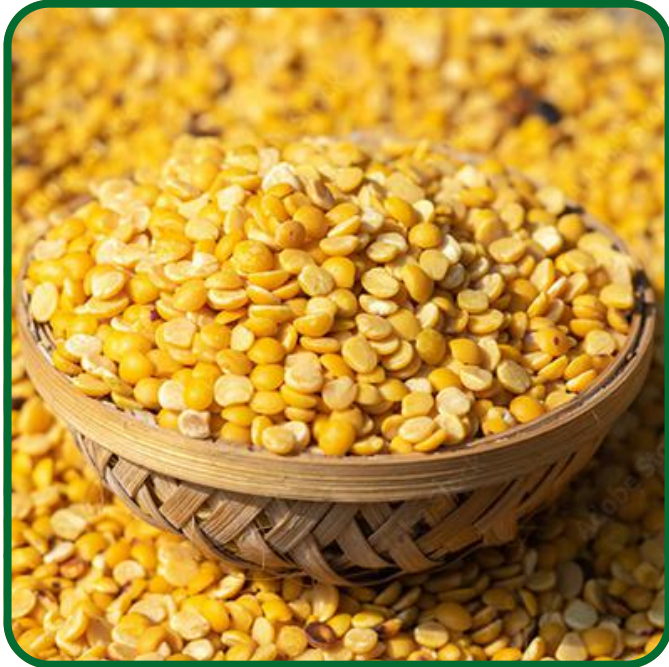
Toor Dal (Arhar Dal)