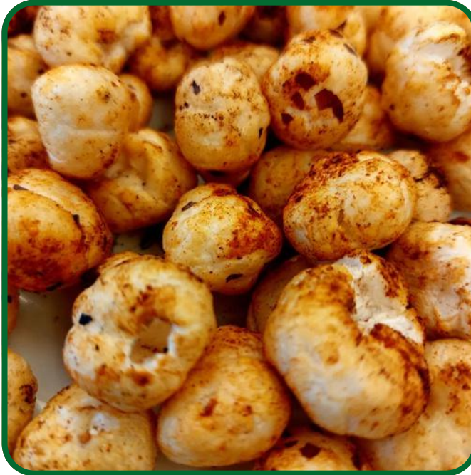
Roasted Fox Nuts