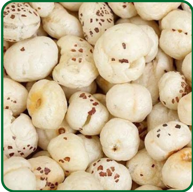
Raw Fox Nuts