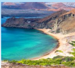
Ecuador & Galapagos May 17 - 27, 2027