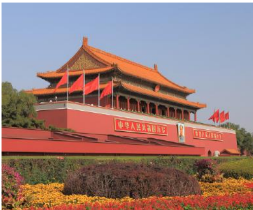
Tiananmen Square, Beijing