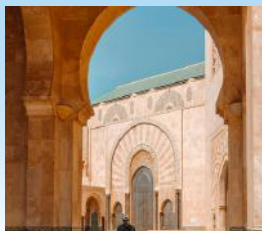
Morocco: Land of Enchantment Apr 14 - May 1, 2027