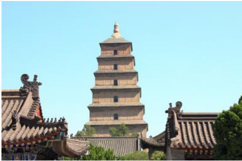
Xian Big Wild Goose Pagoda