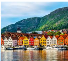
Norway and Lapland Mar 5 - 19, 2027