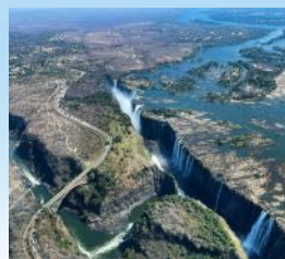
Southern Africa: Safaris and Falls Mar 5 - 19, 2027