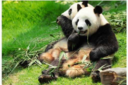
Chengdu Giant Panda Breeding and Jinsha Site Museum

Conclude the day with an authentic Sichuan hotpot dinner.