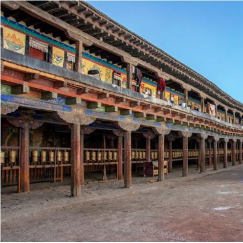
Samye Monastery, Tibet

Enjoy a buffet dinner at the hotel in the evening.