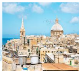
Malta to Italy Sept 14 - 28, 2027