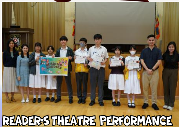
READER'S THEATRE PERFORMANCE

Reading transcends mere pastime; it serves as a gateway to enjoyment and tranquility. This year, the English Department is fervently committed to fostering students' passion for reading. Our array of activities, ranging from storytelling and book cover design competitions to Reader's Theatre and Reading Buddies program, aims to captivate and inspire. The resounding success of our reading initiatives showcase evoked palpable enthusiasm amongst students. These dynamic activities are designed to instill a lasting love for reading and establish a reading routine among students. With a vast array of reading materials available, it is essential for students to explore genres that resonate with their interests.