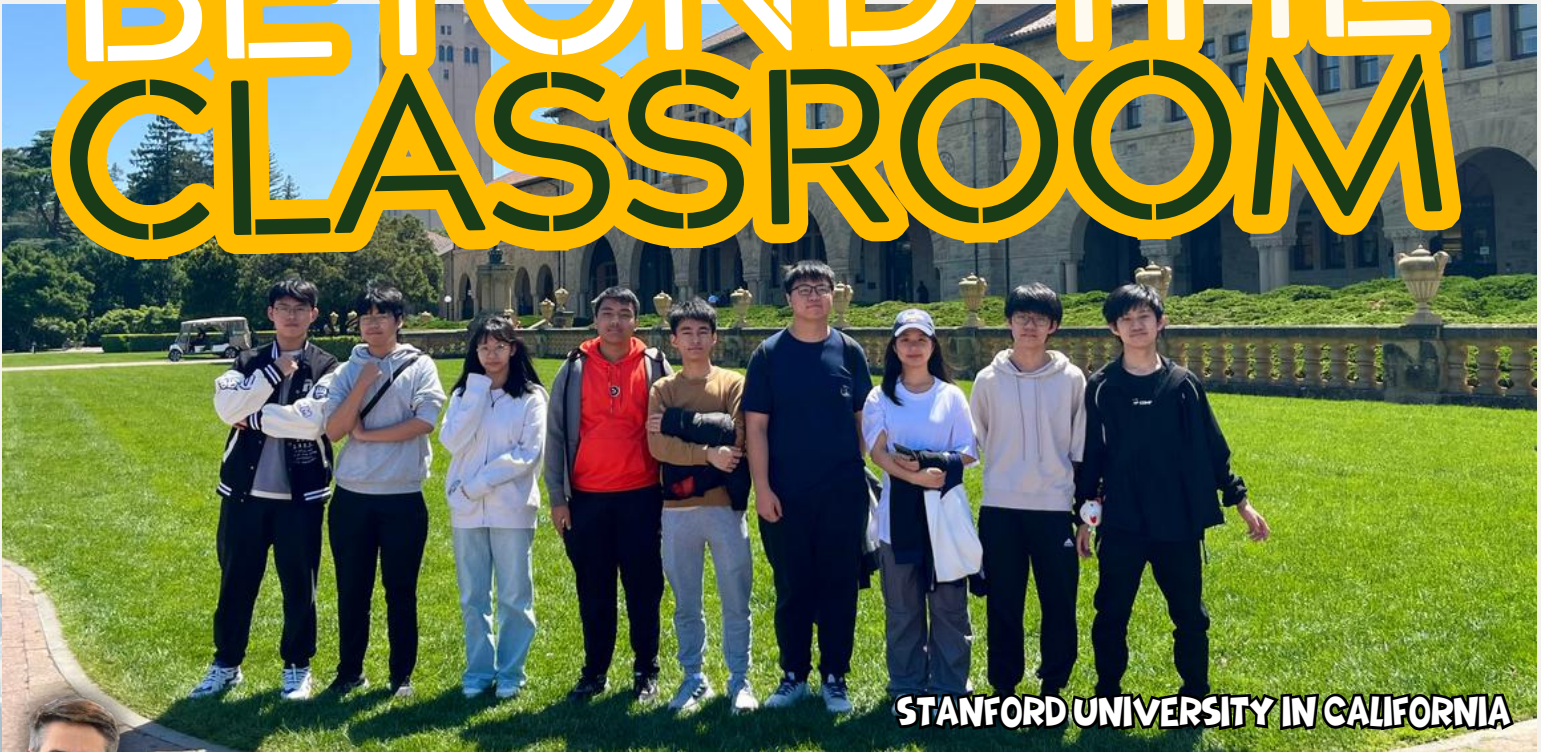
STANFORD UNIVERSITY IN CALIFORNIA