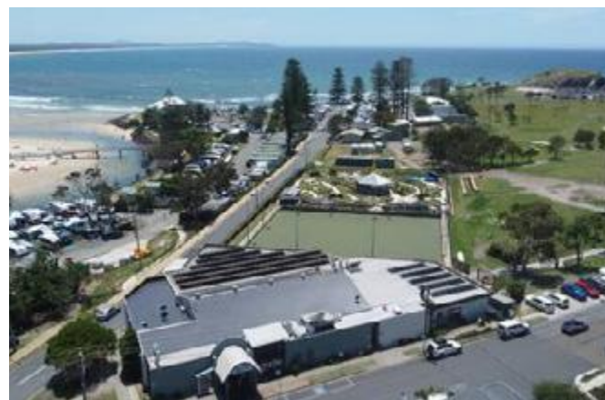
Crescent Head Country Club is right by the coast

"A great facility for local families, businesses and visitors to Crescent Head."