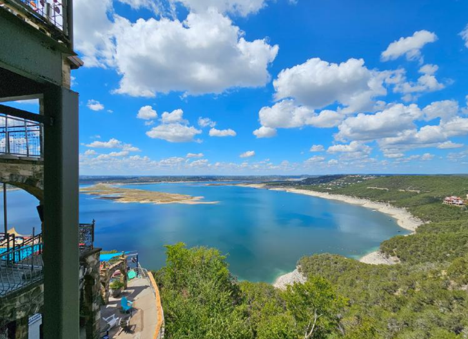
The Oasis - Lake Travis