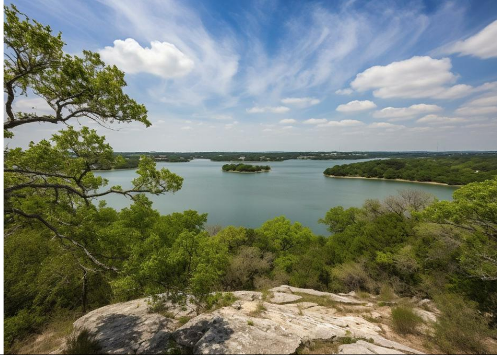
Hiking near Lake Travis