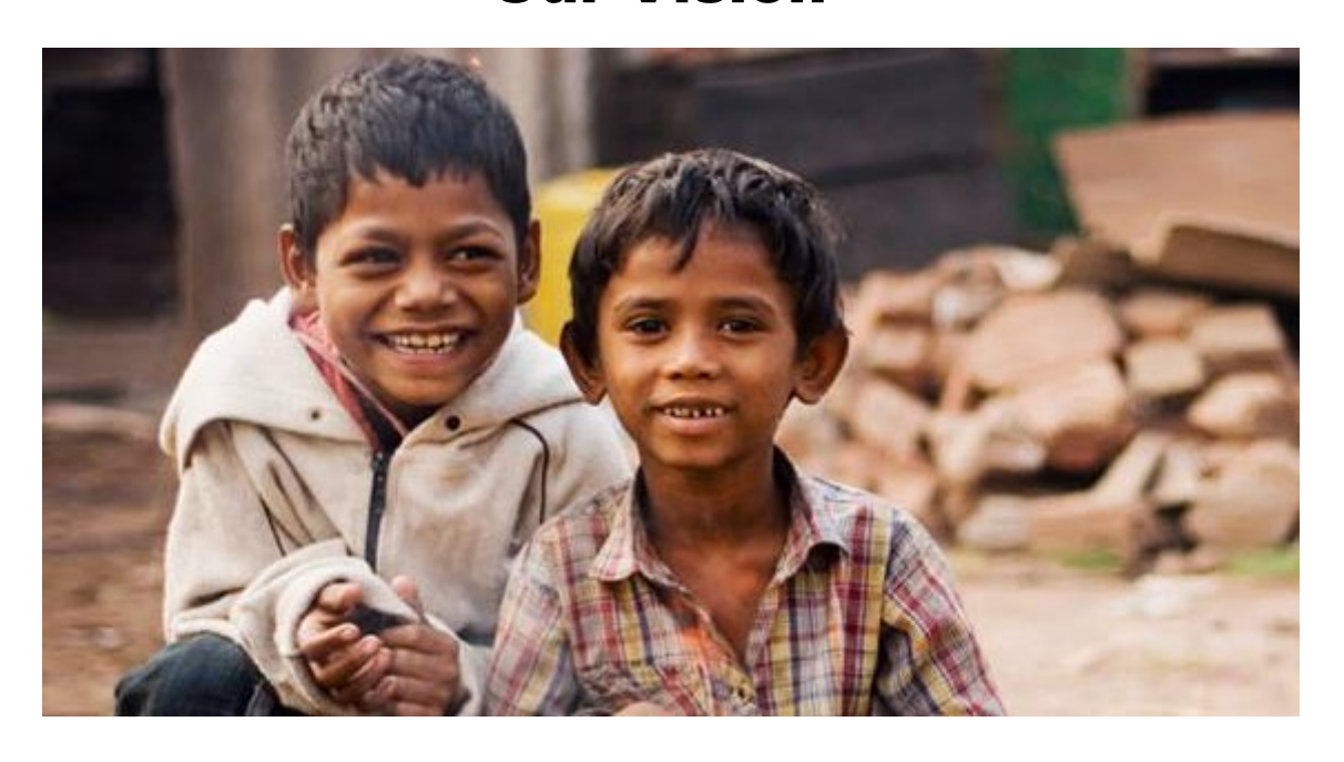
Join Us and Make It Your Vision