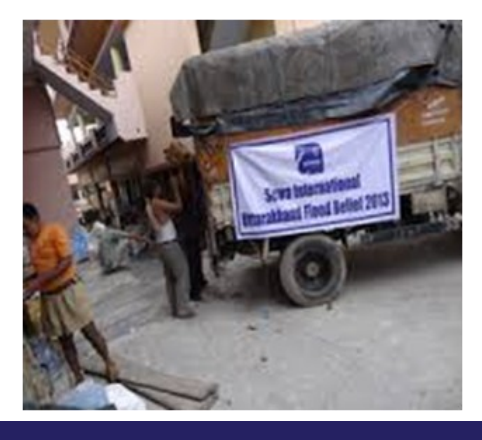
Volunteers Collecting Funds For Disaster Victims