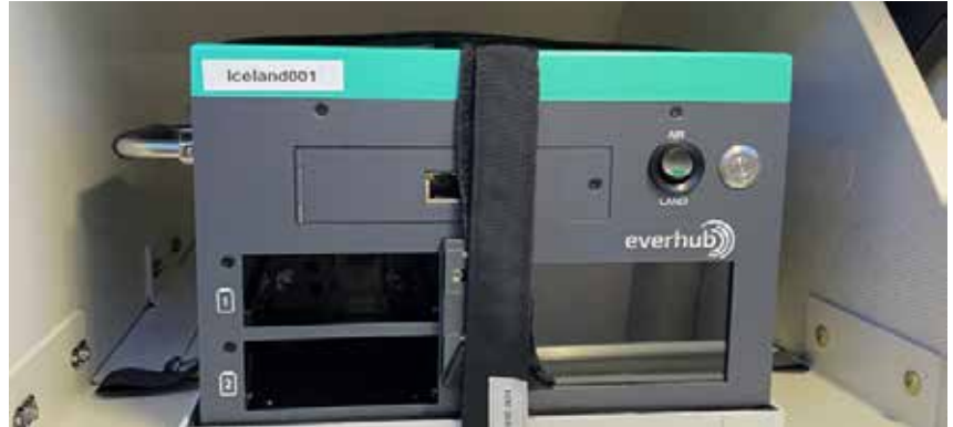
Icelandair 737 MAX 8