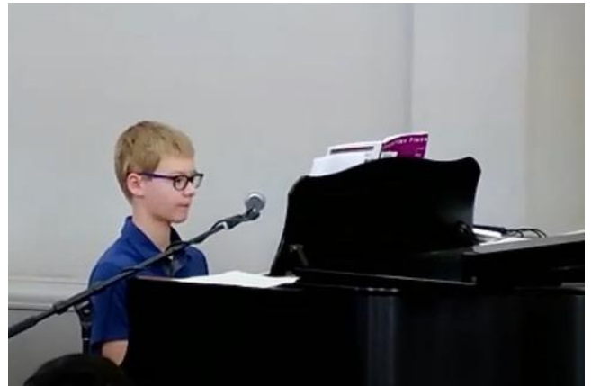
PRAISE TEAM LEADING THE "GATHERING SONGS" DURING THE SUMMER.