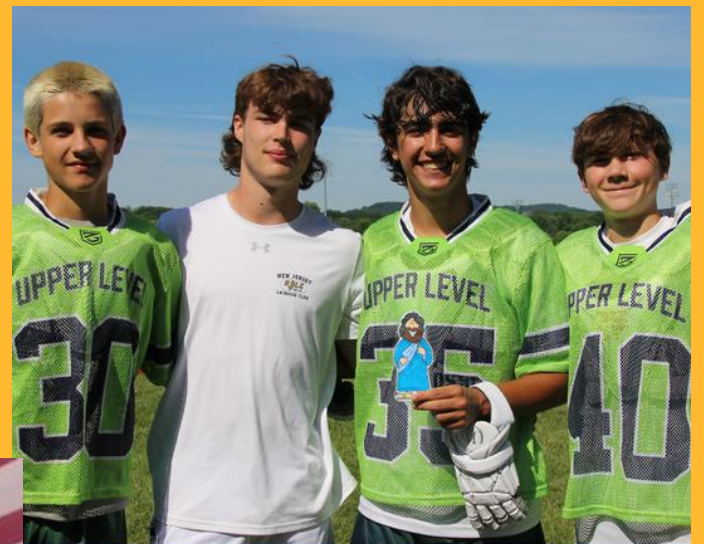
LEHIGH LAXFEST WITH FLAT JESUS