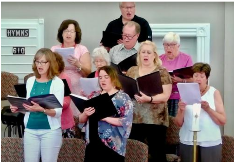
THE SUMMER CHOIR SINGING "THE SOUND OF MUSIC" ON JULY 21ST.