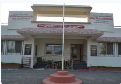
Sanvedana Divya Rehabilitation Centre-Latur