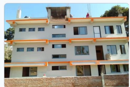
Dolakha Chhatravas (Boy's hostel) Construction Project