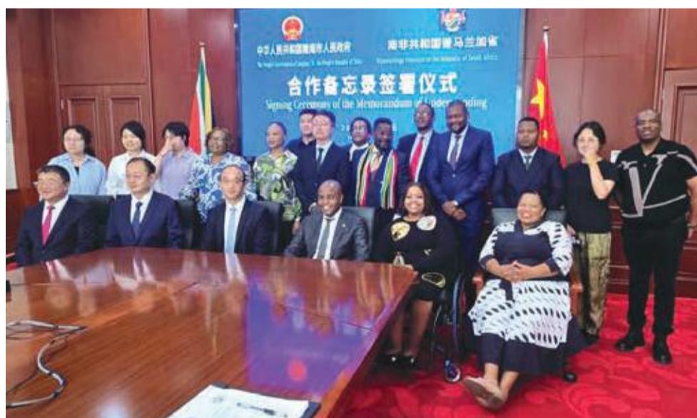
Delegates from both countries after the MOU was successfully signed.