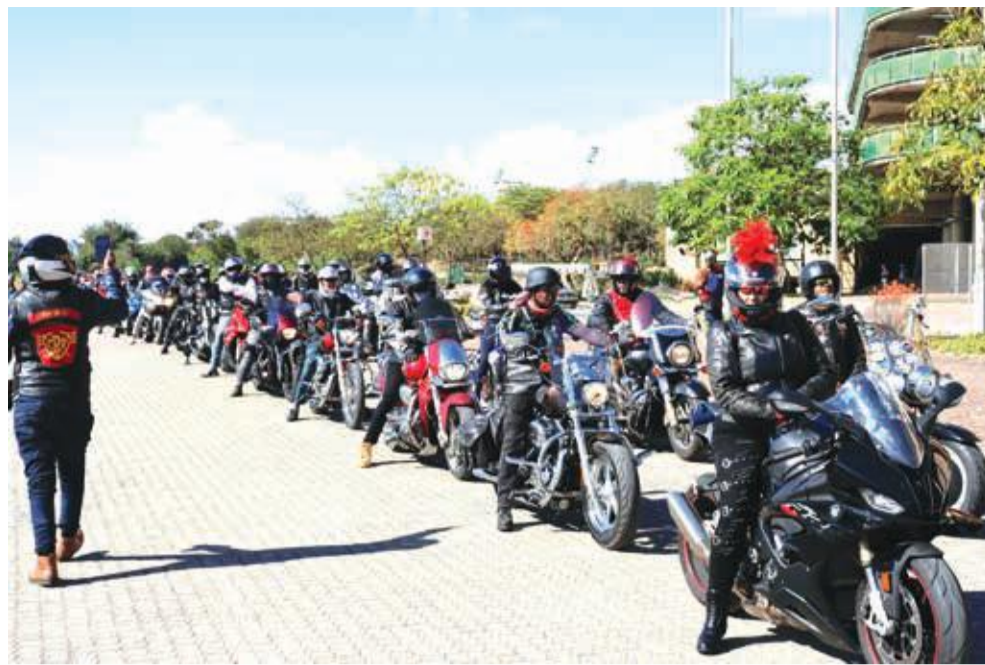
Bikers preparing for a mass ride around Mbombela.