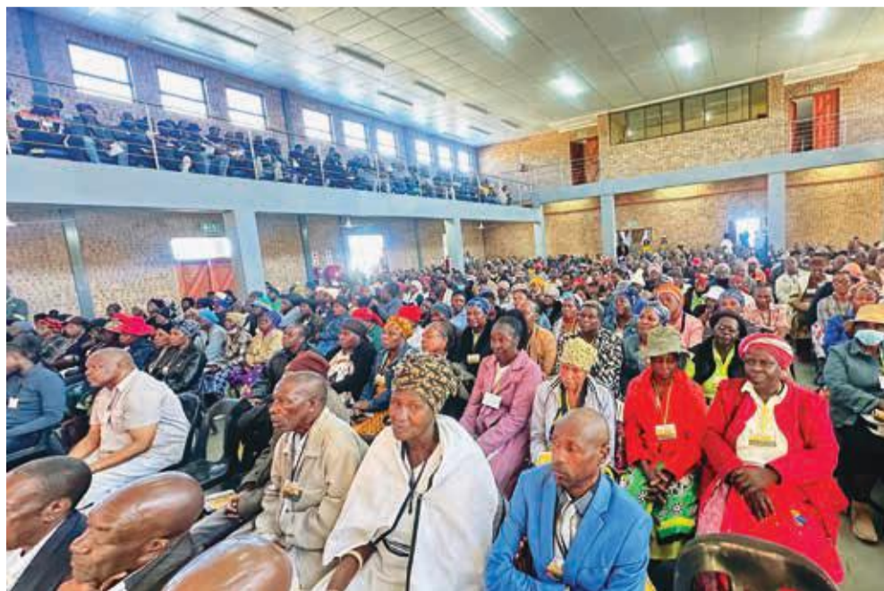
Mpumalanga cultural diversity on full display ahead of the Agricultural Show.

DARDLEA said the Farmers Roadshow will continue in Mbombela (18 June), Nkomazi (26 June), Nkangala District(3 July), and Gert Sibande District(10 July).