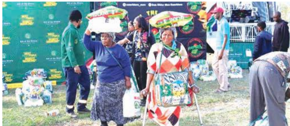
Happy recipients who got some food parcels.

The evening leg of the event kept revelers on their feet with a music festival that featured leading local and national entertainers such as Zee Nxumalo, Dj Kabza Da Small, to mention but a few.