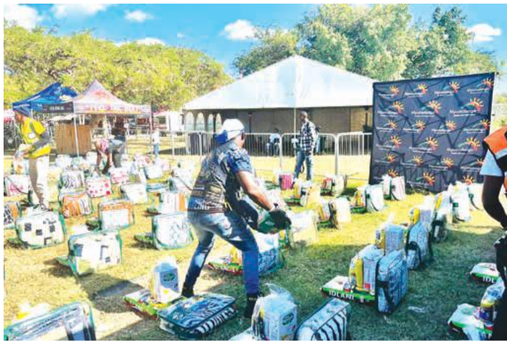
Some of the food parcels donated by Gift of the Givers.