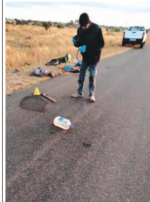
Police officer assessing the items found after the incident.