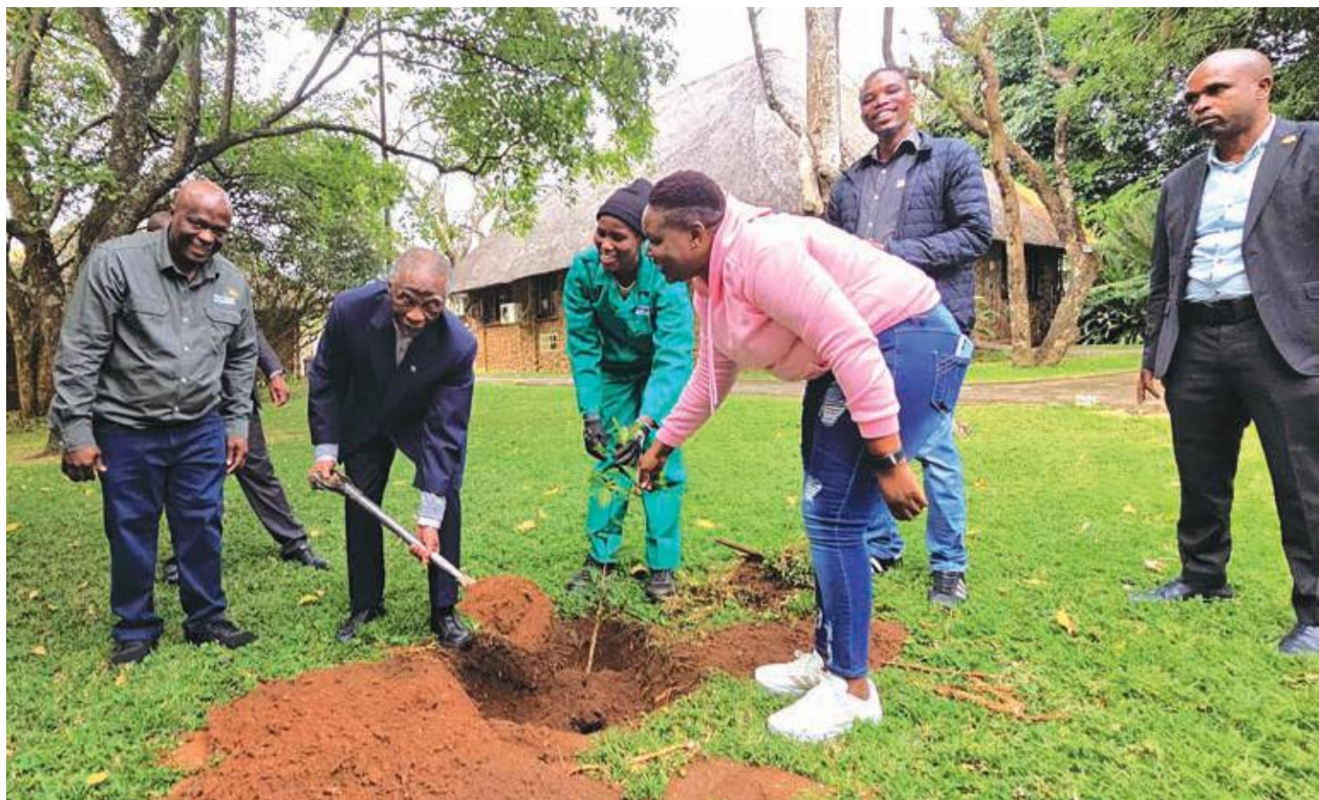
Former President Thabo Mbeki planting a tree during his visit.