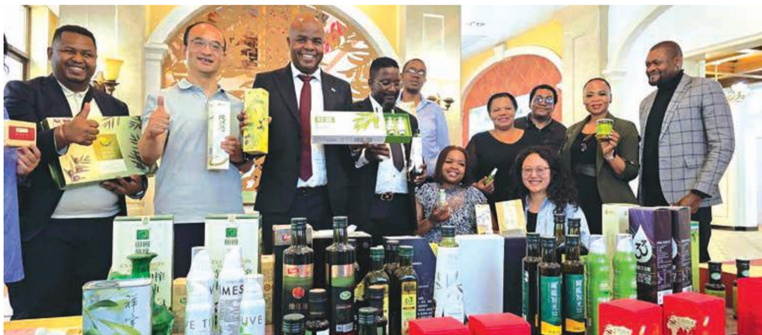
Mpumalanga delegation displaying products made from an olive farm in China.