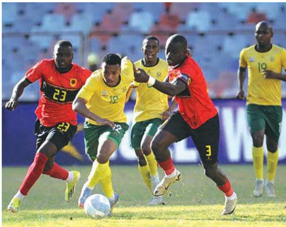
Bafana player trying to penetrate Angolan defence.