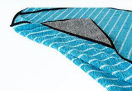
BAMBOO MICROFIBER WINDOW CLOTH