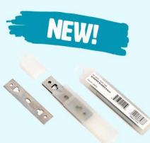
0,2 MM SHARKBLADE SCRAPER BLADES