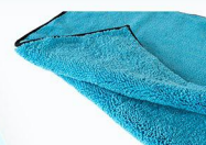
UNIVERSAL MICROFIBER CLOTH