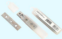
0,4 MM SINGLE EDGED SCRAPER BLADES