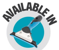
15CM / 6" LIQUIDATOR 15 CM