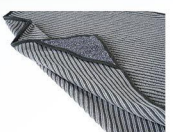
PRO BAMBOO CLOTH