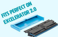
MULTI SCRAPER 10CM / 4"