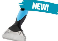
PREMIUM SNAPPER 2.0