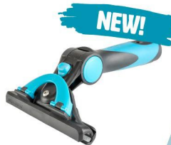
EXCELERATOR WIDE BODY