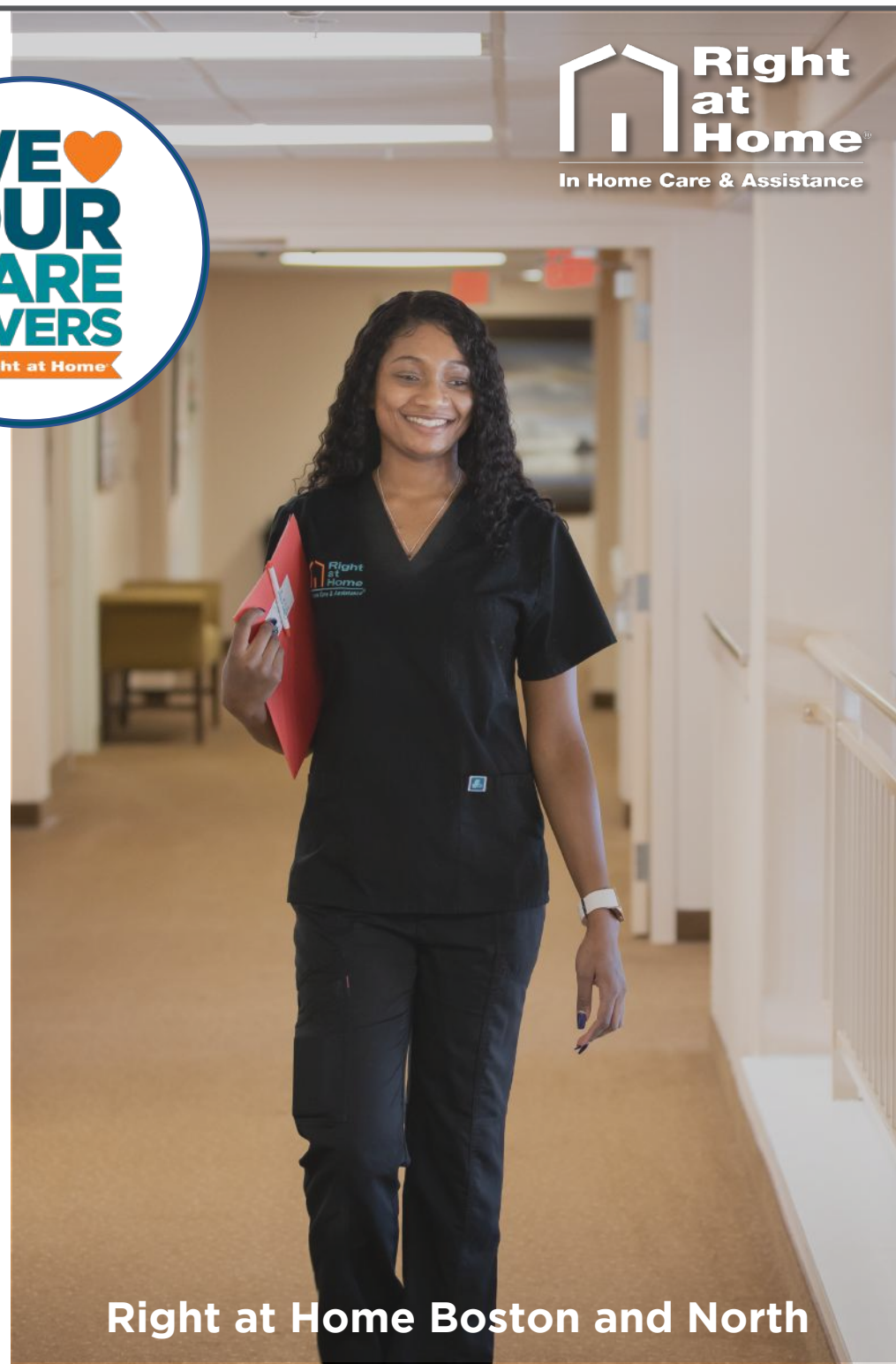
Right at Home Boston and North