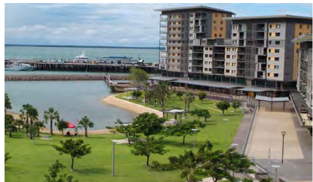
.... or booming Darwin