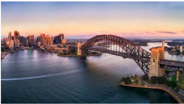
The 2012 choice: mediocre Sydney ...

The Darwin market is booming. The market in Sydney is not (and has been subdued for many years). What does the investor do? Her decision will impact on her financial future.