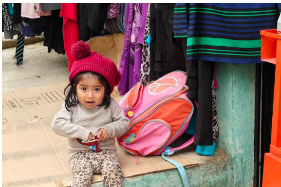
Child in Aguacate

A part of my heart has remained there when I remember the faces of the children and families and hold them in my prayers.