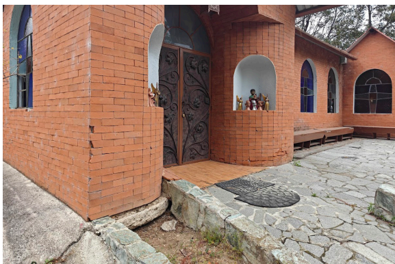
Hogar Miguel Magone Chapel

This past Lent I had the privilege to join an intergenerational group of Lutheran church leaders and their families to return to Guatemala to see various ministries including Hogar Miguel Magone! It was humbling to see it 19 years later where the completed chapel is surrounded by