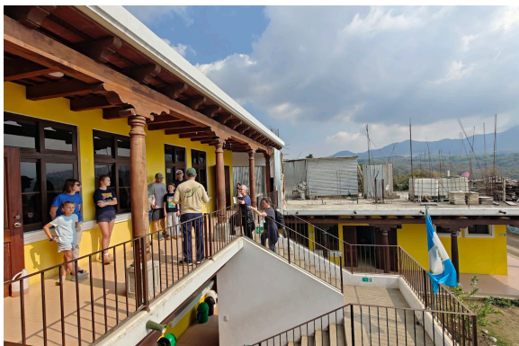
Hope Academy from the 2nd floor

while there is no tuition to attend school, families are required to pay for uniforms and all supplies. And if there is money to send children to school, the boys take precedence.