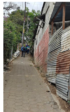
Life in Aguacate