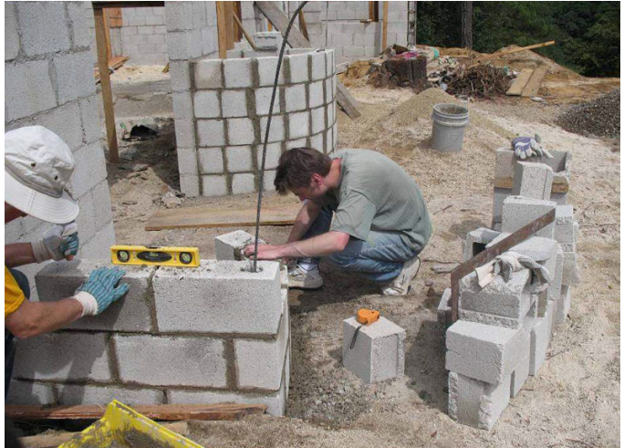
Hogar Miguel Magone Chapel under construction in 2007