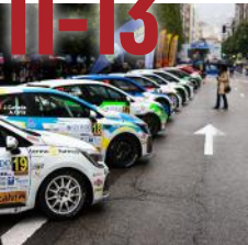
Sport. 62nd Blendio Rally, Oviedo