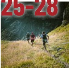
Sport. Mountain and Trail Running, Canfranc