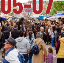
Festivities. Medieval Fair, Buitrago de Lozoya