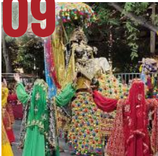
Festivities. Moros y Cristianos, Murcia