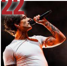
Music. Damiano David, Madrid