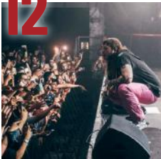
Music. Post Malone, Barcelona