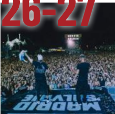
Music. Madrid Salvaje, Madrid