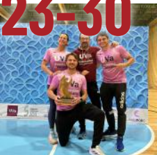
Sport. European Sports Week 2025, Segovia