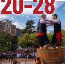
Festivities. San Mateo, Logroño