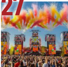
Music. Love the Twenties Festival, Murcia