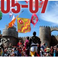
Festivities. Medieval Festival, Ávila