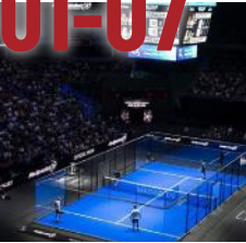
Sport. Premier Padel, Madrid