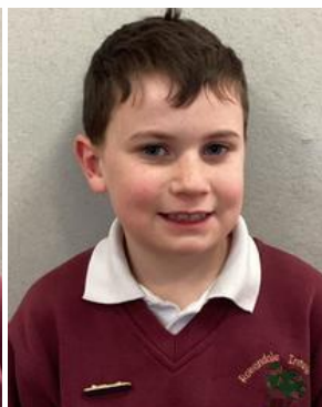
Ronan Finance Team