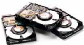
Shredding hard drives

Many are disposed of carelessly; offered for sale at car boot sales or sold on ebay, the data allegedly having been deleted using conventional wiping routines. This is an open invitation for the data to be misused; it is extremely easy to restore and retrieve confidential data.