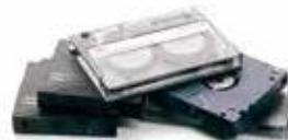
Shredding magnetic tapes