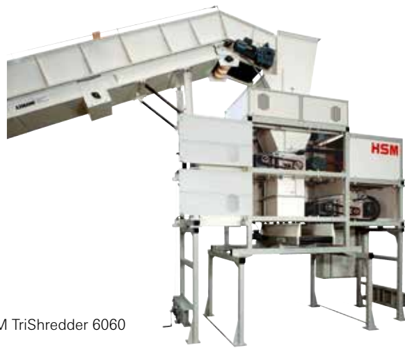
HSM TriShredder 6060