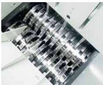
Cutting unit stage 1: Pre-shredder