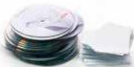
Shredding CDs, DVDs and Blu-ray discs, credit cards and customer cards