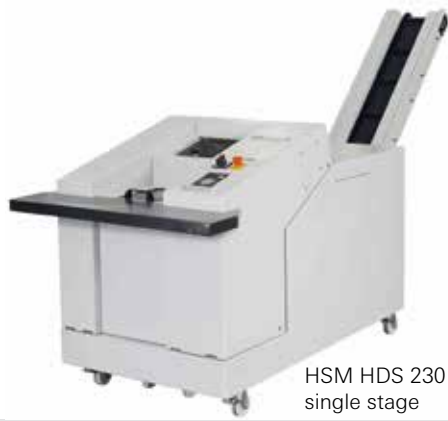
HSM HDS 230 single stage