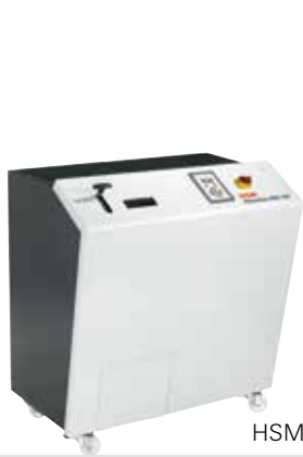
HSM HDS 150