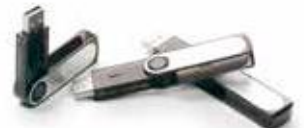
Shredding USB sticks