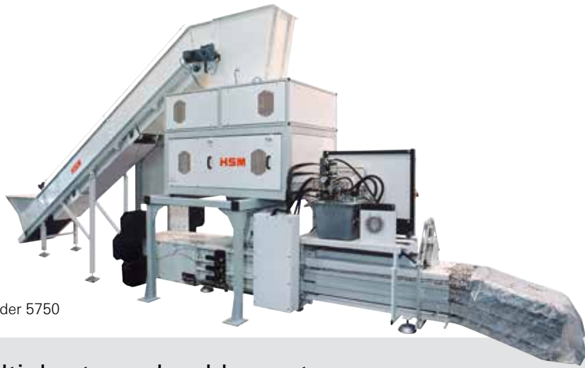
HSM DuoShredder 5750