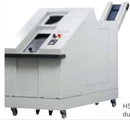
HSM HDS 230 dual stage