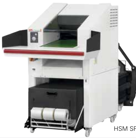
HSM SP 5088