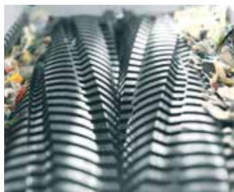
Cutting unit stage 2: downstream shredder