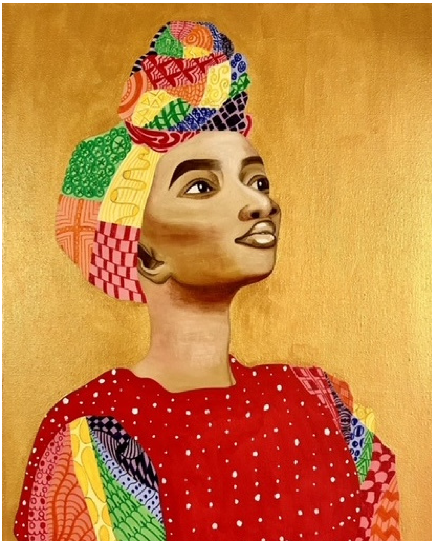
Flawless Chaos , Acrylic, oil, marker on canvas, 16 x 20 x 1 inches ($300)