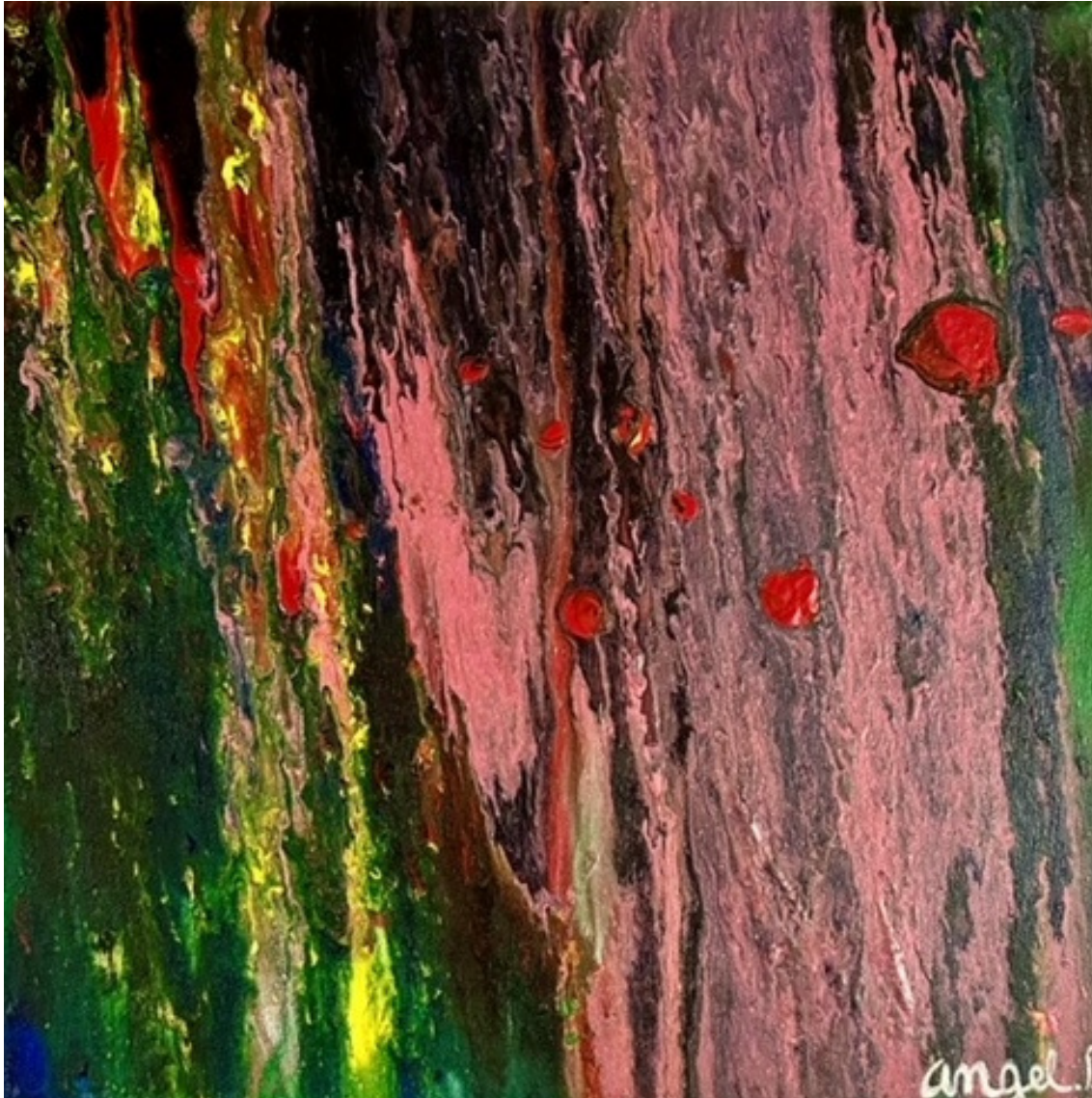
Flawless Chaos , Acrylic and laundry detergent on canvas, 12 x 12 x 1 inches ($100)