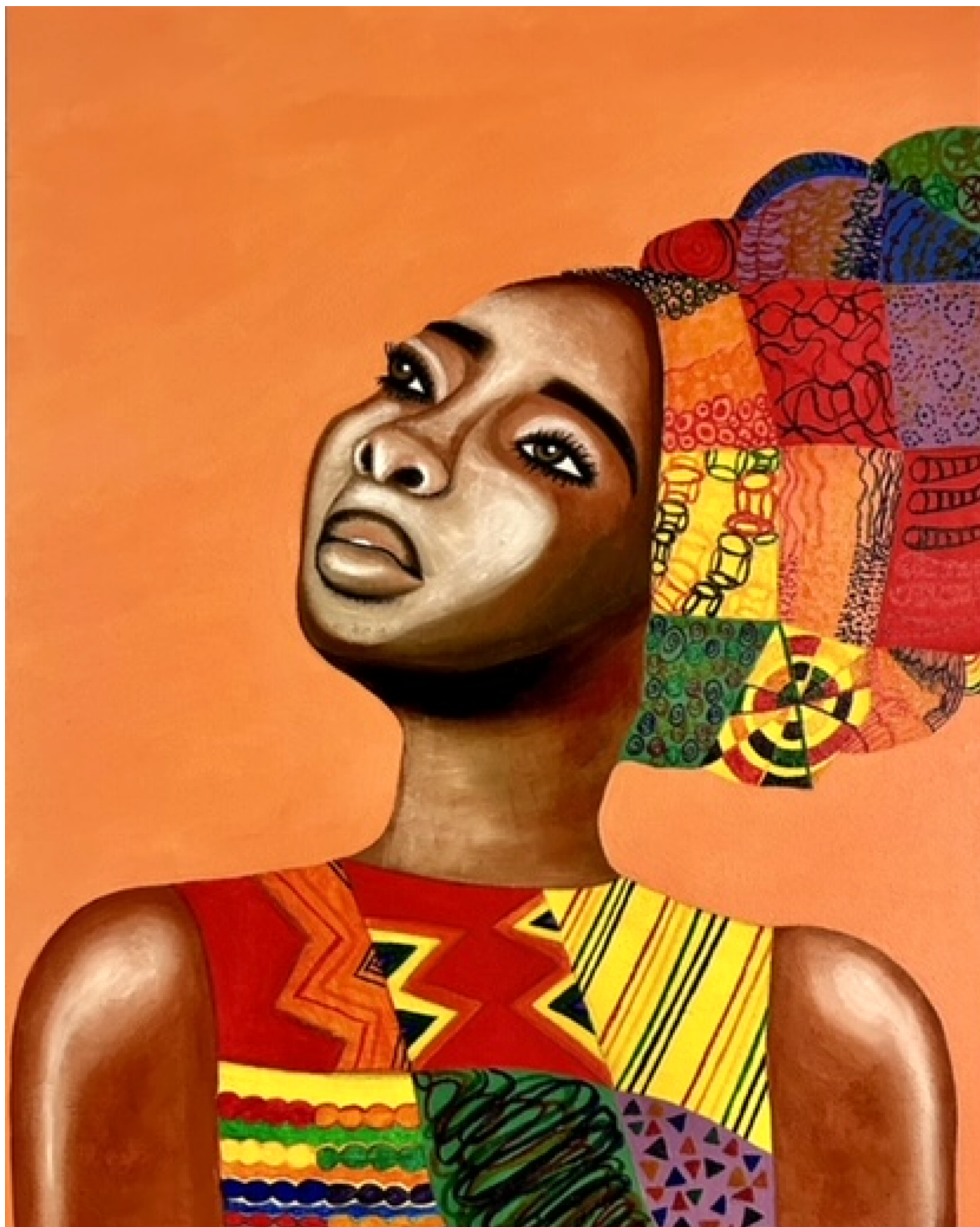
Flawless Chaos , Acrylic, oil, marker on canvas, 16 x 20 x 1 inches ($300)