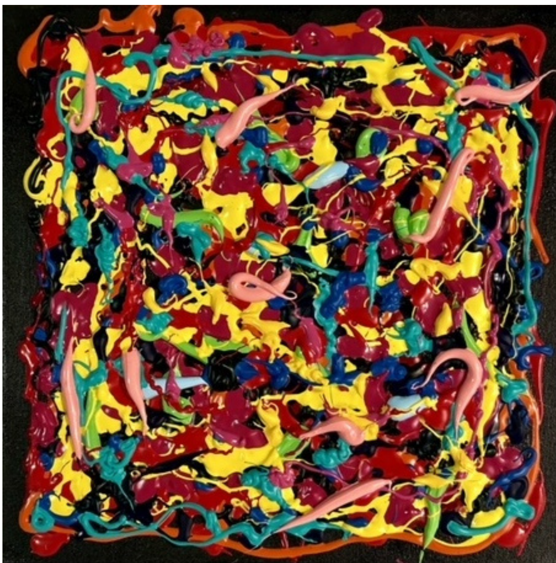
Flawless Chaos , Acrylic on canvas, 12 x 12 x 1 inches ($100)