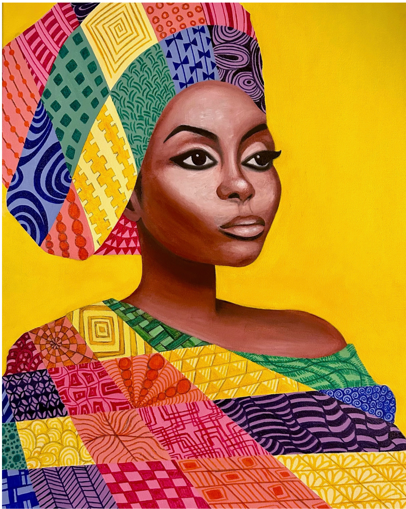
Flawless Chaos , Acrylic, oil, marker on canvas, 16 x 20 x 1 inches ($300)