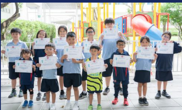
STAR OF THE WEEK 20TH SEPTEMBER 2024