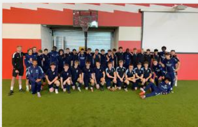
Arsenal FC Training Ground