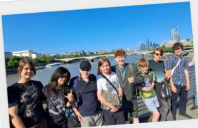
Japan Club Theatre Trip

We're proud to offer these enriching opportunities that develop character as much as knowledge. Enjoy a look back through some of the highlights—and thank you to all the staff who made these moments possible!