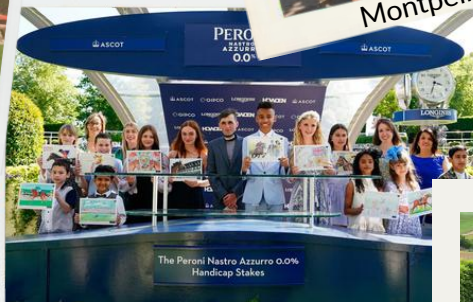
Ascot Art Competition