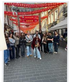
A Level English Theatre Trip