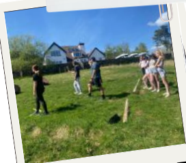
Tyr Abad Science Trip