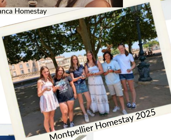
Montpellier Homestay 2025