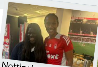
Nottingham Forest FC