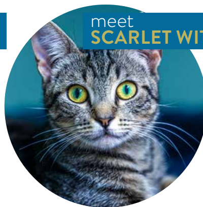
meet SCARLET WITCH