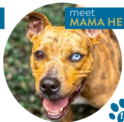
meet MAMA HEN