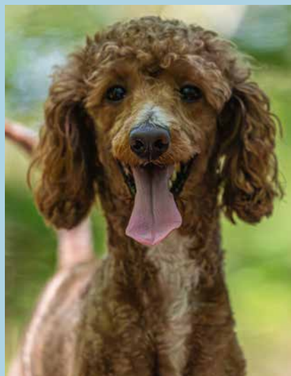
meet DJ SKIP TRAC