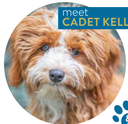
meet CADET KELLY