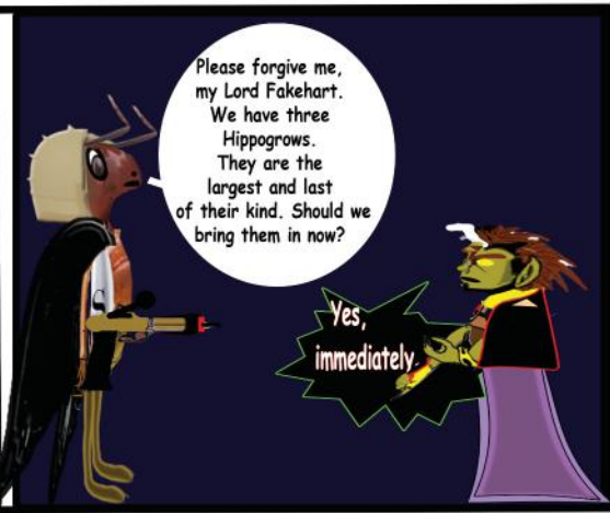
The guard saw the large Hippogrows, volcano scientists, working. They told them Lord Fakehart wanted to reward them and they should follow them to his chambers.