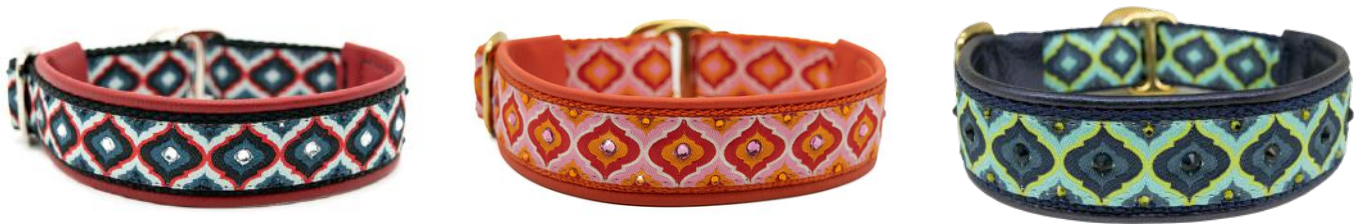
1" Wide Lumiere: Red, Tangerine, Navy