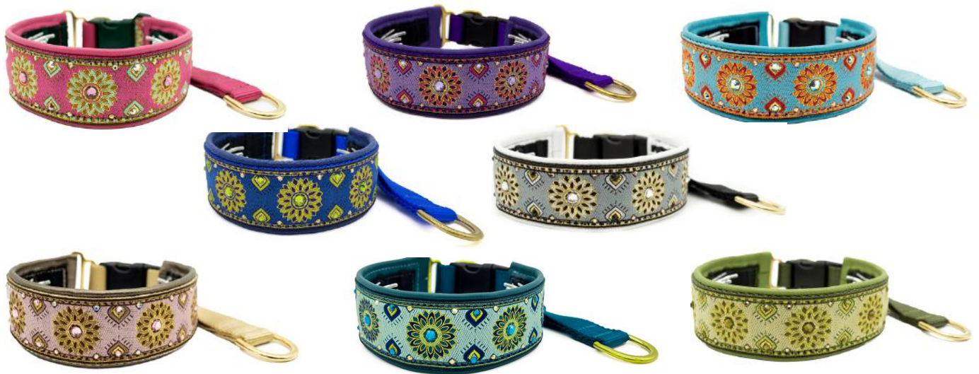
1.5" Wide Luxe Kerala Private Trainer: Vivid Pink, Purple, Aqua, Royal Blue, Steel, Blush, Teal, Chartreuse