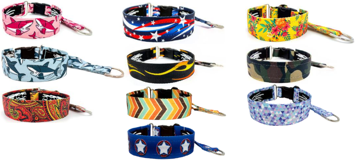
1.5" wide Everyday Private Trainer Collar: Femme Fatale, Patriot, Tropical Paradise, Shark Attack!, Hotrod, Camo, Fire Paisley, Harvest Chevron, Seurat, Superhero