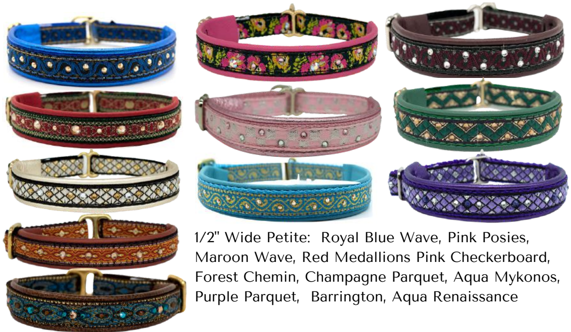
1/2" Wide Petite: Royal Blue Wave, Pink Posies, Maroon Wave, Red Medallions Pink Checkerboard, Forest Chemin, Champagne Parquet, Aqua Mykonos, Purple Parquet, Barrington, Aqua Renaissance