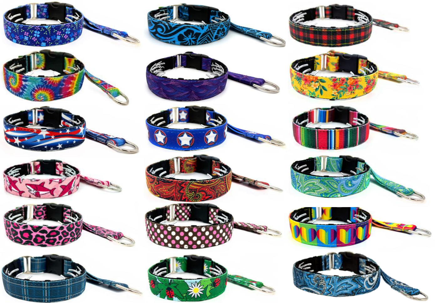
1" wide Everyday Private Trainer Collar: Sunday Morning, Blue Tahitian, Red Plaid, Tie Dye Swirl, Endless Waves, Tropical Paradise, Patriot, Superhero, Serape, Femme Fatale, Fire Paisley, Seaside Paisley, Pink Leopard, Neapolitan Dots, Rainbow Hearts, Blue Plaid, Ladybug Picnic, Black and Blue Paisley