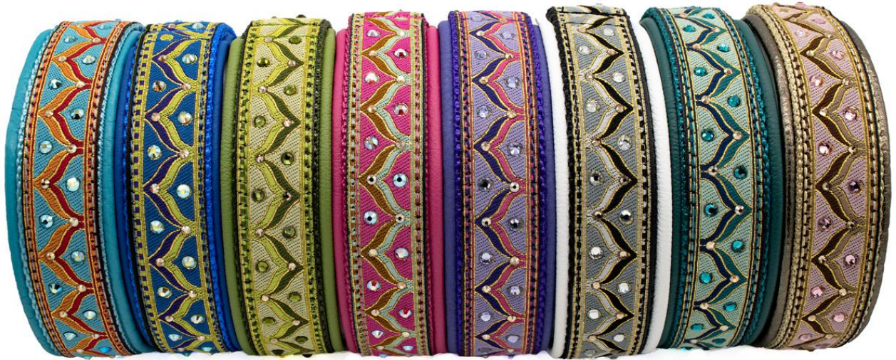
1" Wide Kismet: Aqua, Royal Blue, Kiwi, Vivid Pink, Purple, Steel, Teal, Blush