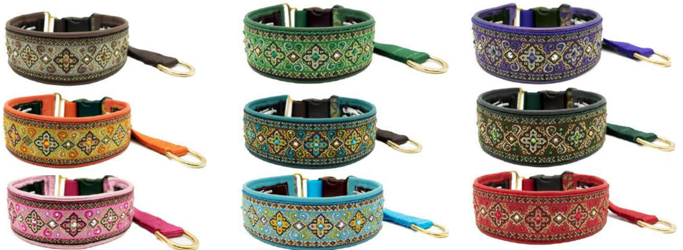
1.5" Wide Luxe Croix Private Trainer: Stone/Chocolate, Green, Purple, Orange/Daffodil, Teal/Chocolate, Forest, Pink, Aqua, Red