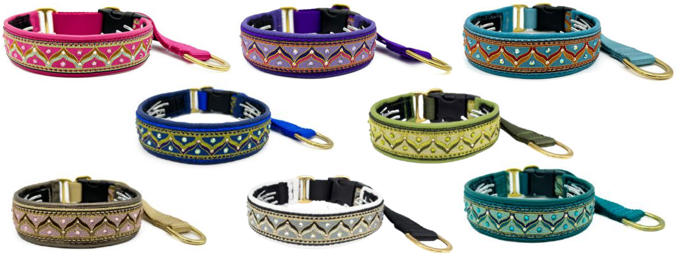
1" Wide Luxe Kismet Private Trainer: Vivid Pink, Purple, Aqua, Royal Blue, Kiwi, Blush, Steel, Teal