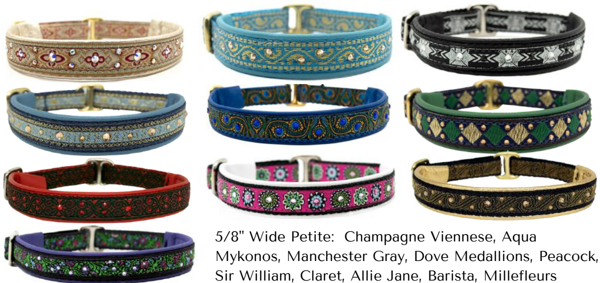
5/8" Wide Petite: Champagne Viennese, Aqua Mykonos, Manchester Gray, Dove Medallions, Peacock, Sir William, Claret, Allie Jane, Barista, Millefleurs