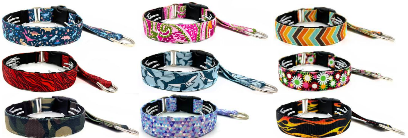
1" wide Everyday Private Trainer Collar: Dinomite!, Pink Paisley, Harvest Chevron, Fahrenheit, Shark Attack!, Daisy Fields, Camo, Seurat, Hotrod