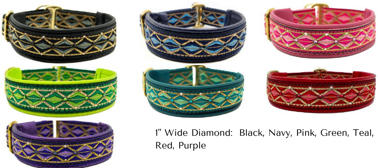
1" Wide Diamond: Black, Navy, Pink, Green, Teal, Red, Purple