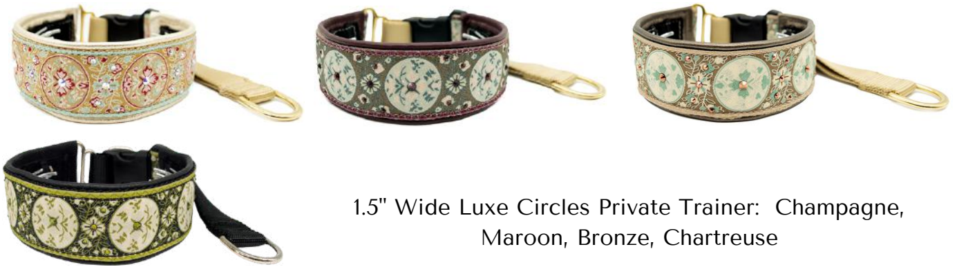
1.5" Wide Luxe Circles Private Trainer: Champagne, Maroon, Bronze, Chartreuse