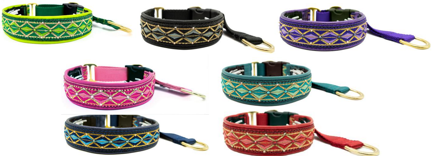
1" Wide Luxe Diamond Private Trainer: Green, Black, Purple, Pink, Teal, Navy, Red