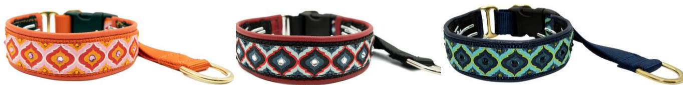
1" Wide Luxe Lumiere Private Trainer: Tangerine, Red, Navy