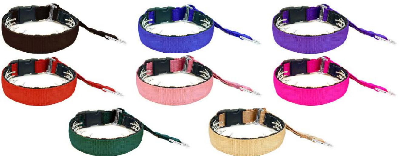
1" Wide Everyday Basic Private Trainer: Black, Royal Blue, Purple, Red, Light Pink, Neon Pink, Forest Green, Tan