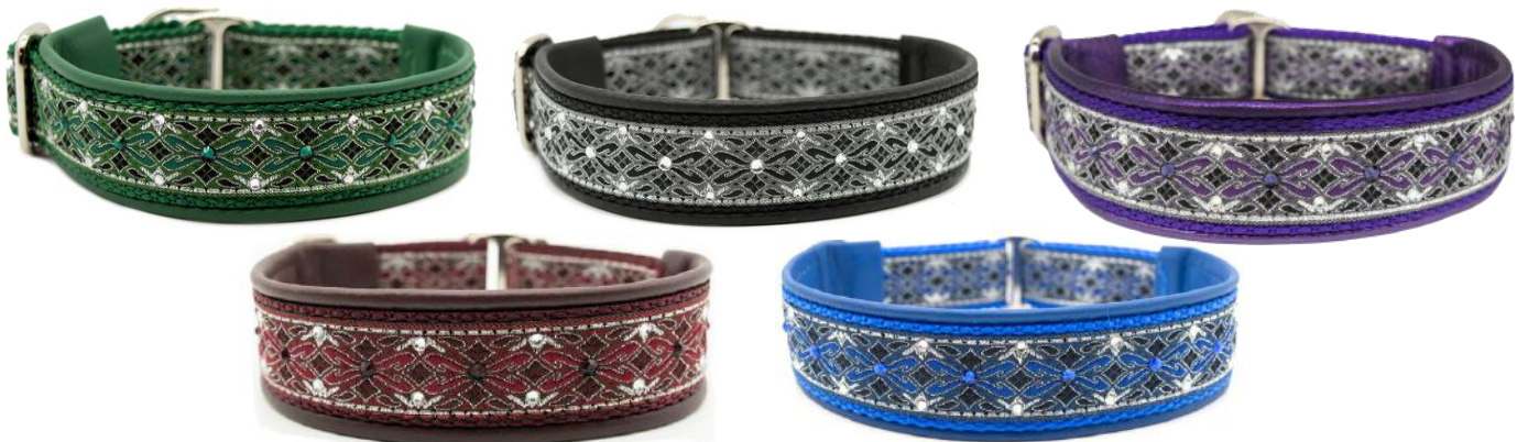
1" Wide Winchester: Green, Black, Purple, Maroon, Sapphire