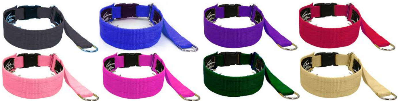
1" Wide Everyday Basic Private Trainer: Black, Royal Blue, Purple, Red, Light Pink, Neon Pink, Forest Green, Tan