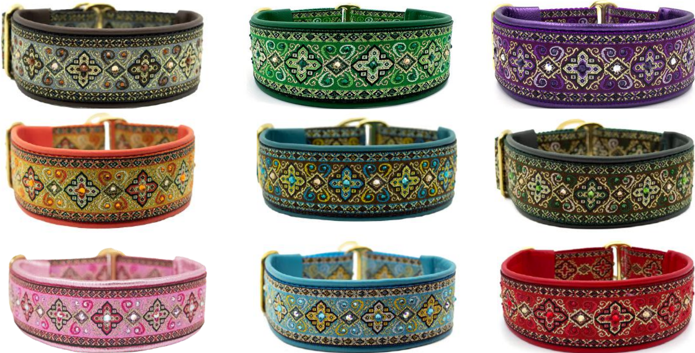
1.5" Wide Croix: Gray, Green, Purple, Orange, Teal, Forest, Pink, Aqua, Red