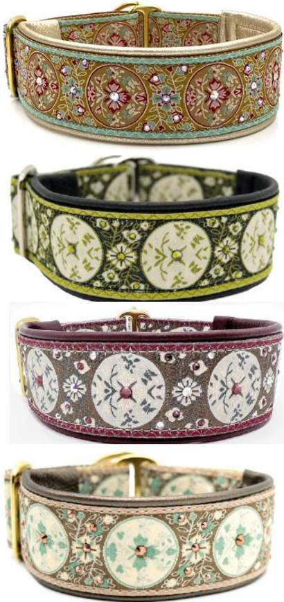
1.5" Wide Circles: Champagne, Chartreuse, Maroon, Bronze