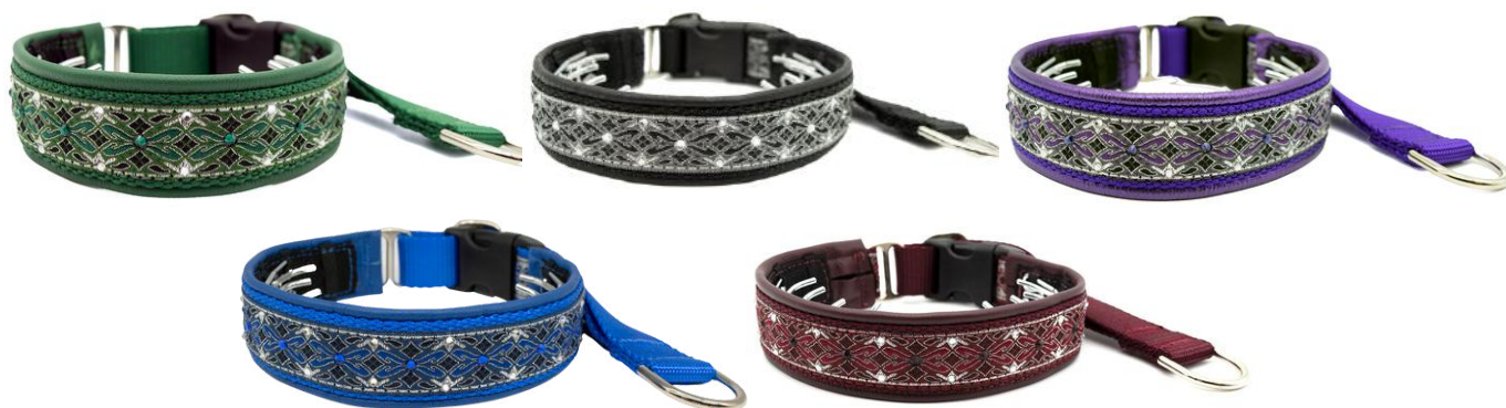
1" Wide Luxe Winchester Private Trainer: Green, Black, Purple, Sapphire, Maroon