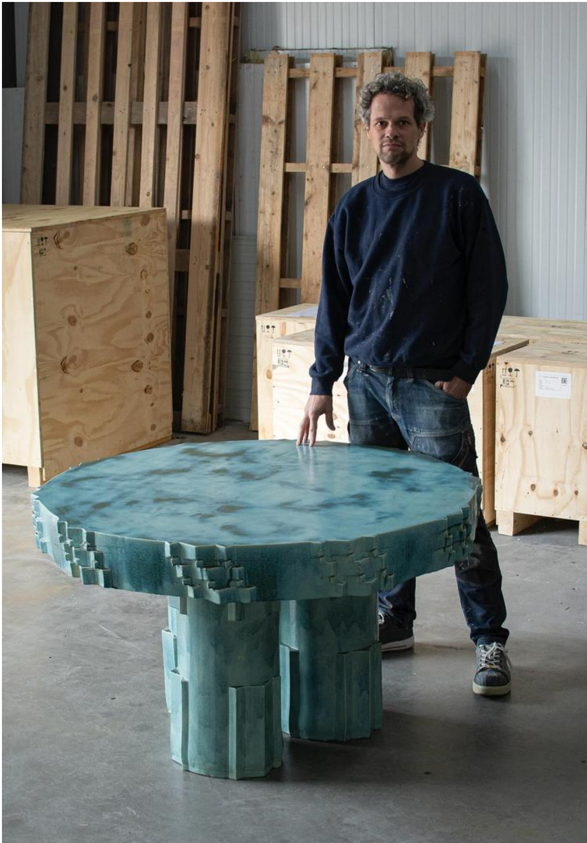
Work by Floris Wubben