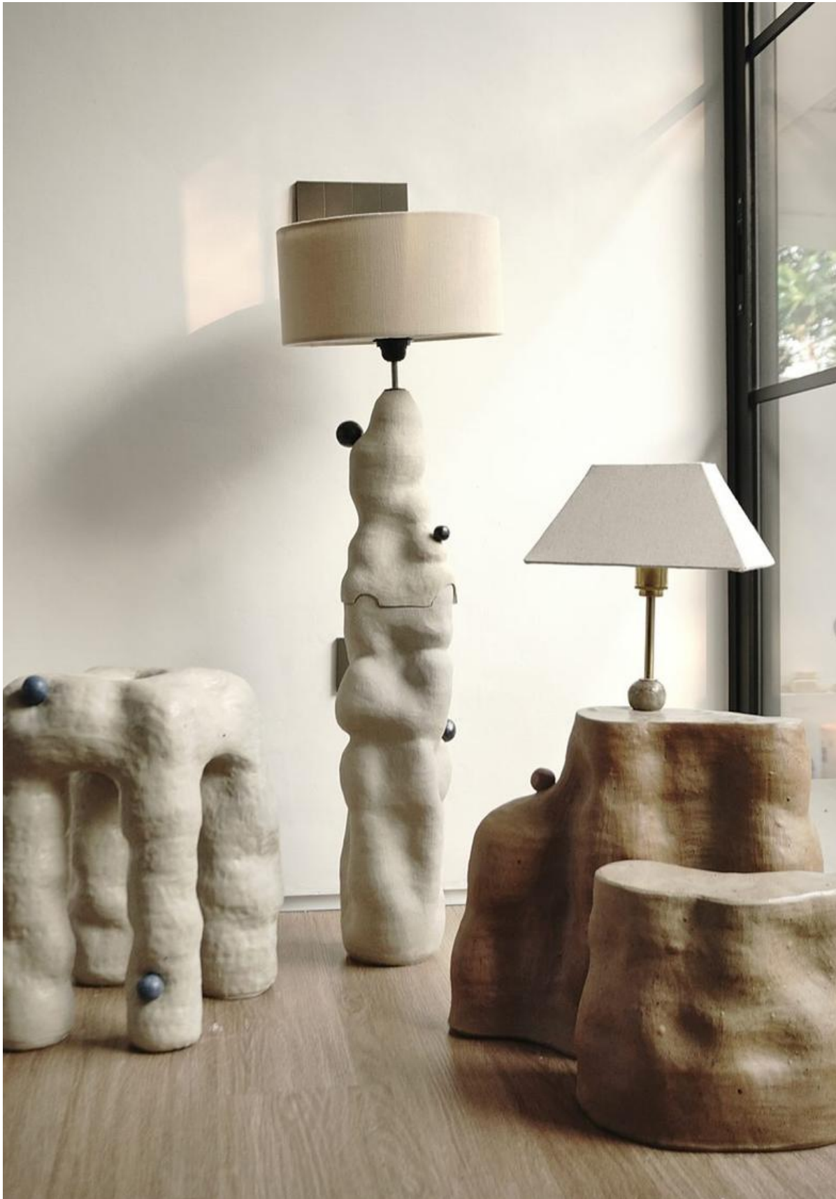
Work by Sunshine Thacker Studio