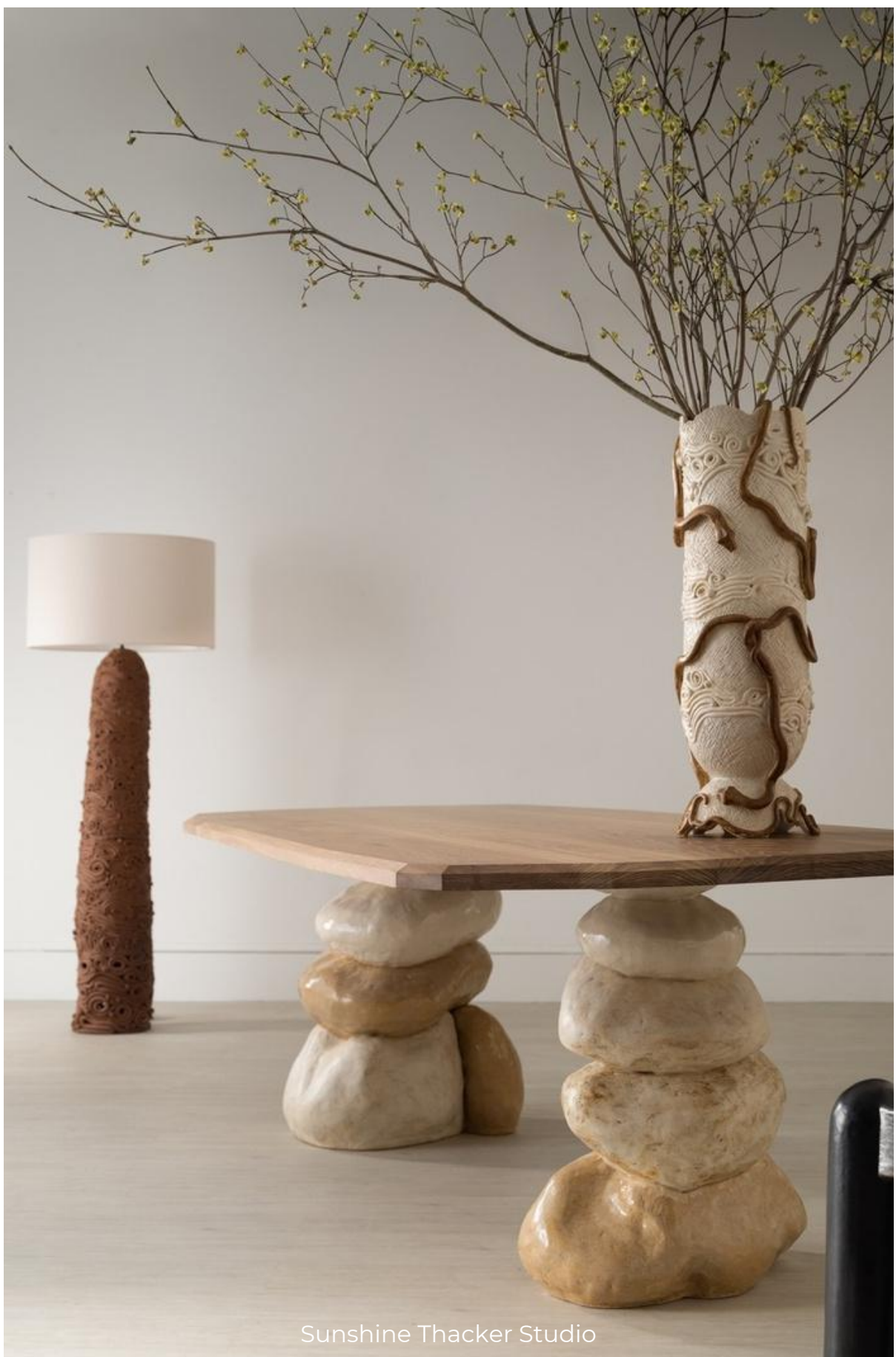
Sunshine Thacker Studio