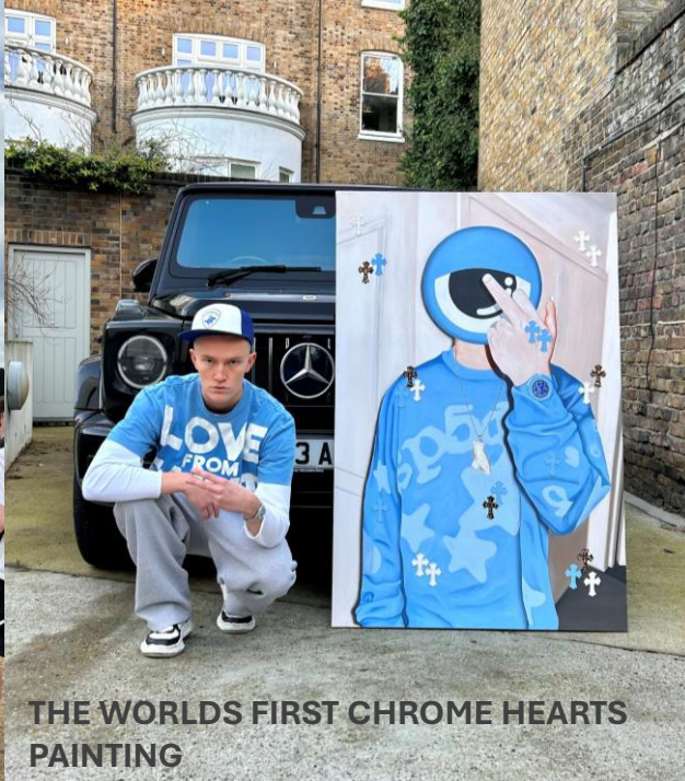
THE WORLDS FIRST CHROME HEARTS PAINTING