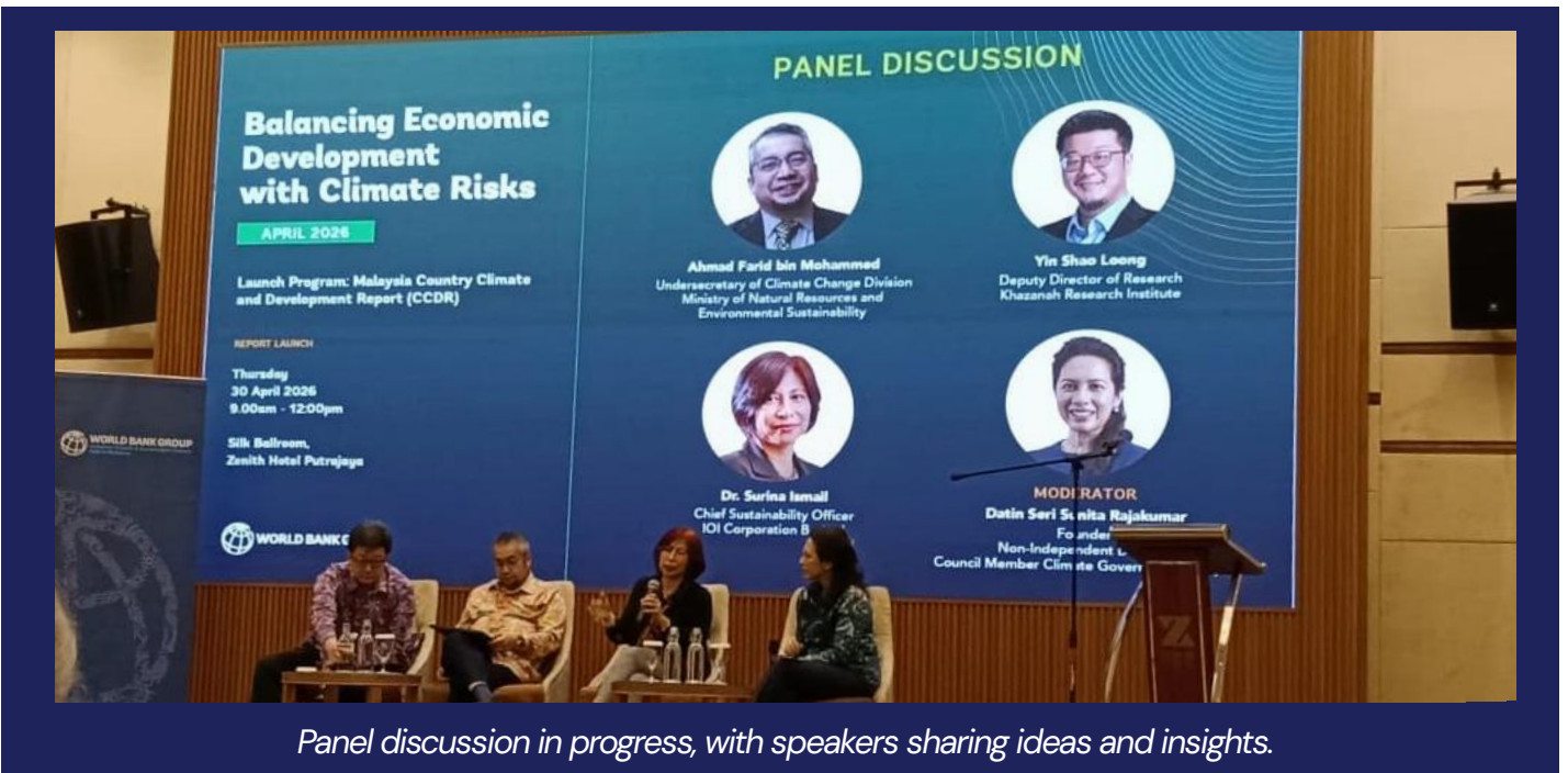
Panel discussion in progress, with speakers sharing ideas and insights.

The WORLD BANK: Launch of Malaysia Country Climate and Development Report (CCDR), held on 30 April 2026 at the Silk Ballroom, Zenith Hotel Putrajaya, brought together participants for an informative and engaging session. The report highlighted the importance of aligning Malaysia's development goals with climate objectives as the country moves towards high-income status.