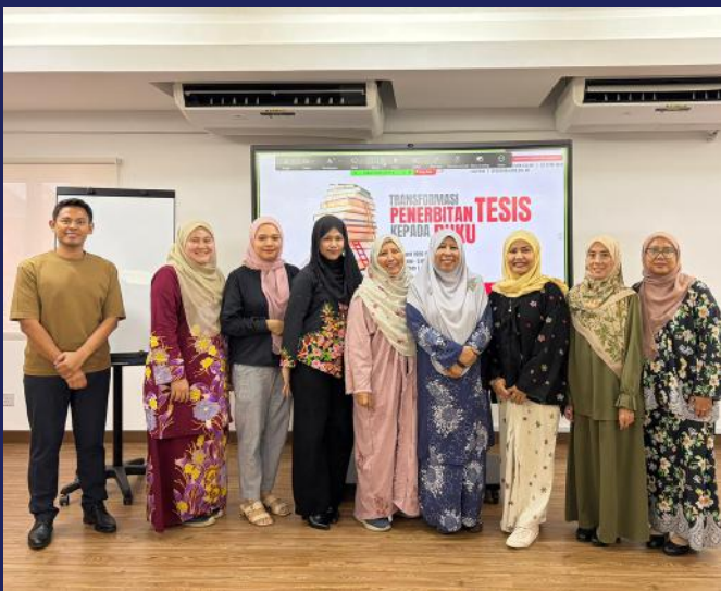
Group photo with participants and UPM Press.