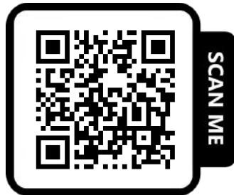
Research and Innovation