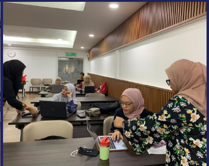
UPM Press provided explanations and sharing with participants during the session.

The two-day Workshop on Thesis-to-Book Transformation 2026 brought together academic staff to transform their theses into publishable scholarly books. UPM Press provided guidance on key processes such as structuring chapters, refining content, and preparing essential book components according to publishing standards.