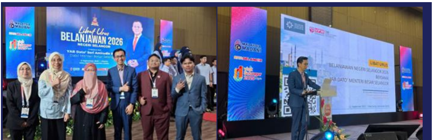
Presentation at the Sesi Libat Urus Belanjawan Negeri Selangor 2026 with Menteri Besar Selangor