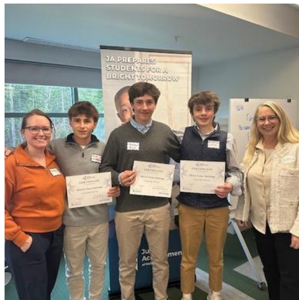
The 2024 JA Maine Titan Challenge winning team, Yarmouth High School competed in the JA USA national competition.

Remembering my own experience as one of the Erskine Academy teams, we were among the top competitors with one of our teams winning the scholarship. Now as a mentor, I use the skills I learned from the JA Titan Challenge daily, and I appreciate the ability to come back to an event that I loved so much.