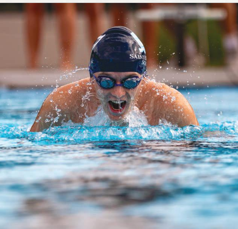
The varsity boys swimming team qualified for the Class 1A Region 2 Tournament.