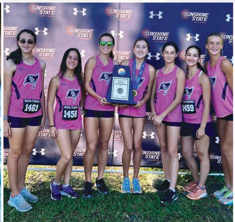
The varsity girls cross country team captured first place overall at the SSAA Championship.