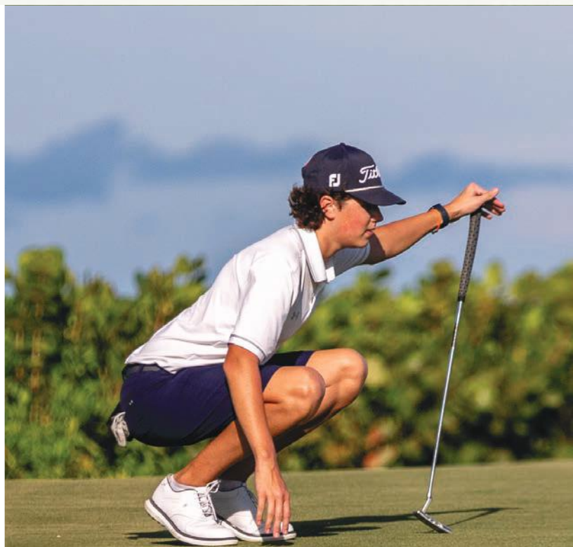
The varsity boys golf team competed in the Class 1A District 13 Championship.