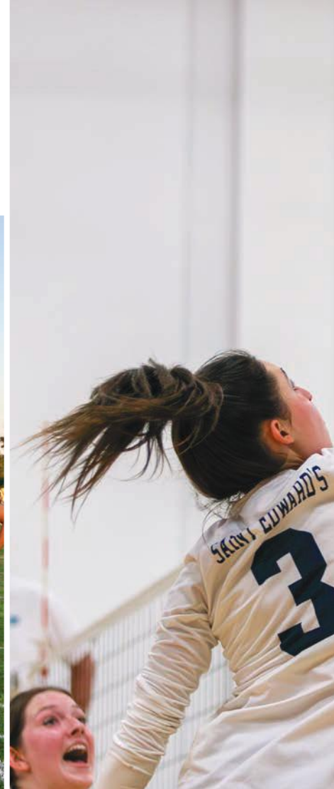
The varsity volleyball team was far as the 2A Region 2 Semifinal.