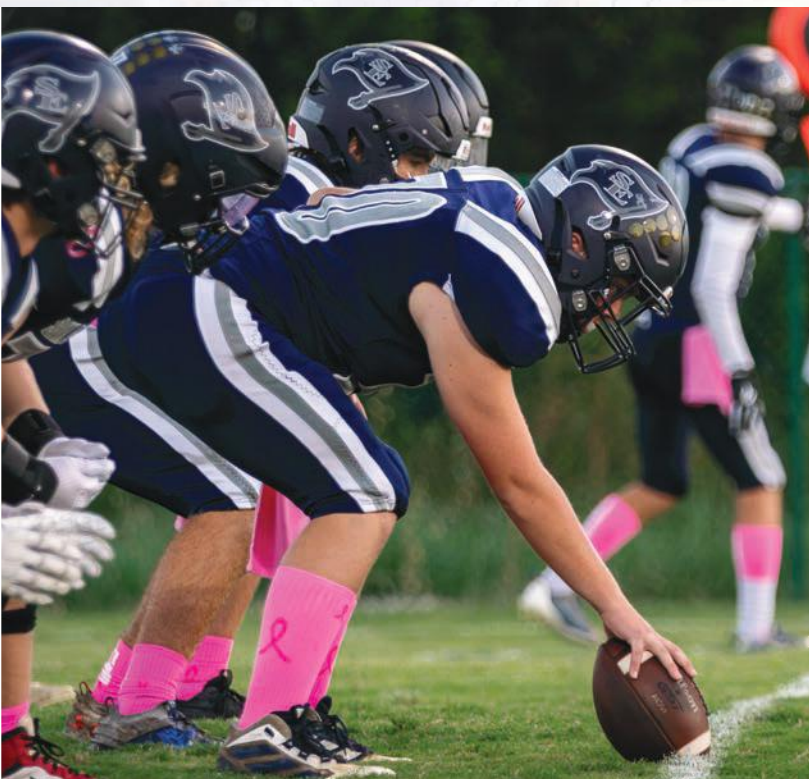
The varsity football team proved tough competitors this season, making their way to the SSAA Class 4A Semifinals.