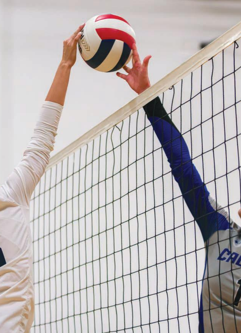
The varsity volleyball team was crowned Class 2A District 8 Champions and advanced as state finalists.