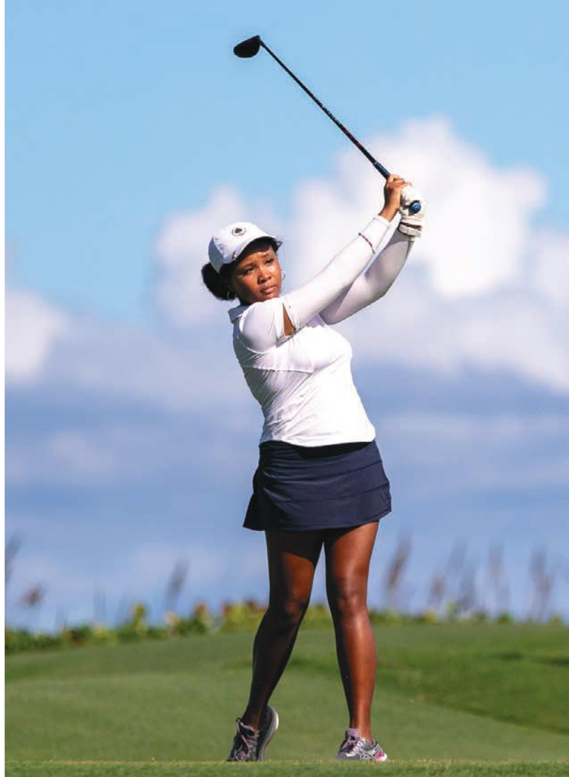
The varsity girls golf team competed at the SSAA Golf Championship.