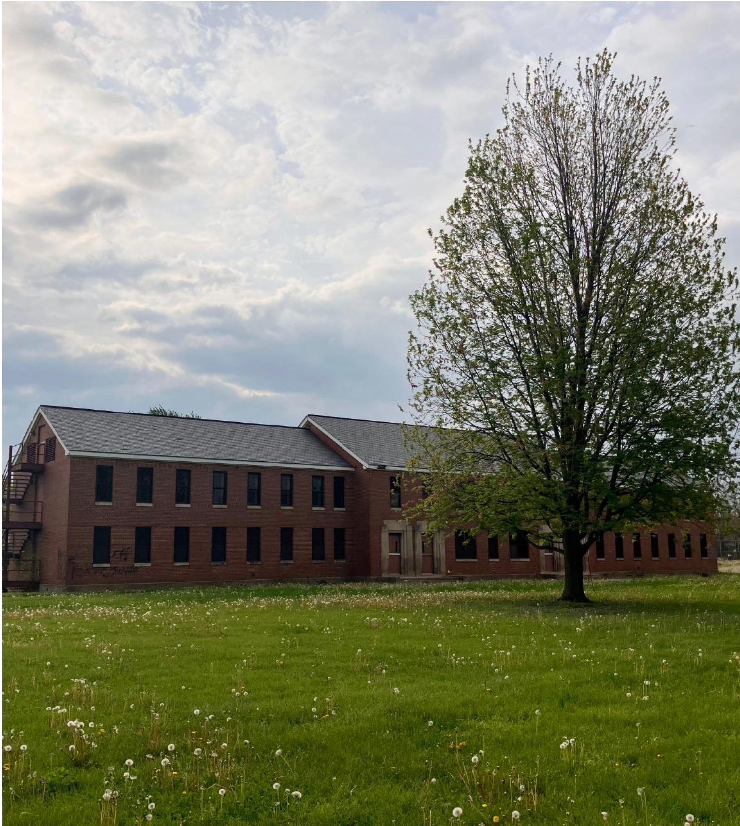
The historic architecture and central green space in the former Indiana Women's Prison site offer valuable opportunities for neighborhood redevelopment.