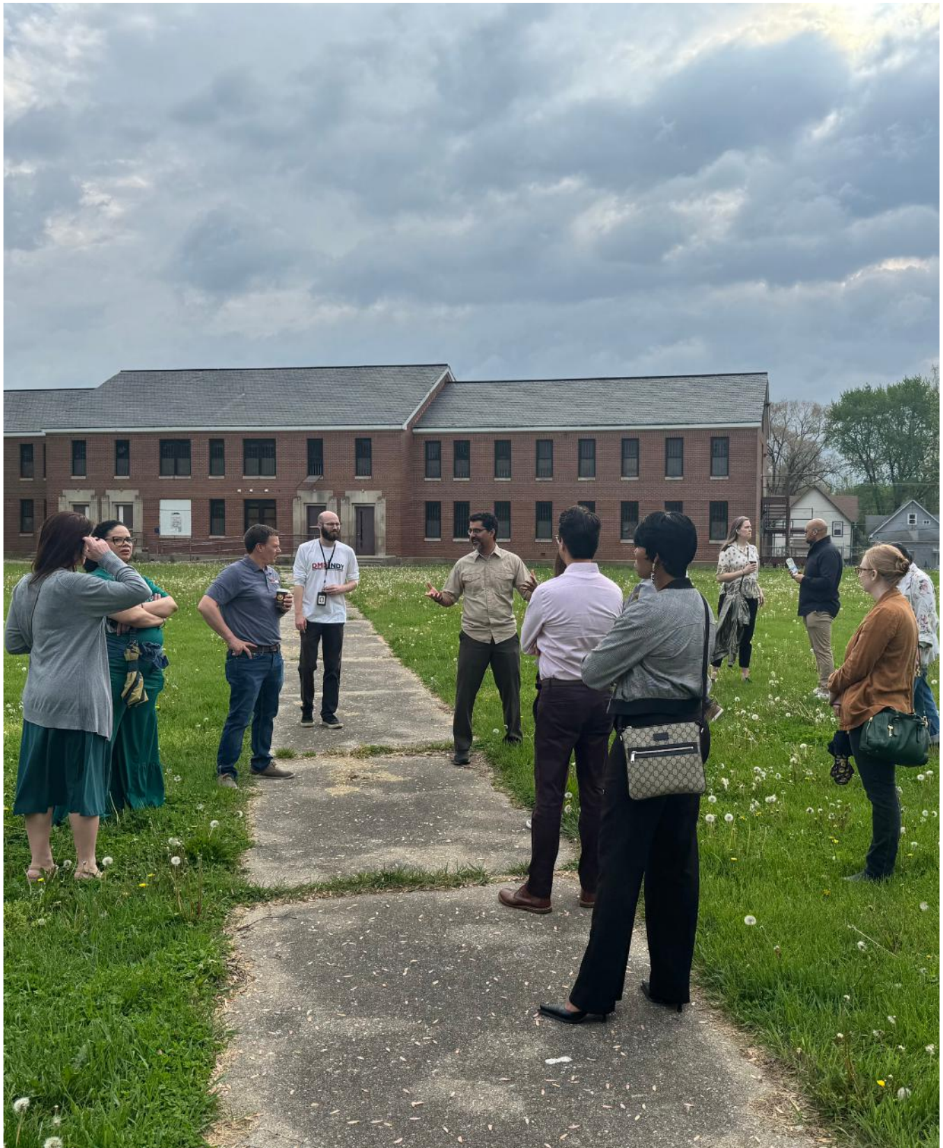
Panelists tour the grounds of the former IWP, gathering insights to inform equitable, place-based redevelopment strategies.