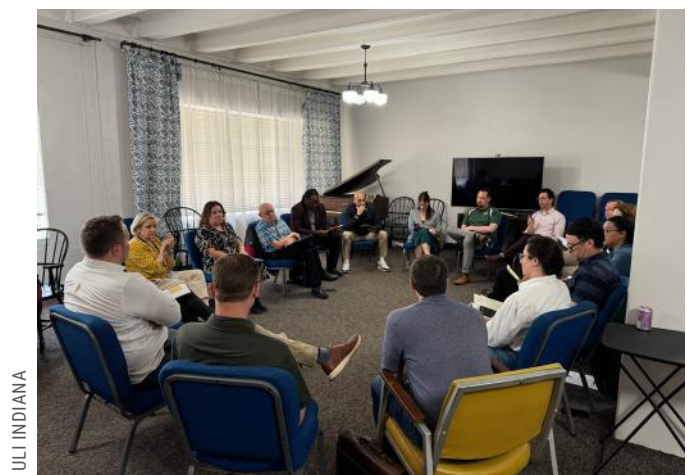
A stakeholder interview session during the ULI Indiana TAP, where community members and local leaders shared their vision for the future of the former IWP site.