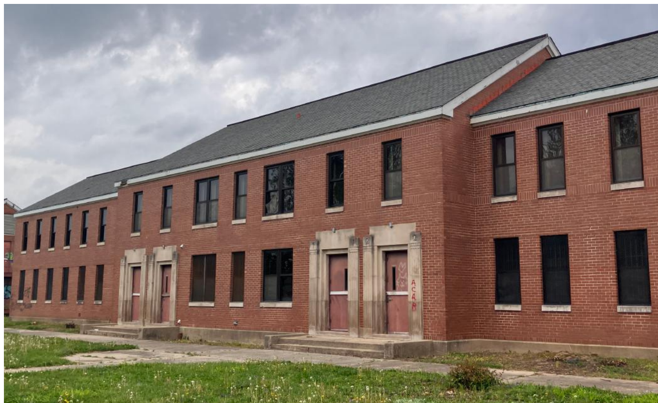
A former cellblock stands vacant on the IWP site—one of several historic structures the panel recommended for adaptive reuse in the redevelopment plan.