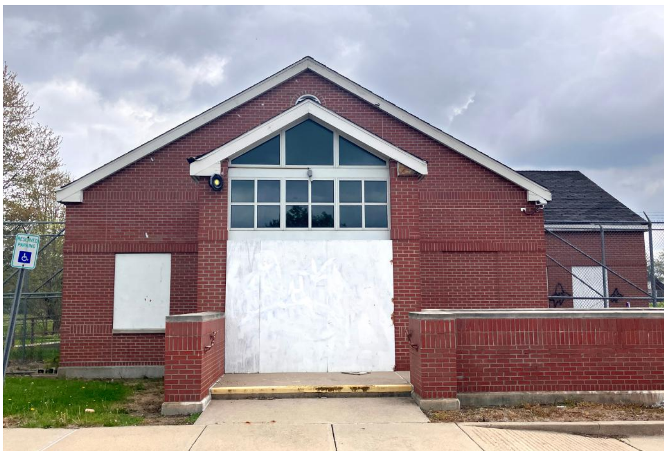
The site's historic chapel, identified by stakeholders as a meaningful structure for preservation and potential cultural or community use in the redevelopment.

the Near Eastside averages closer to $1.30 per square foot. Developers targeting the IWP site could realistically achieve rents of $1.60 per square foot for well-designed market-rate units, especially if paired with amenities and historic charm. Current market cap rate for multifamily is 6.4 percent; developers would look to achieve greater than this percentage for yield on cost to generate value on the project.