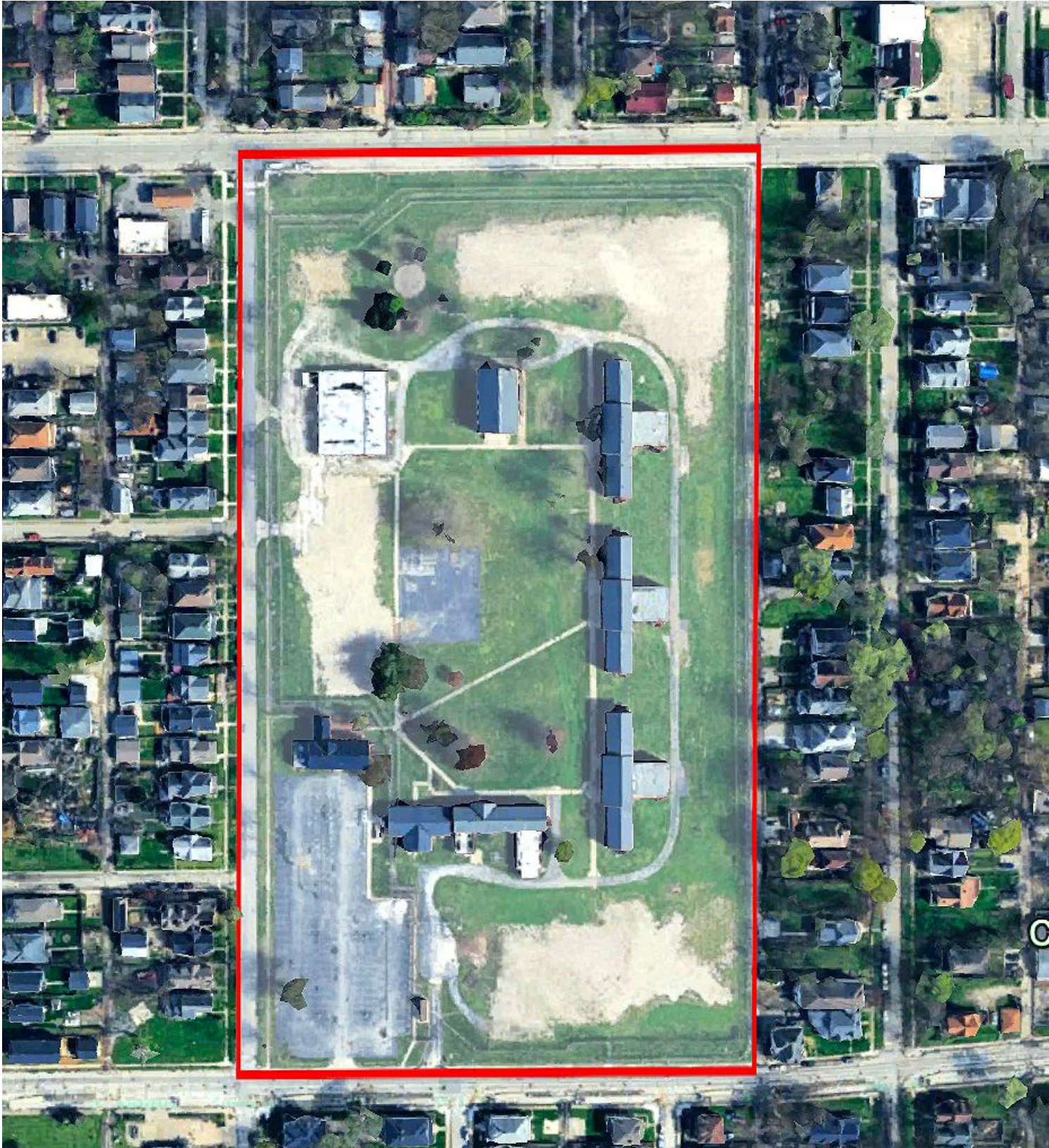
The former IWP site consists of approximately 15 acres, located in the Willard Park neighborhood on the Near Eastside of Indianapolis.