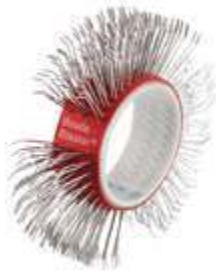
BRISTLE BLASTER® BELT, STAINLESS STEEL, 23 MM