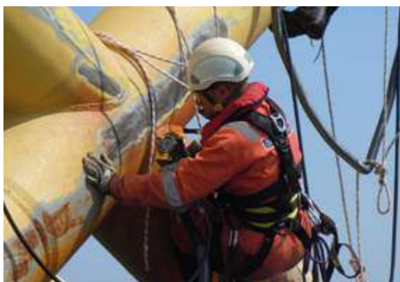
Bristle Blaster® on an offshore platform

Absolutely Gründlich stands for a thorough and sustainable long-term protection of your assets. MontiPower®-preparation from scratch!