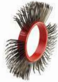
BRISTLE BLASTER® BELT, STEEL, 11 MM