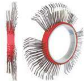
BRISTLE BLASTER® AXIAL BELT, STAINLESS STEEL, 11 MM, LEFT