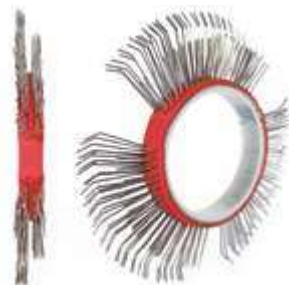
BRISTLE BLASTER® AXIAL BELT, STAINLESS STEEL, 11 MM, RIGHT