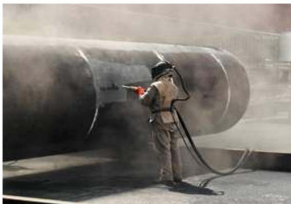
Conventional grit blasting