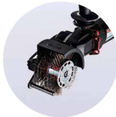
BRISTLE BLASTER® DOUBLE