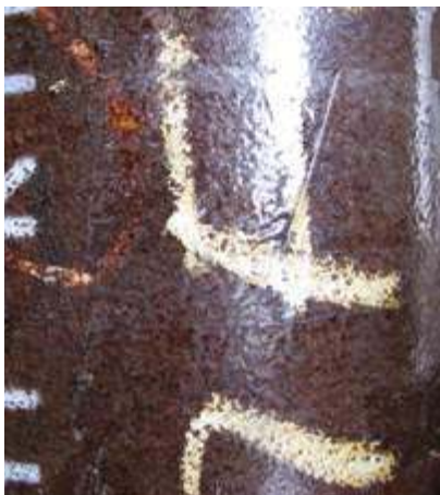
API 5L Piping