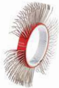
BRISTLE BLASTER® BELT, STAINLESS STEEL, 11 MM