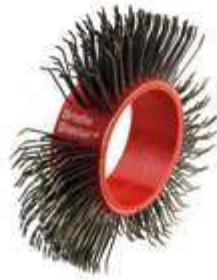
BRISTLE BLASTER® BELT, STEEL, 23 MM