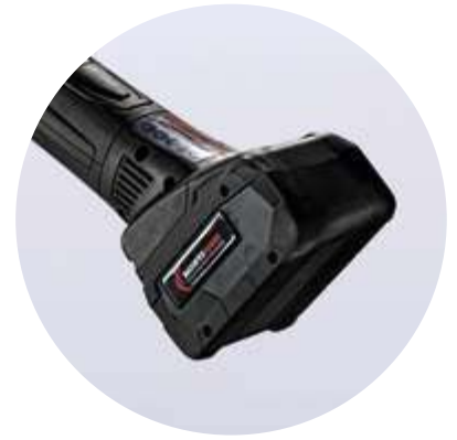
BRISTLE BLASTER® CORDLESS