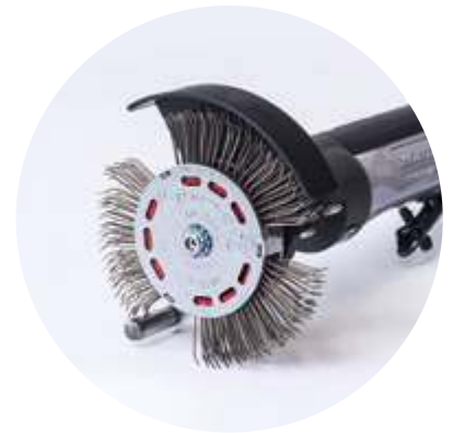
BRISTLE BLASTER® AXIAL