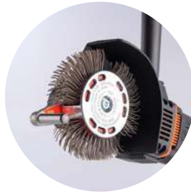
BRISTLE BLASTER® ELECTRIC