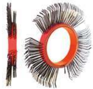
BRISTLE BLASTER® AXIAL BELT, STEEL, 11 MM, RIGHT