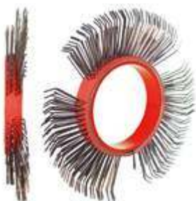
BRISTLE BLASTER® AXIAL BELT, STEEL, 11 MM, LEFT